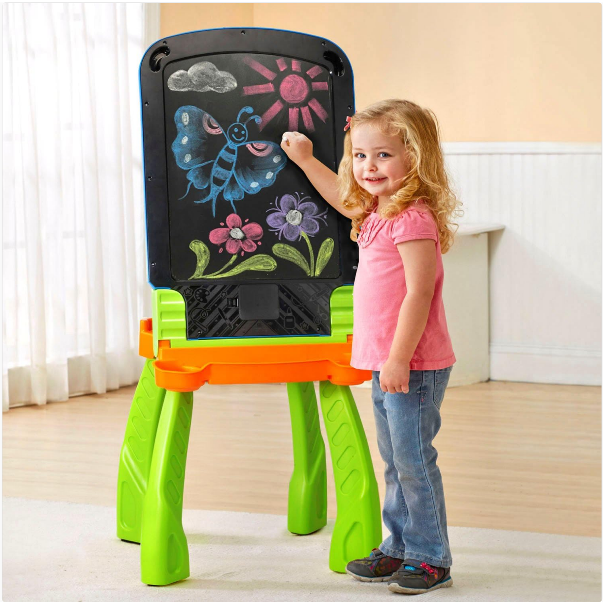
Figure 4: A child actively drawing on the chalkboard side of the VTech DigiArt Creative Easel, demonstrating its dual functionality.