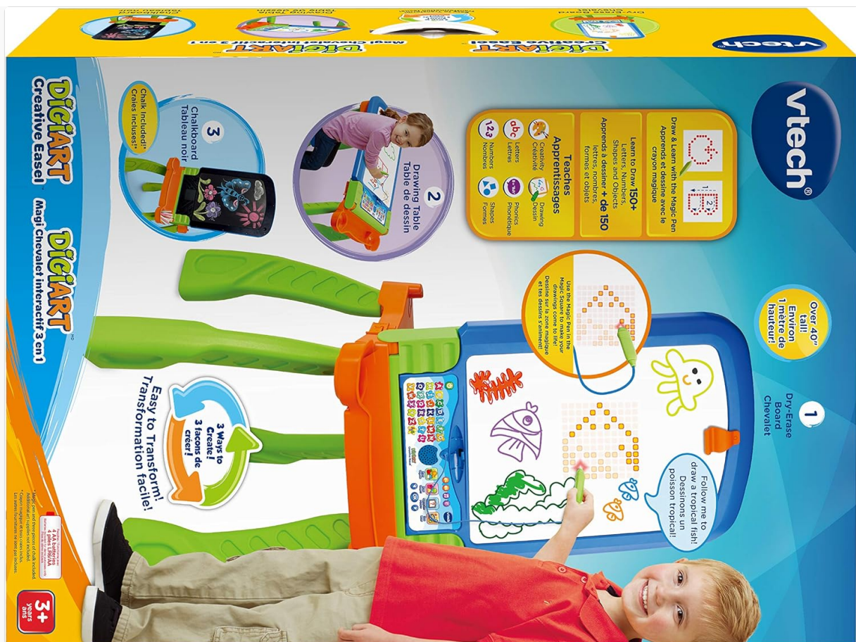
Figure 6: An illustrative diagram showcasing the three versatile configurations of the VTech DigiArt Creative Easel: upright dry-erase board, upright chalkboard, and a flat drawing table.