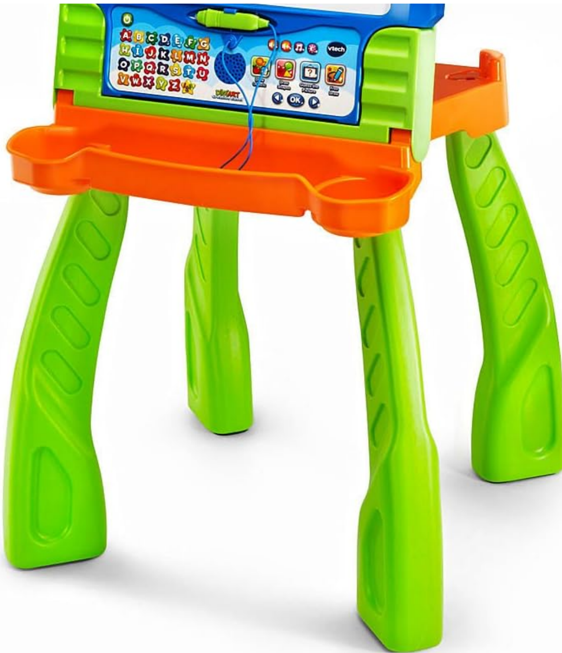
Figure 1: The VTech DigiArt Creative Easel in its upright position, displaying a child interacting with the light-up dry-erase board.