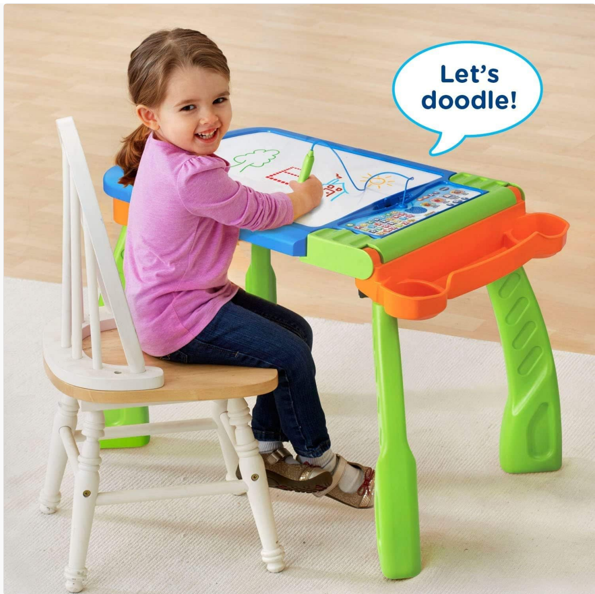
Figure 5: The VTech DigiArt Creative Easel configured as a drawing table, with a child seated and engaged in an activity using the magic pen.