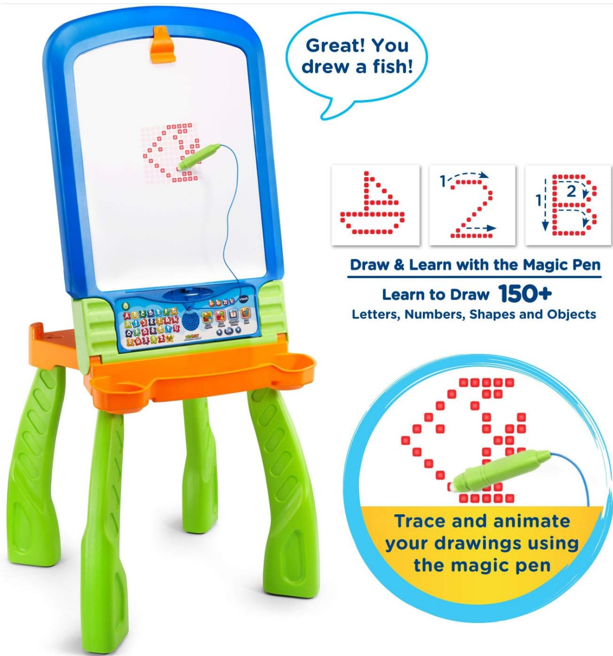
Figure 2: A child tracing shapes on the light-up dry-erase board using the magic pen, demonstrating the interactive drawing feature.