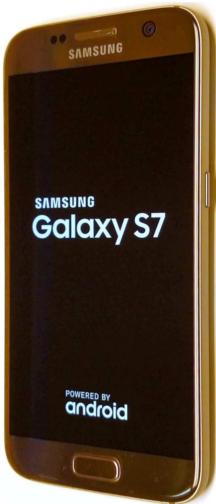
Figure 1: Front view of the Gold Samsung Galaxy S7 smartphone.