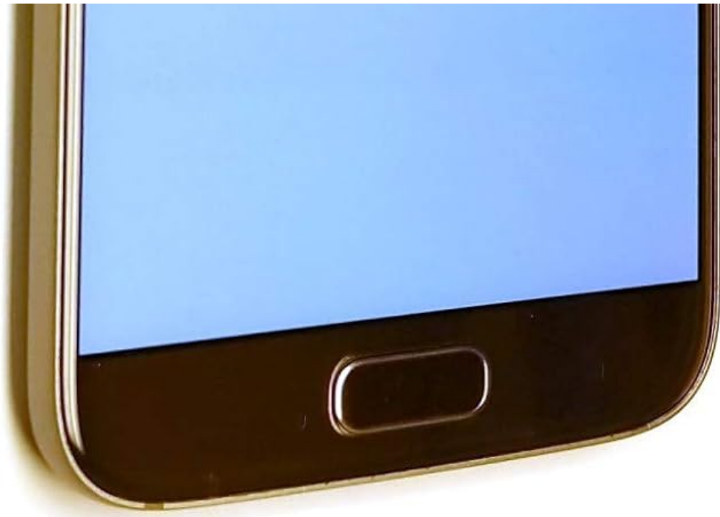
Figure 3: Samsung Galaxy S7 displaying the Verizon Wireless logo during startup.