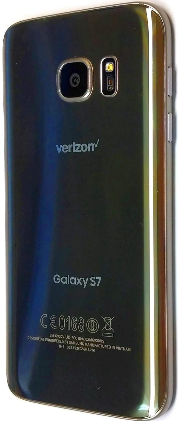
Figure 4: Rear view of the Samsung Galaxy S7, highlighting the camera lens and LED flash.