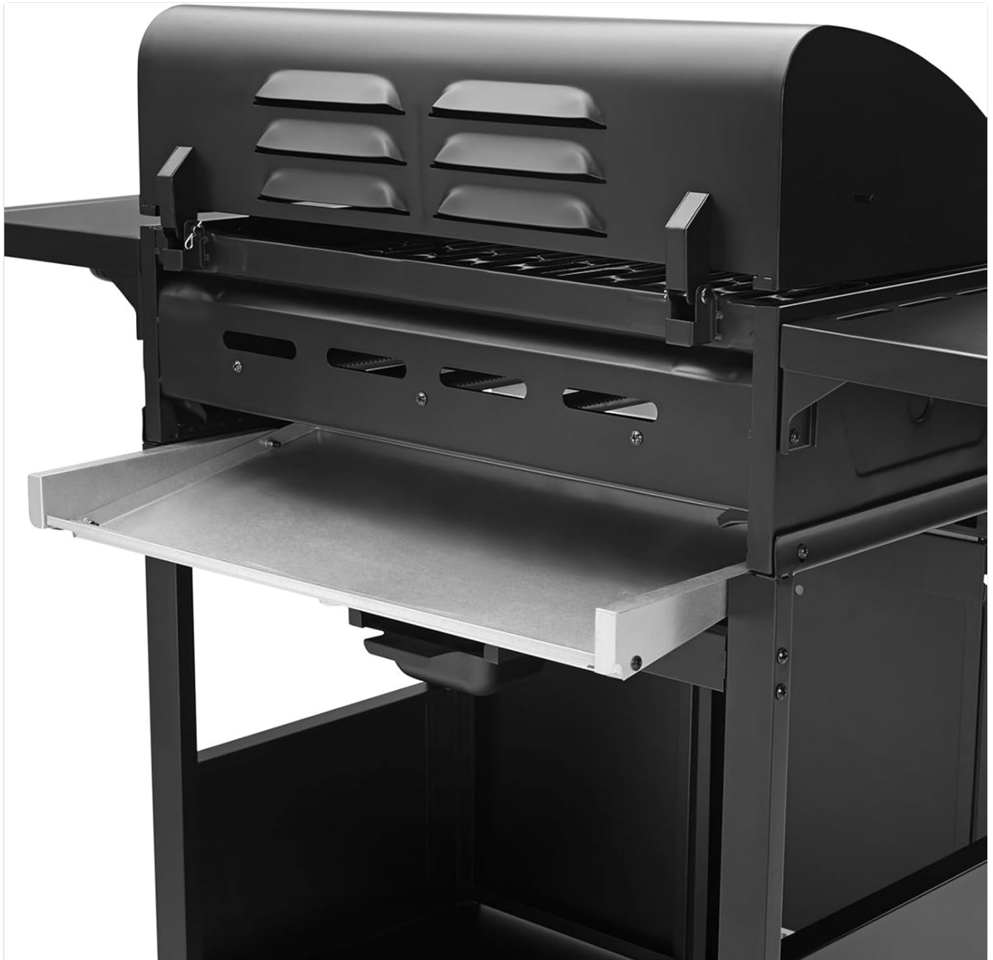
Image 4: Close-up view of the removable grease collection tray, located beneath the main grill area. This tray collects drippings and can be easily pulled out for cleaning, which is crucial for hygiene and safety.