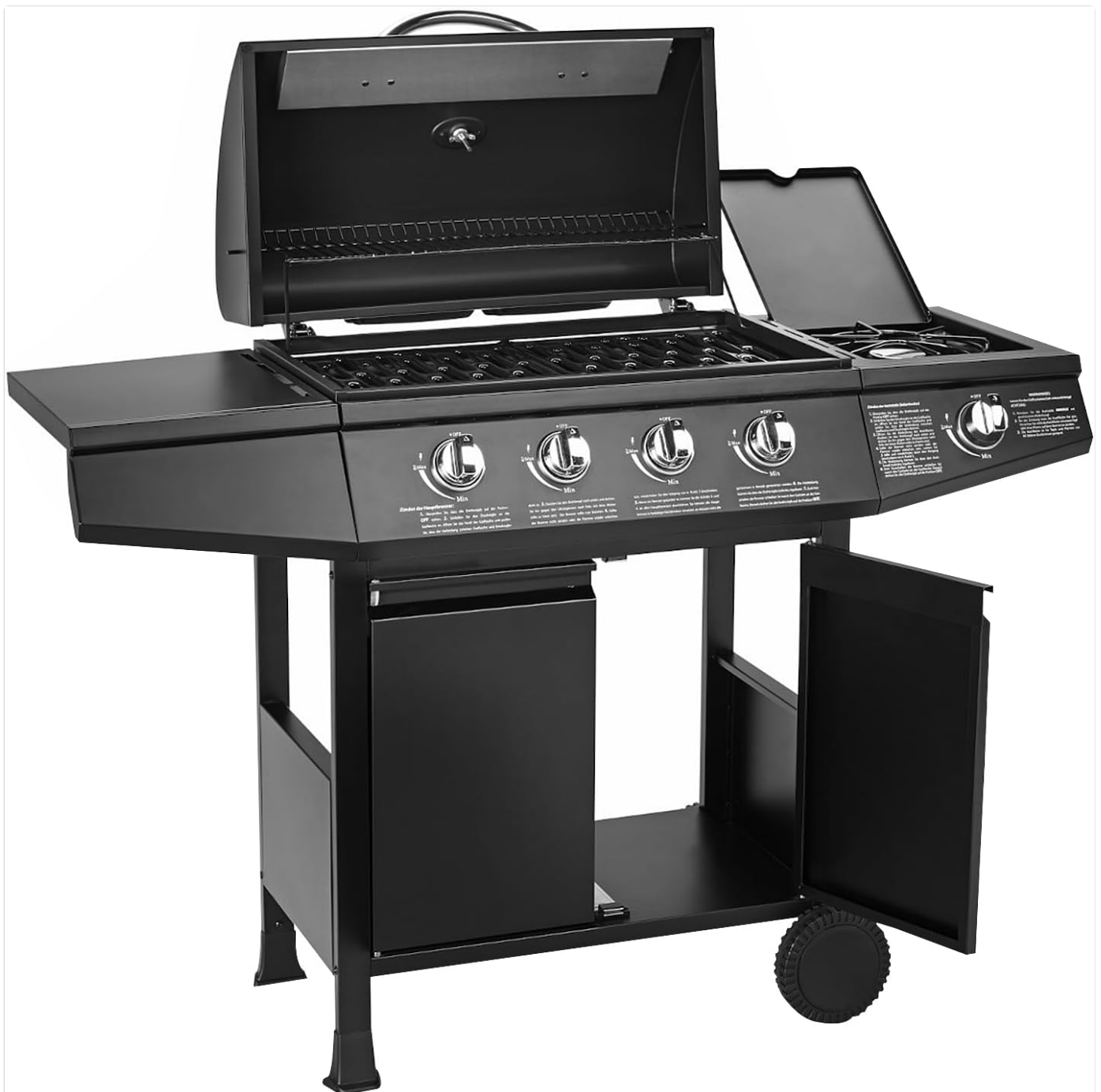
Image 1: TAINO Basic 4+1 Gas Grill with the main lid and side burner lid open, showing the grill grates and control knobs. This view illustrates the grill's open configuration, ready for use.