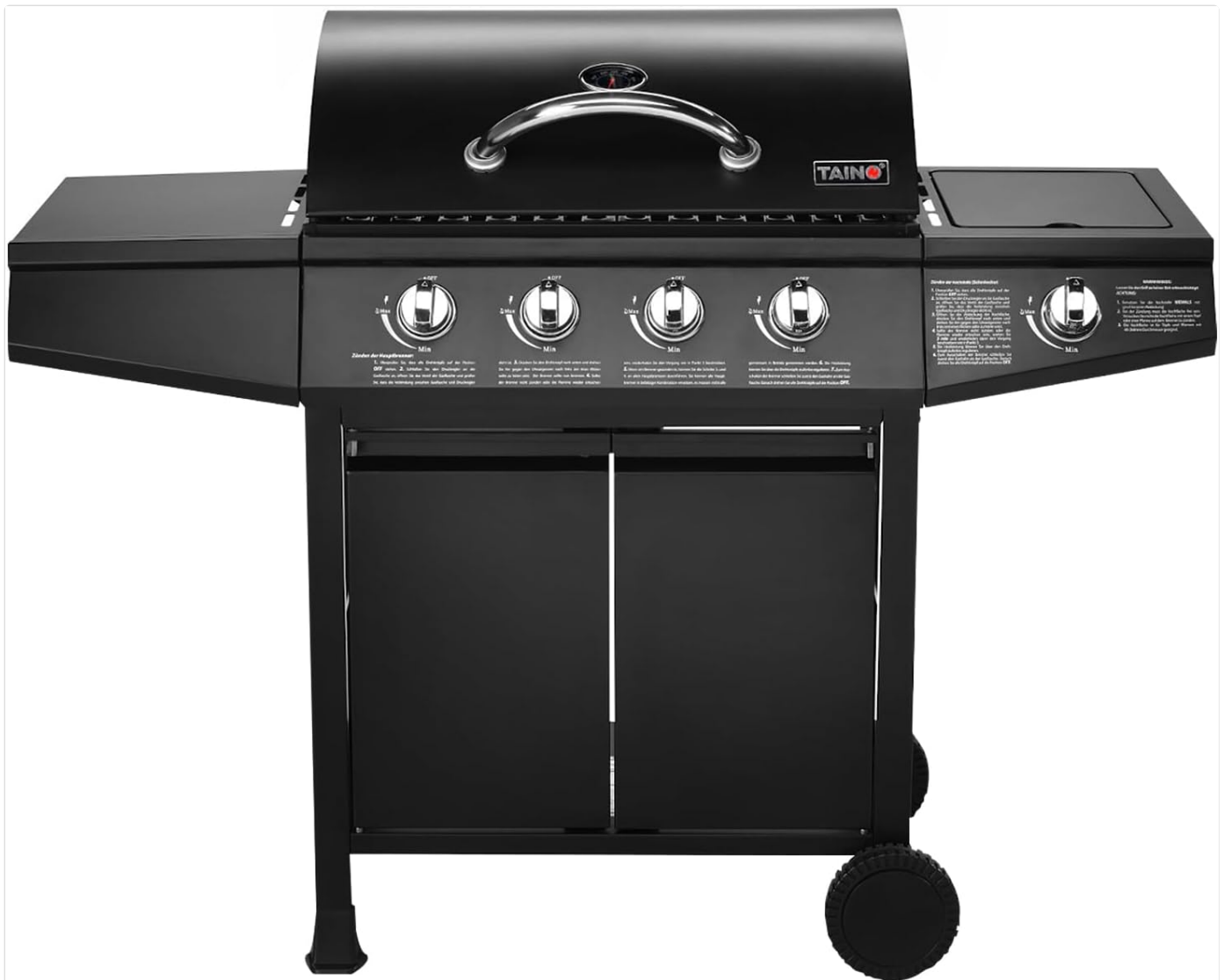
Image 3: Front view of the TAINO Basic 4+1 Gas Grill with the main lid and side burner lid closed. This image highlights the control panel with four main burner knobs and one side burner knob, along with the integrated thermometer on the main lid.