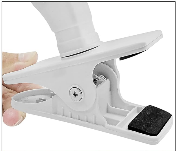
Strong Clamp with 2" Opening

Image: Detailed views of the fan's features, including the handle, thumbscrew for tilt, and 360-degree rotation capability.