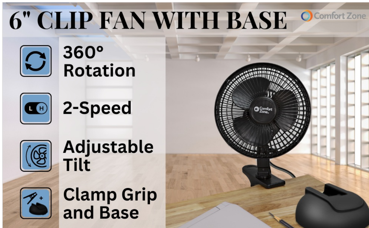
Image: The Comfort Zone 6-inch fan demonstrating its versatility with both clip and desk base options.