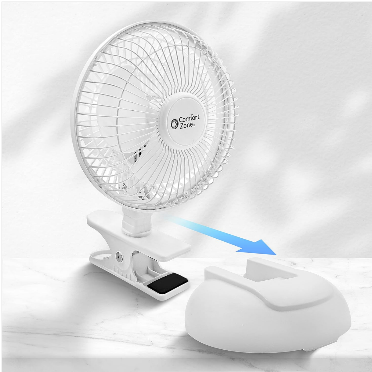
Image: The Comfort Zone 6-inch fan shown with its removable desk base, ready for tabletop use.