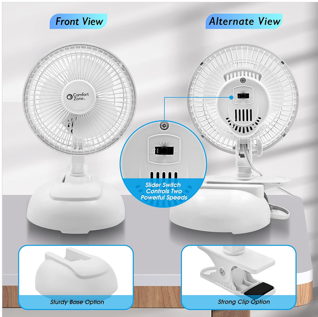
Image: Front and rear views of the fan, illustrating the slider switch for selecting low, high, or off settings.