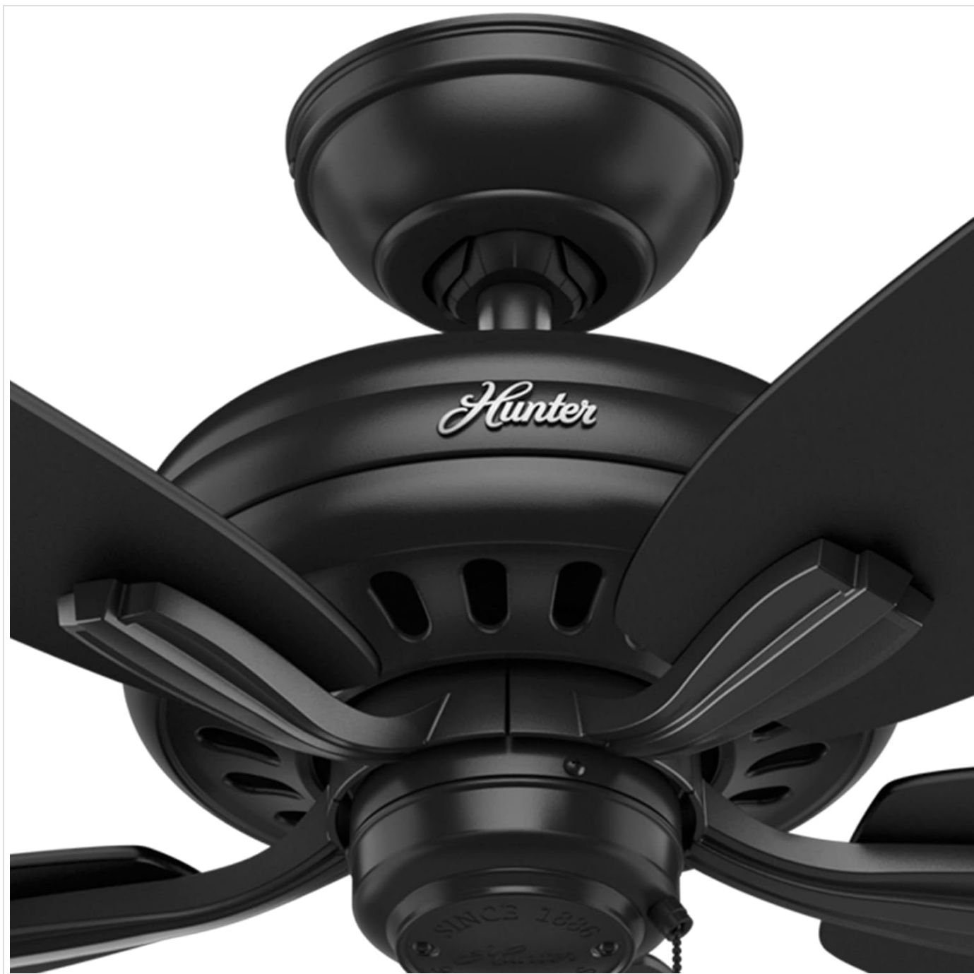
Figure 3.4: Fan Canopy. This image shows the top portion of the fan, including the canopy that covers the electrical connections and mounting bracket.