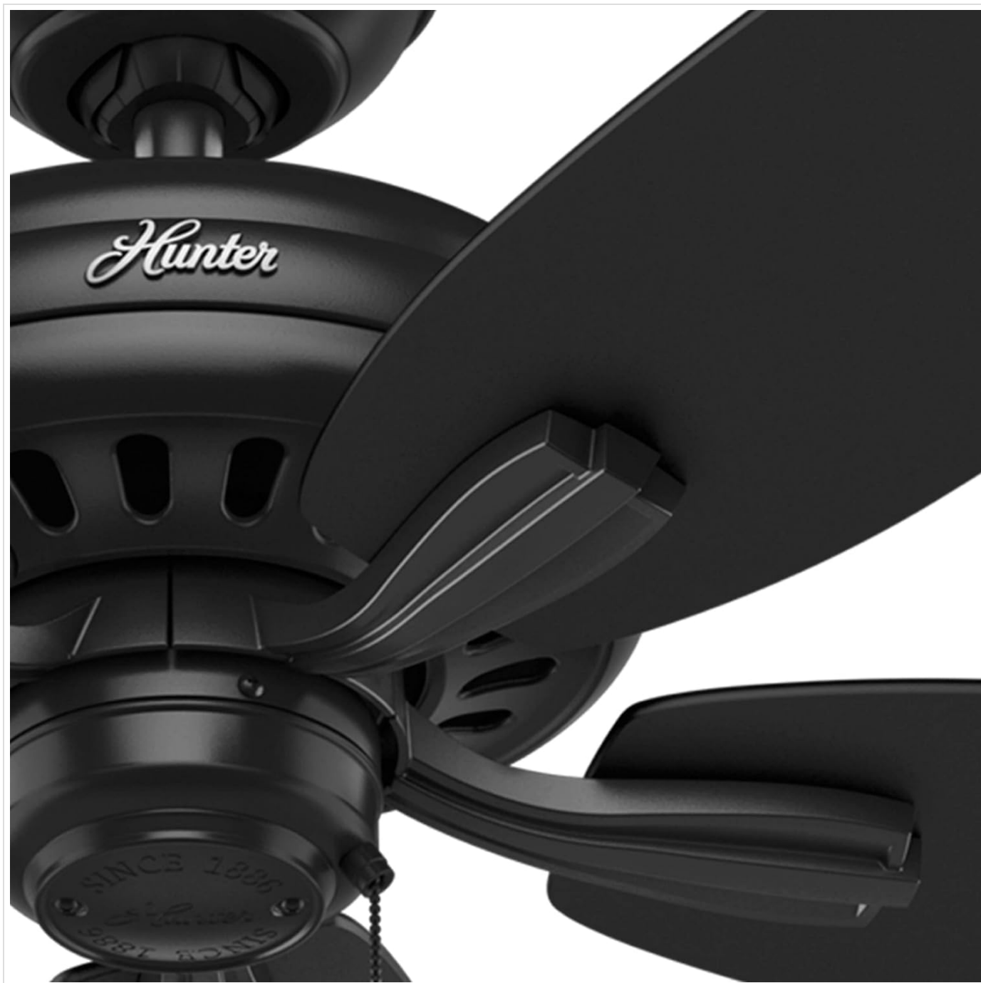
Figure 3.3: Blade Attachment Detail. This close-up view illustrates how the fan blades are securely attached to the motor housing.