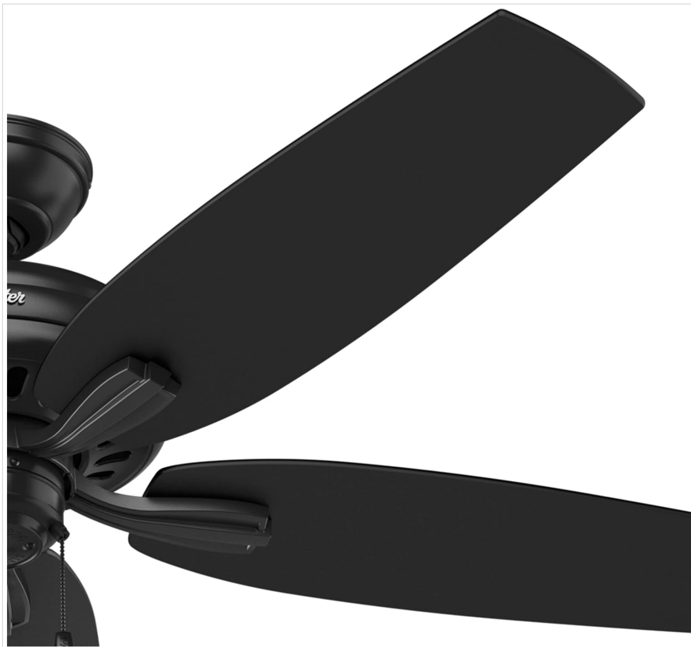
Figure 4.4: Reversible Blades (Matte Black Side). This image displays the matte black side of the fan blades, providing an alternative look to match different interior designs.