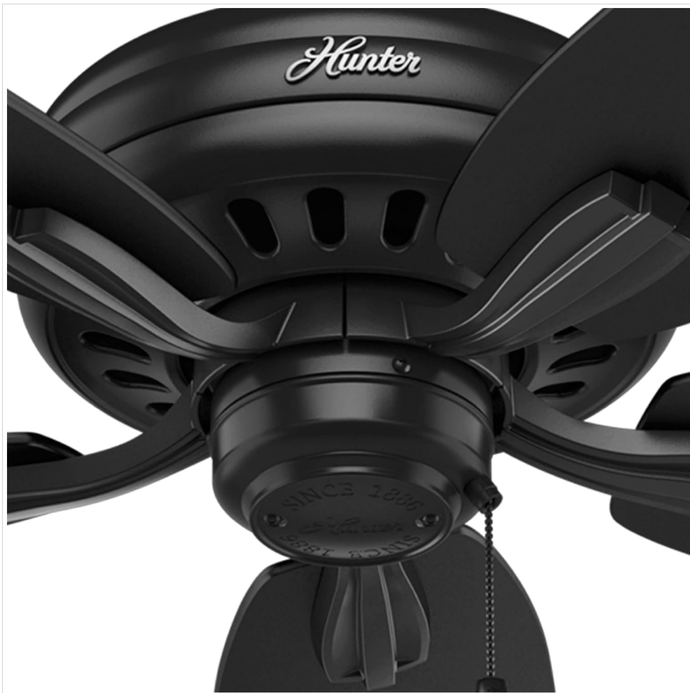
Figure 4.1: Pull Chain Mechanism. This close-up shows the pull chain extending from the fan's motor housing, which is used to control the fan's speed settings.