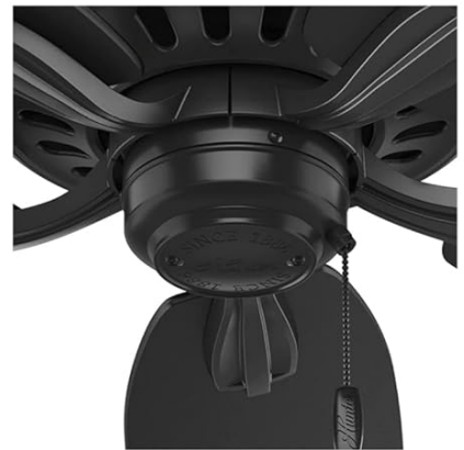
Figure 4.2: Reversible Blades Overview. This image illustrates the fan's 52-inch span and highlights the reversible nature of the blades, which feature both dark walnut and matte black finishes.