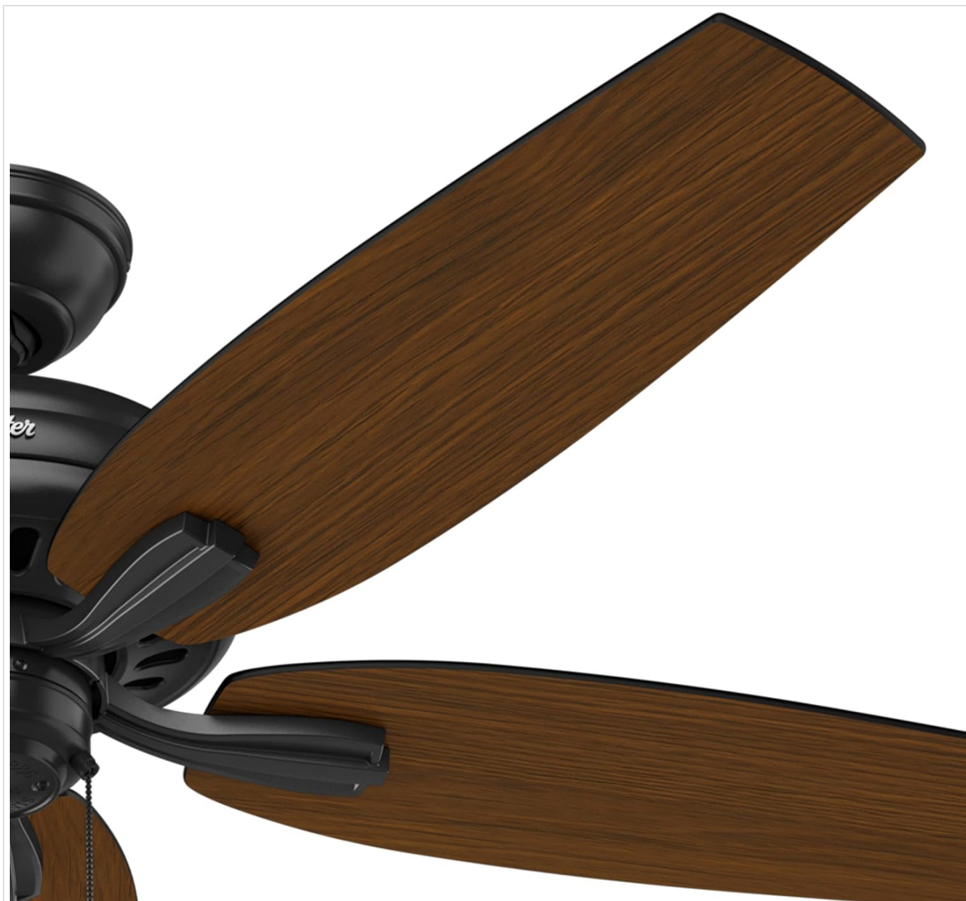
Figure 4.3: Reversible Blades (Dark Walnut Side). This image highlights the dark walnut side of the fan blades, which can be reversed to show the matte black finish, offering aesthetic versatility.