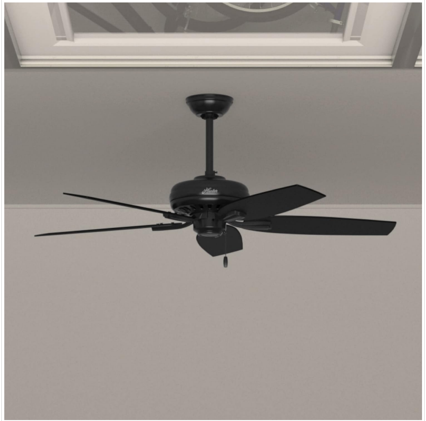
Figure 3.2: Installed Ceiling Fan. This image shows the Hunter Newsome fan mounted to a ceiling, demonstrating its appearance in a typical room setting.

fan. If you are uncomfortable with electrical work, it is recommended to consult a qualified electrician.