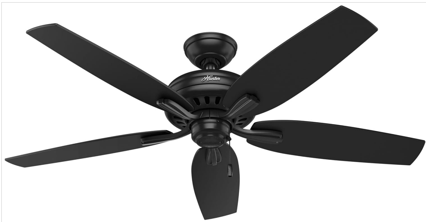
Figure 1.1: Hunter Newsome 52-inch Ceiling Fan. This image displays the complete assembly of the matte black ceiling fan, showcasing its design and five blades.

This manual provides detailed instructions for the installation, operation, and maintenance of your Hunter Newsome 52-inch Matte Black Indoor/Outdoor Ceiling Fan. Please read this manual thoroughly before beginning installation or operation to ensure safe and efficient use of your fan.