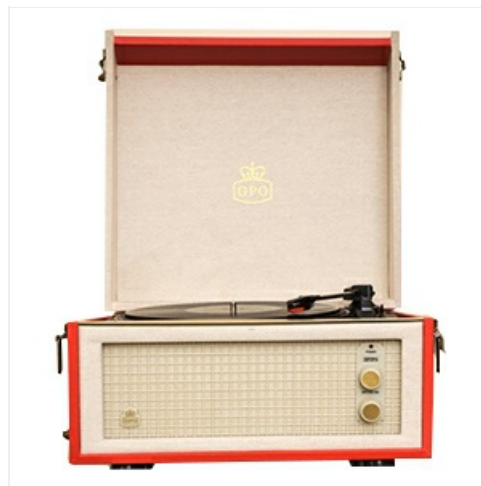
Figure 2: Turntable platter and tonearm.