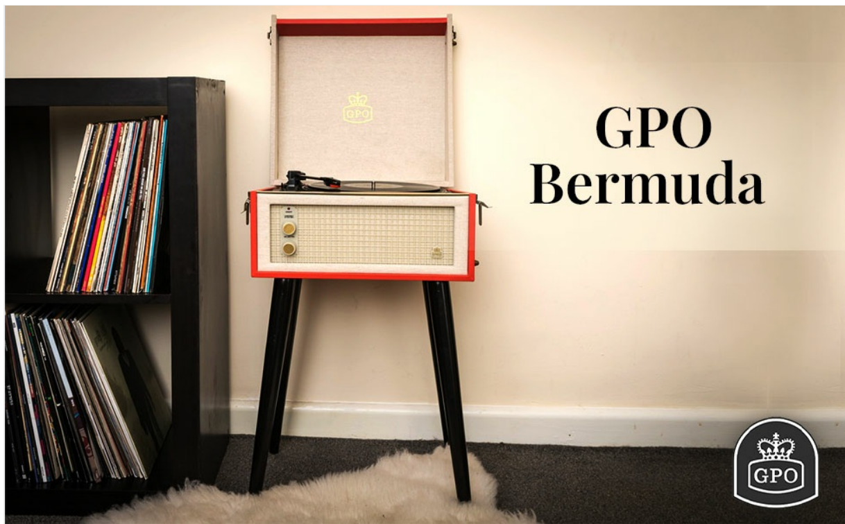
Figure 1: GPO Bermuda Classic Turntable with removable legs.