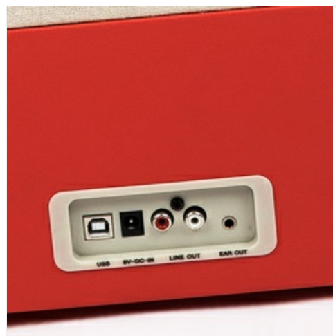
Figure 3: Rear connection ports.