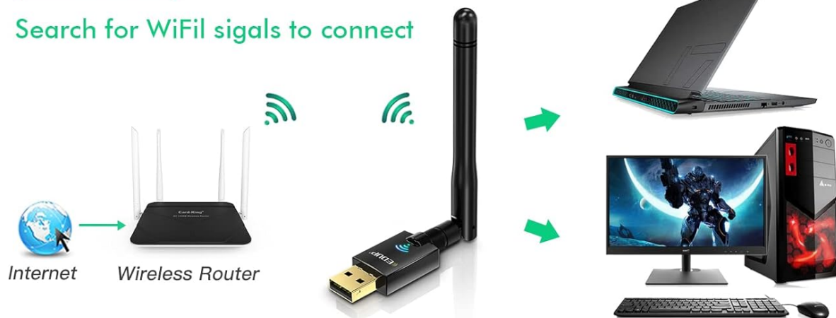
Image: Visual guide demonstrating the connection of the EDUP USB WiFi adapter to both laptop and desktop computers.