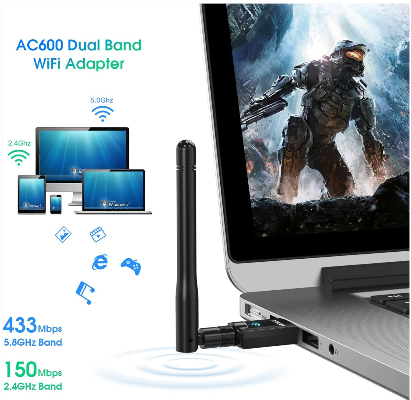
Image: This diagram shows the adapter's capability to connect to both 2.4GHz and 5GHz Wi-Fi bands, indicating different devices connected to each band.