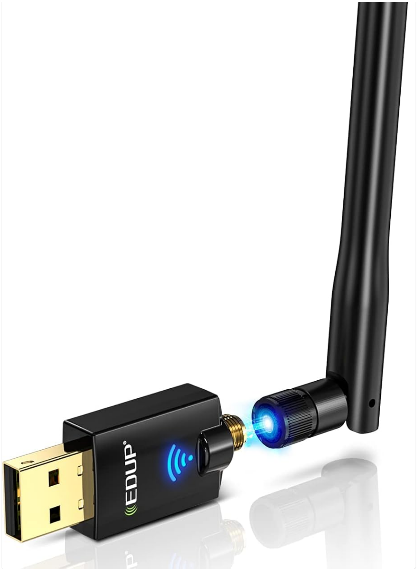
Image: The EDUP AC600M USB WiFi Adapter with its external antenna.