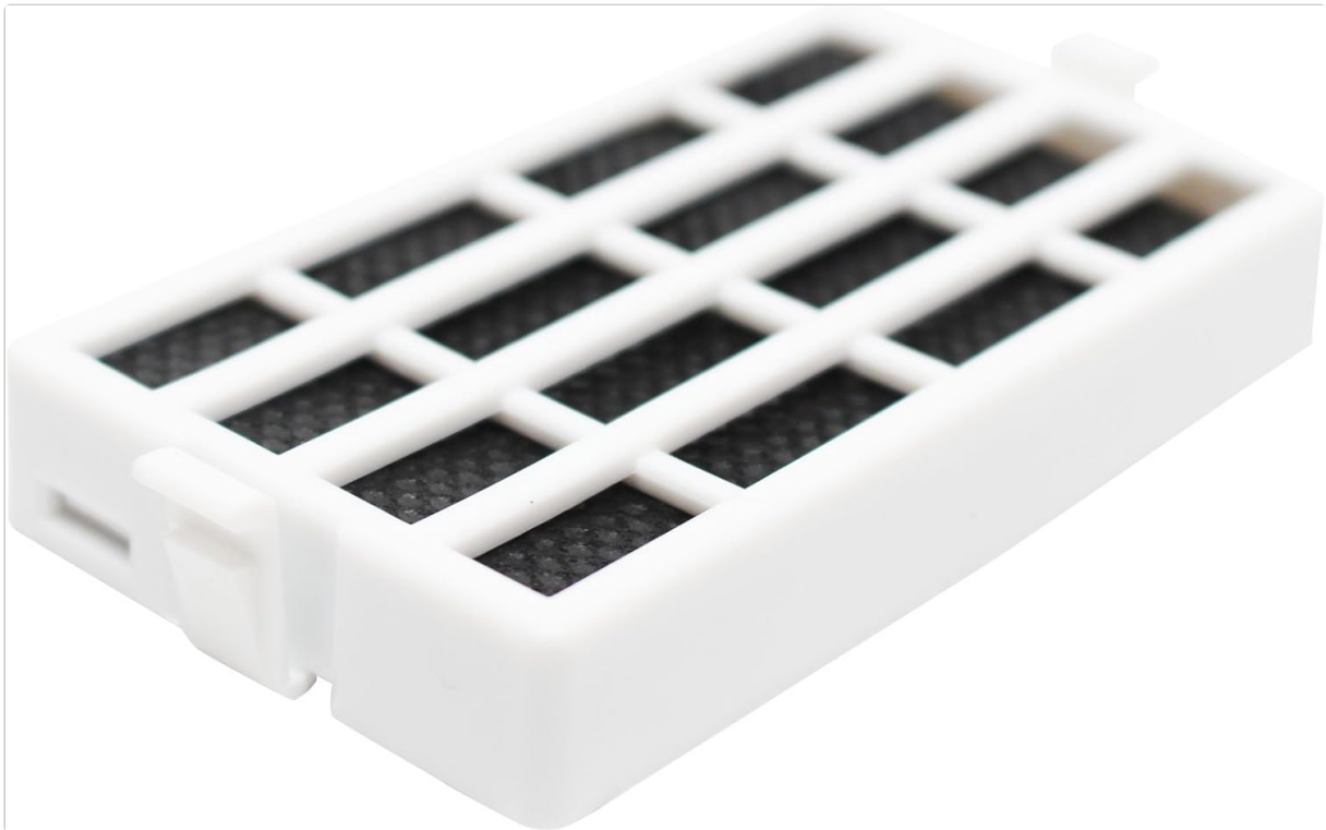
Image 2: Angled view of the Denali Pure Refrigerator Air Filter, showing its compact design and side tabs for installation.