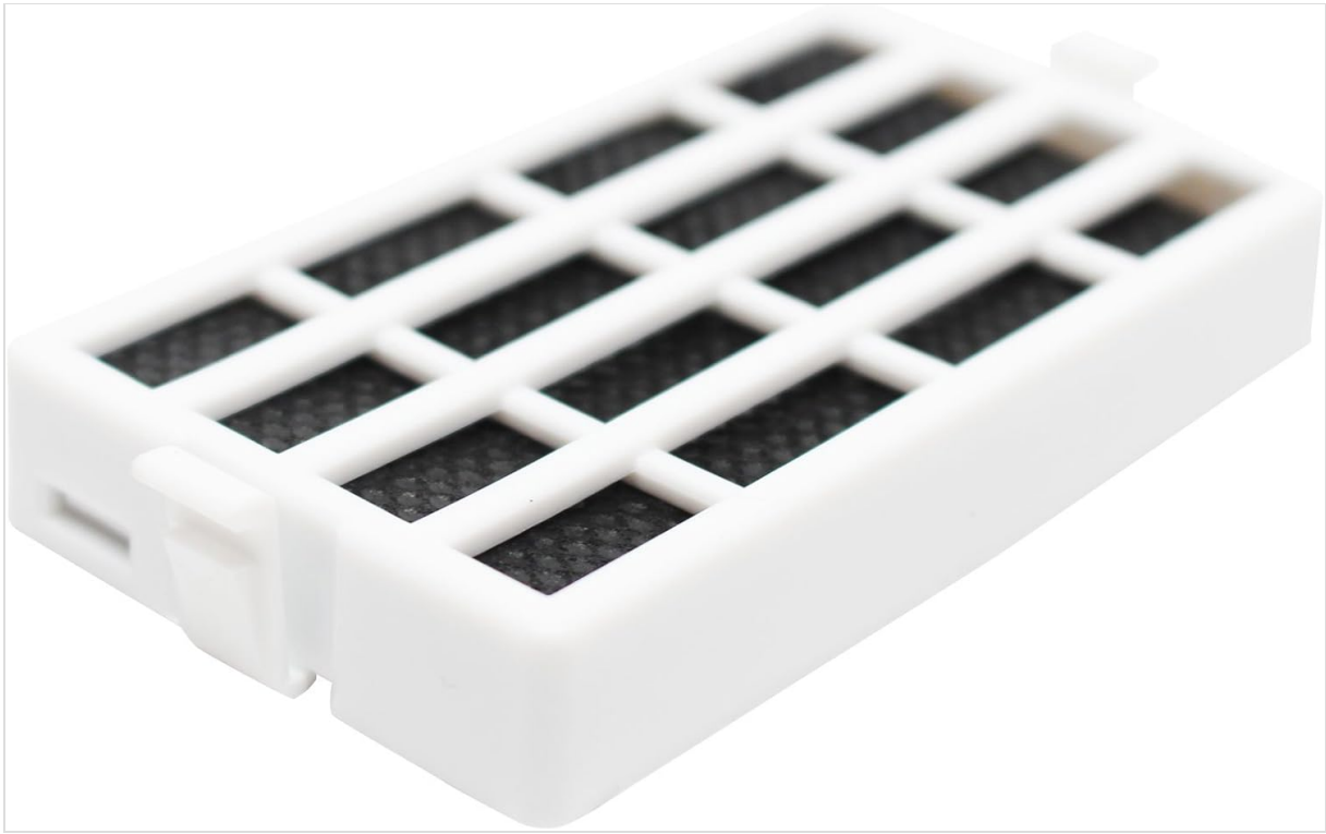
Figure 2: Angled view of the Denali Pure Refrigerator Air Filter.