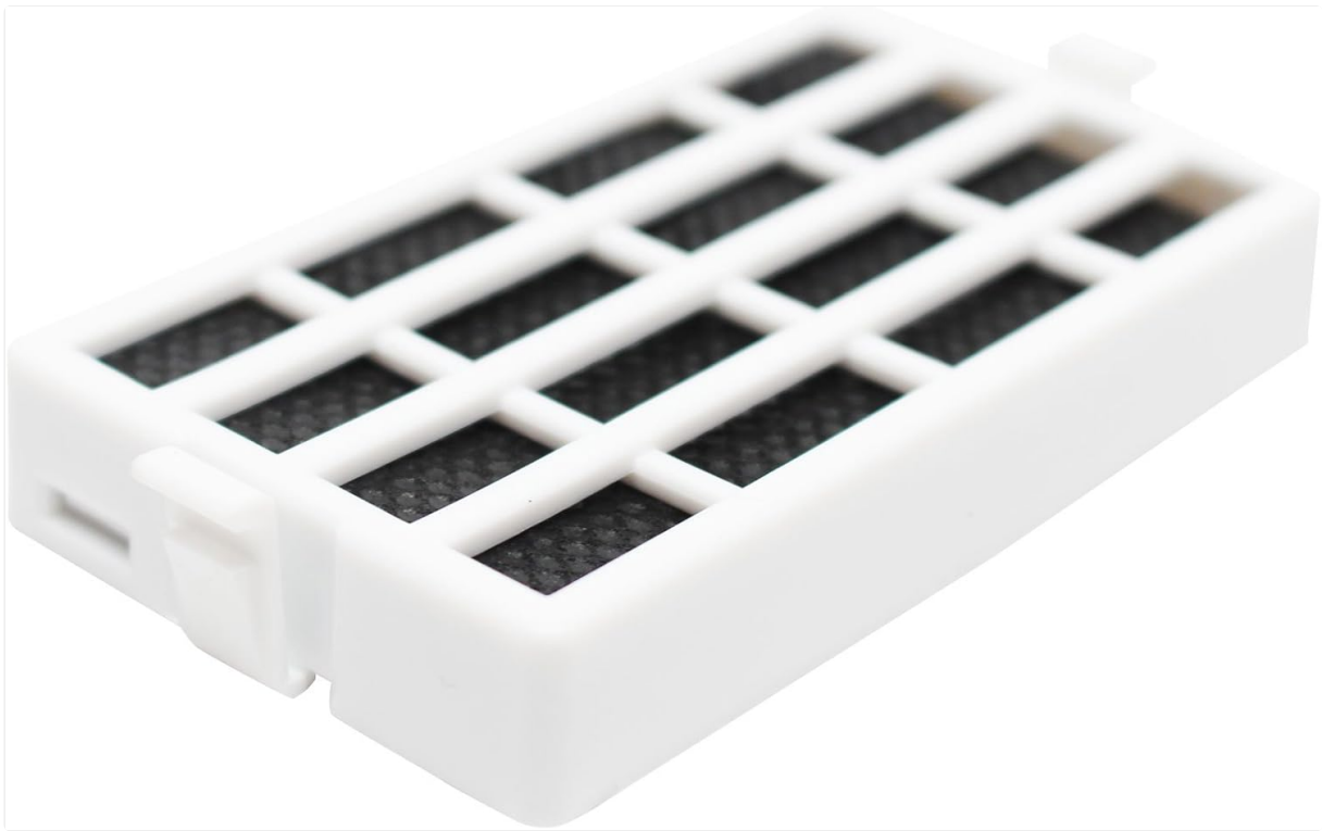
Image 4.1: Angled view of the Denali Pure Refrigerator Air Filter, showing its compact design and side tabs for secure fitting.