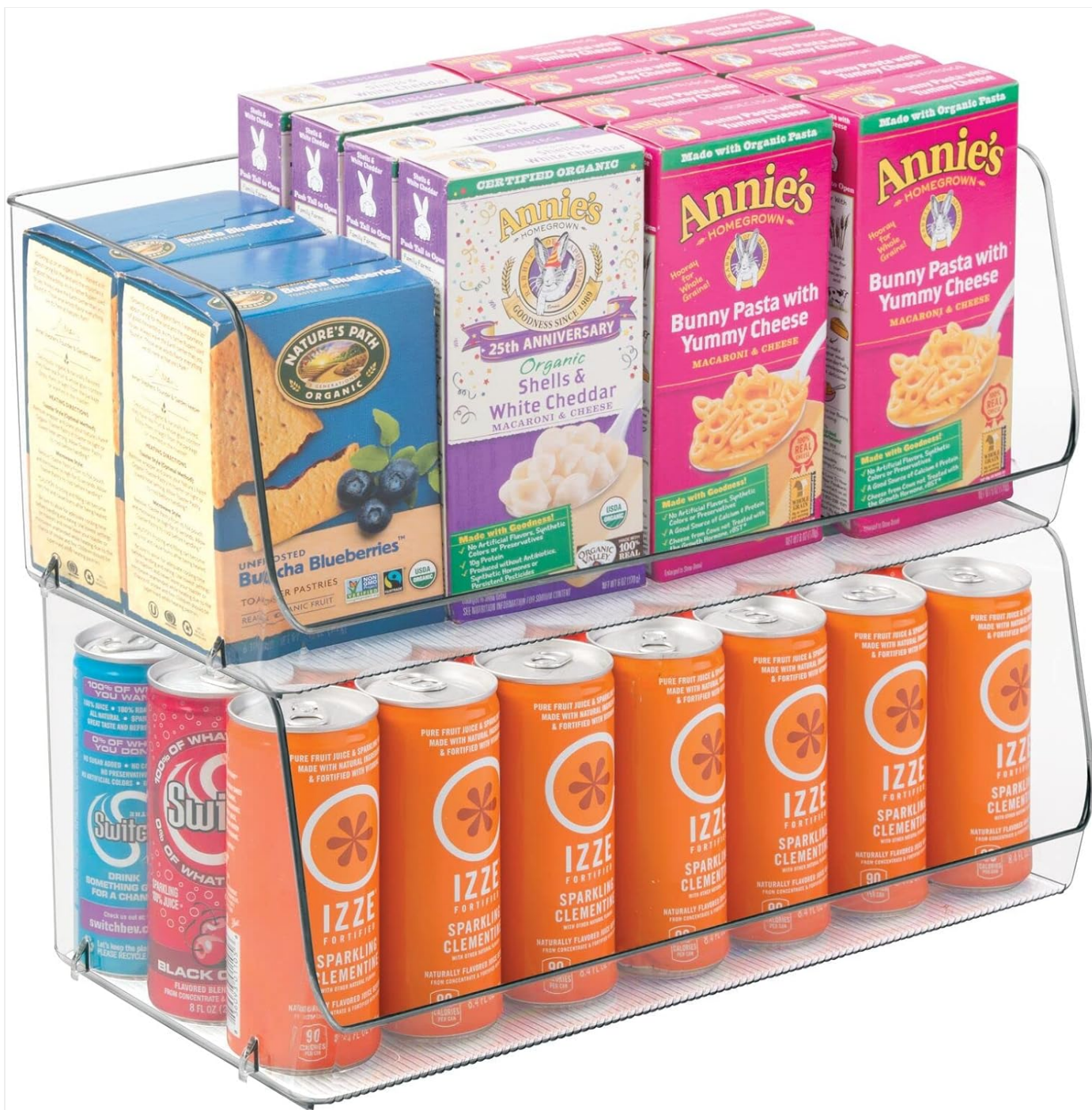
Image: Two clear stackable storage bins, one on top of the other, filled with boxed food items and canned beverages, demonstrating their use for pantry organization.