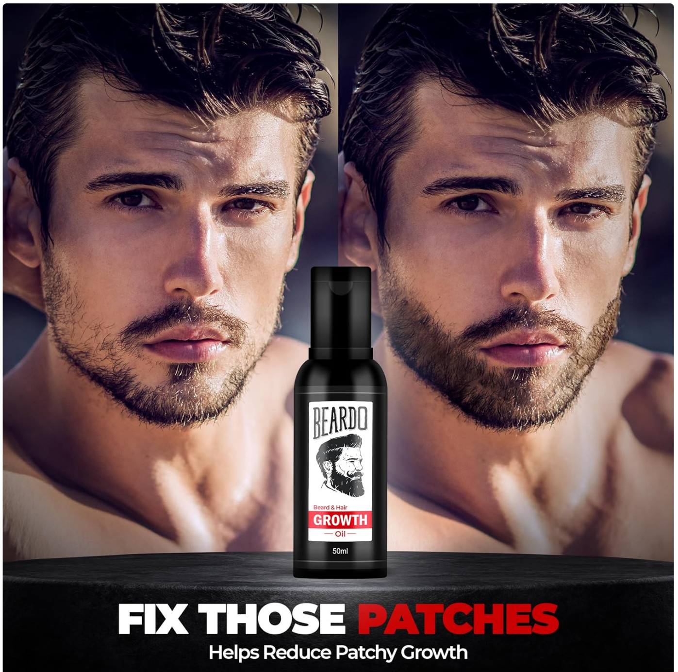
Image: A visual comparison demonstrating how the BEARDO Beard and Hair Growth Oil can help reduce patchy beard growth, showing a before and after effect.