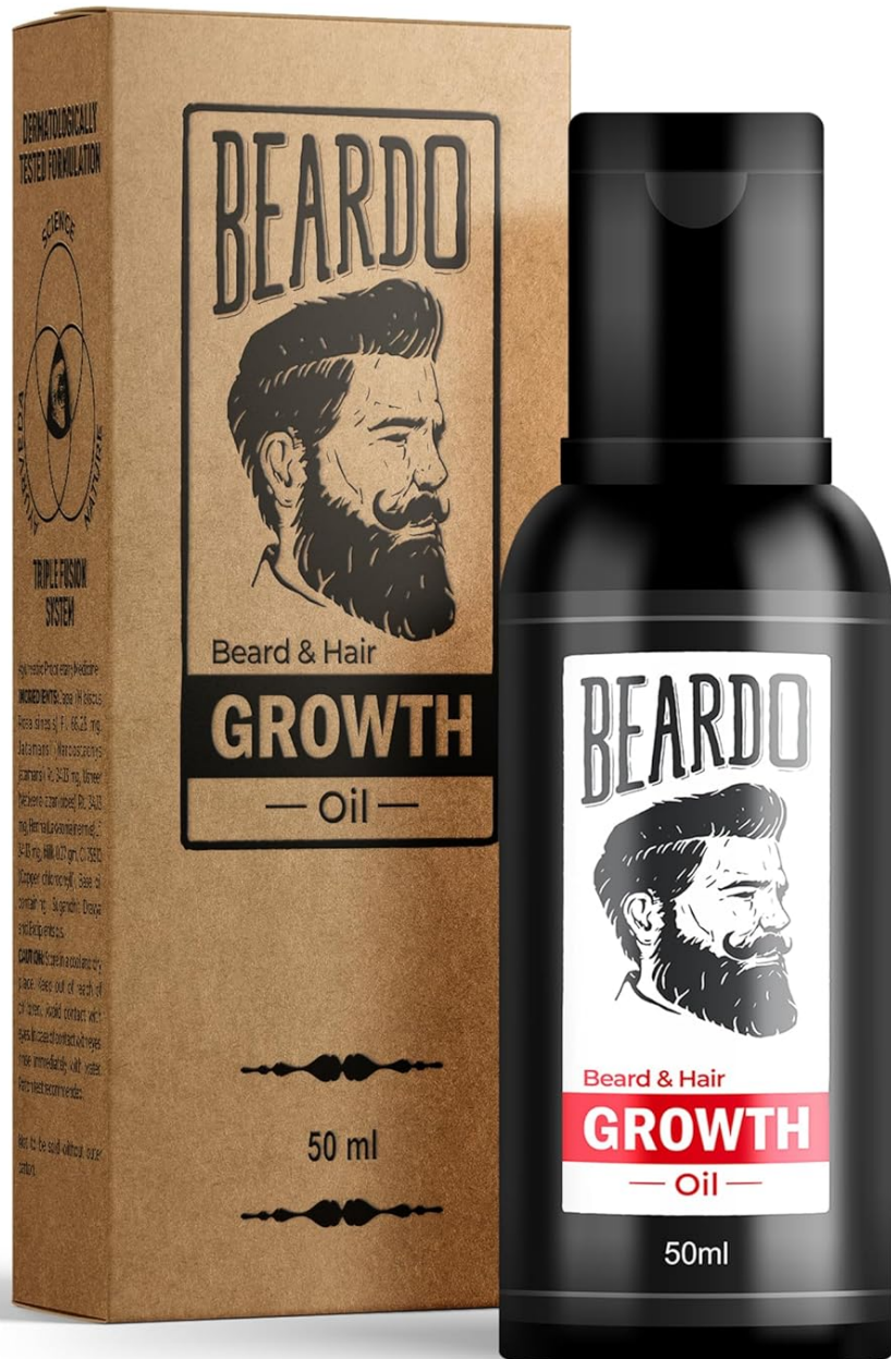
Image: The BEARDO Beard and Hair Growth Oil bottle alongside its product packaging, illustrating the product's design and branding.