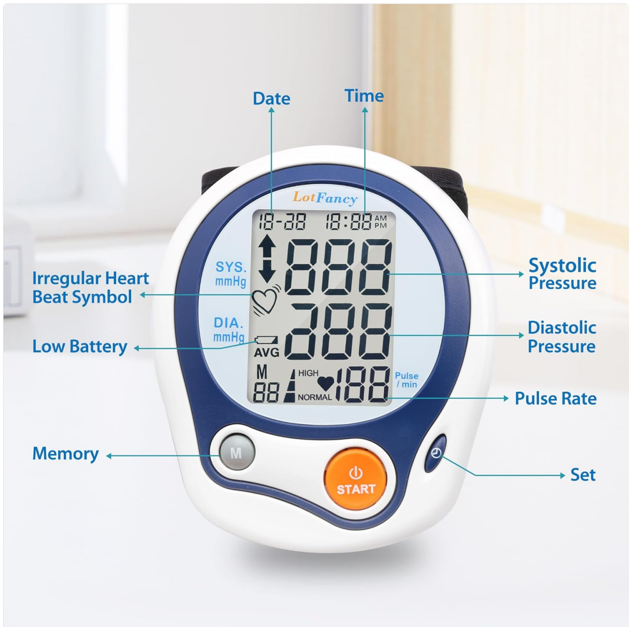
Figure 4: Monitor display and button functions.