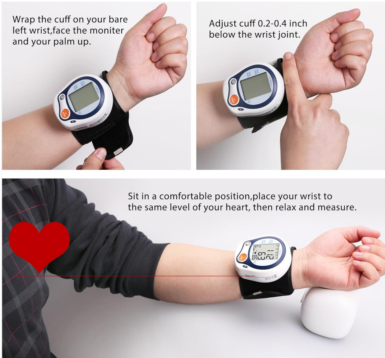
Figure 5: Proper cuff placement and measurement posture.