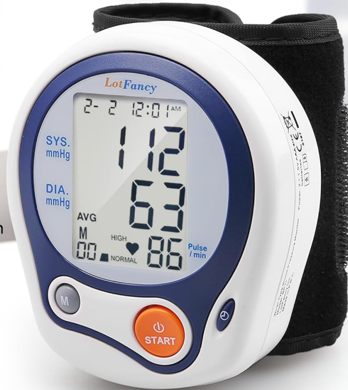
Figure 1: Key features of the LotFancy Wrist Blood Pressure Monitor.