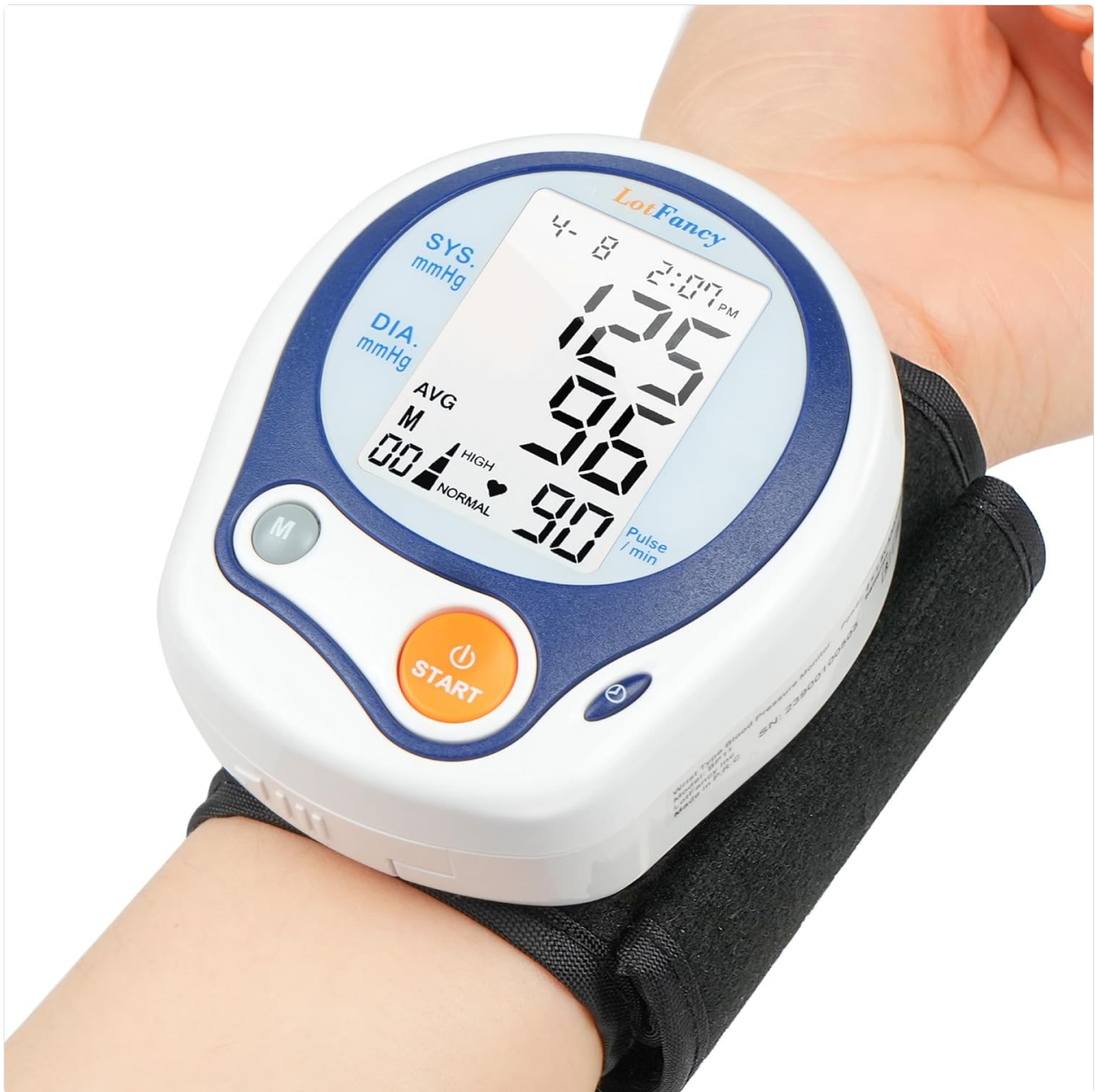
Figure 2: LotFancy Wrist Blood Pressure Monitor in use.