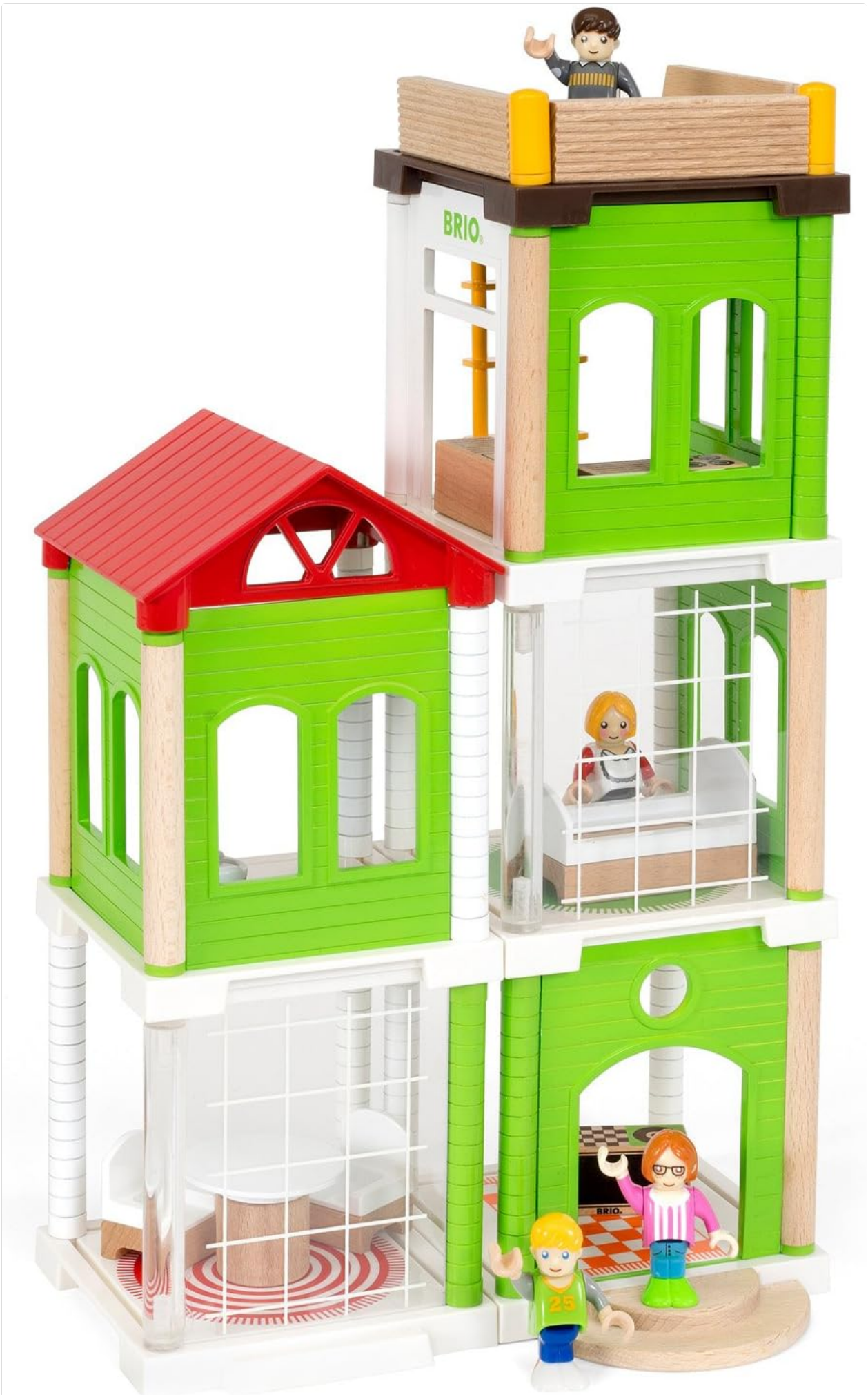
Image: An example of a multi-level house configuration, demonstrating the modularity of the set.