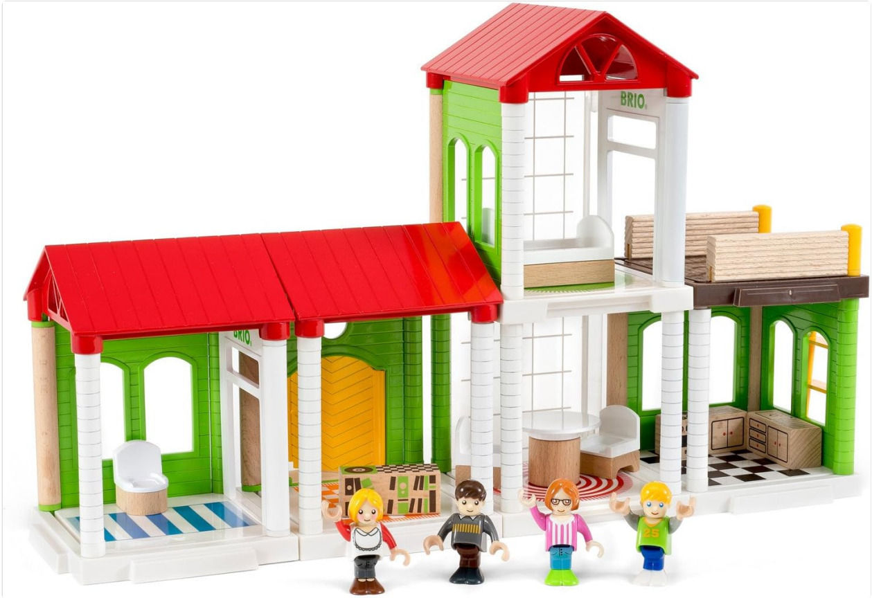
Image: The Family House set up for play, showing figures interacting with the environment.

The BRIO World Family House is designed for open-ended imaginative play. Children can create various scenarios and stories using the house and its accessories.