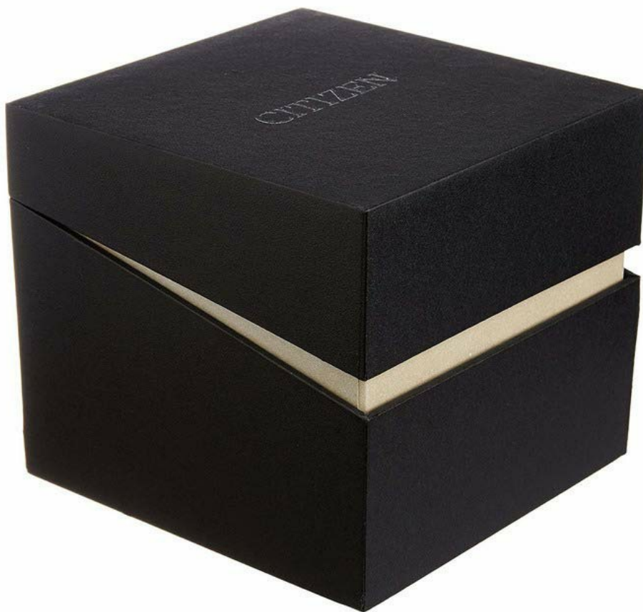
Figure 4: The packaging box for the Citizen Eco-Drive Perpetual Calendar Men's Watch BL5540-53A, a black box with the Citizen logo, indicating the product's presentation.