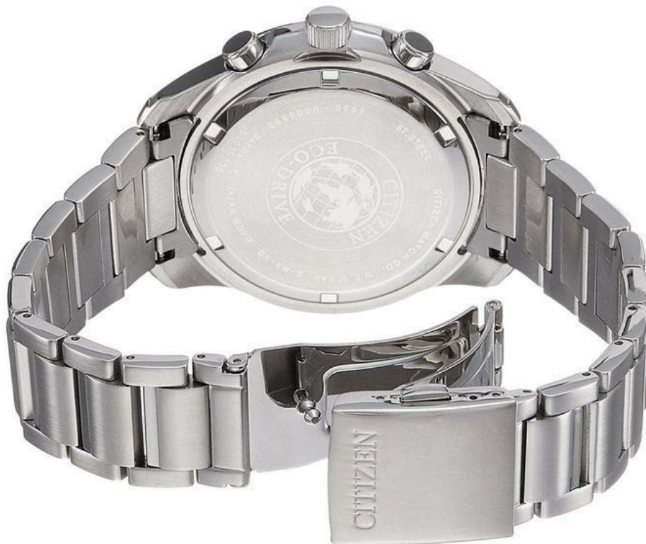
Figure 2: Rear view of the Citizen Eco-Drive Perpetual Calendar Men's Watch BL5540-53A, showing the stainless steel case back with engraved details and the clasp of the bracelet.

The watch includes an alarm function. Consult the comprehensive manual for detailed instructions on setting and activating the alarm, as this often involves specific modes and pusher combinations.