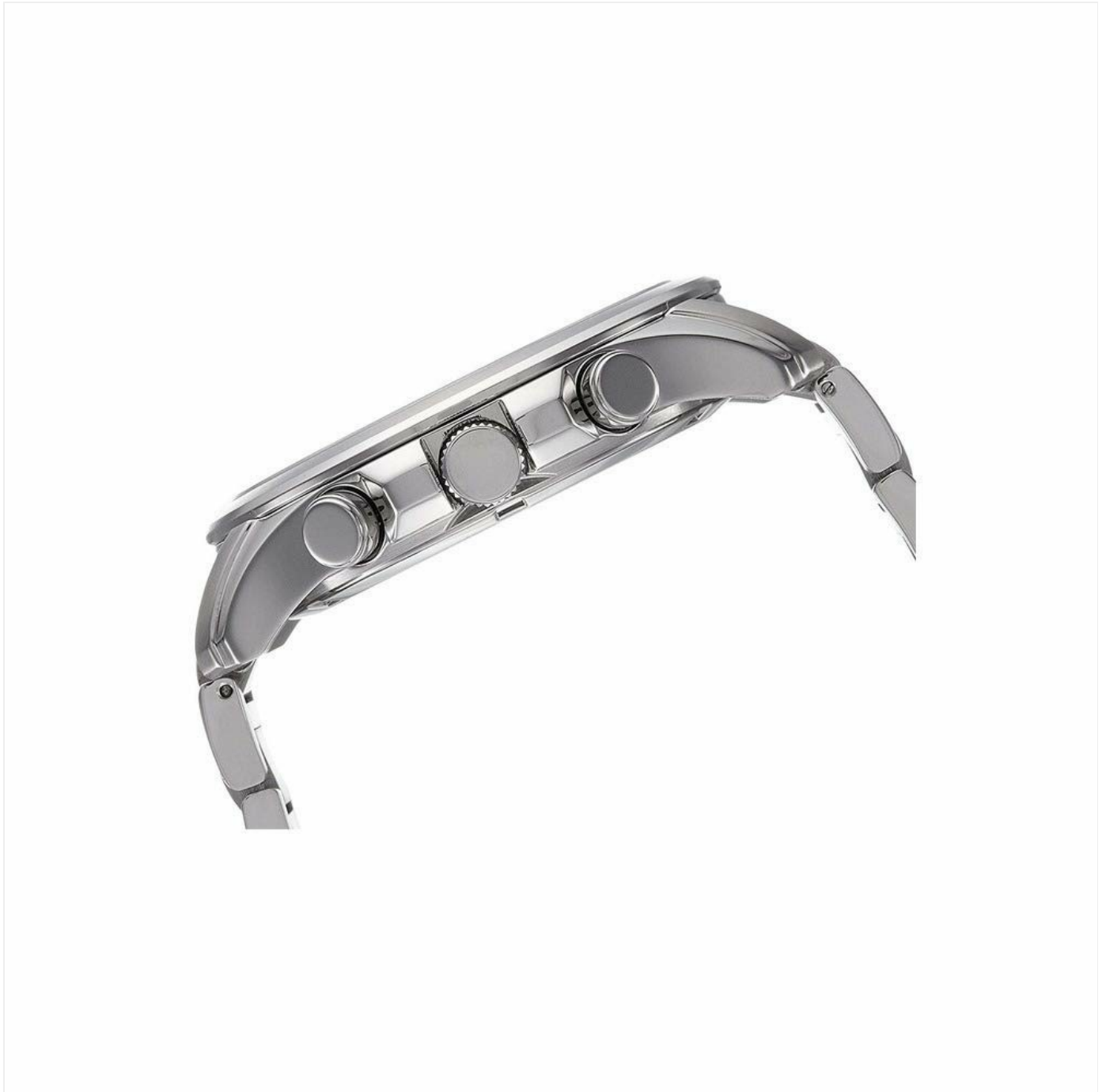
Figure 3: Side view of the Citizen Eco-Drive Perpetual Calendar Men's Watch BL5540-53A, highlighting the crown and pushers on the right side of the case, and the profile of the stainless steel bracelet.