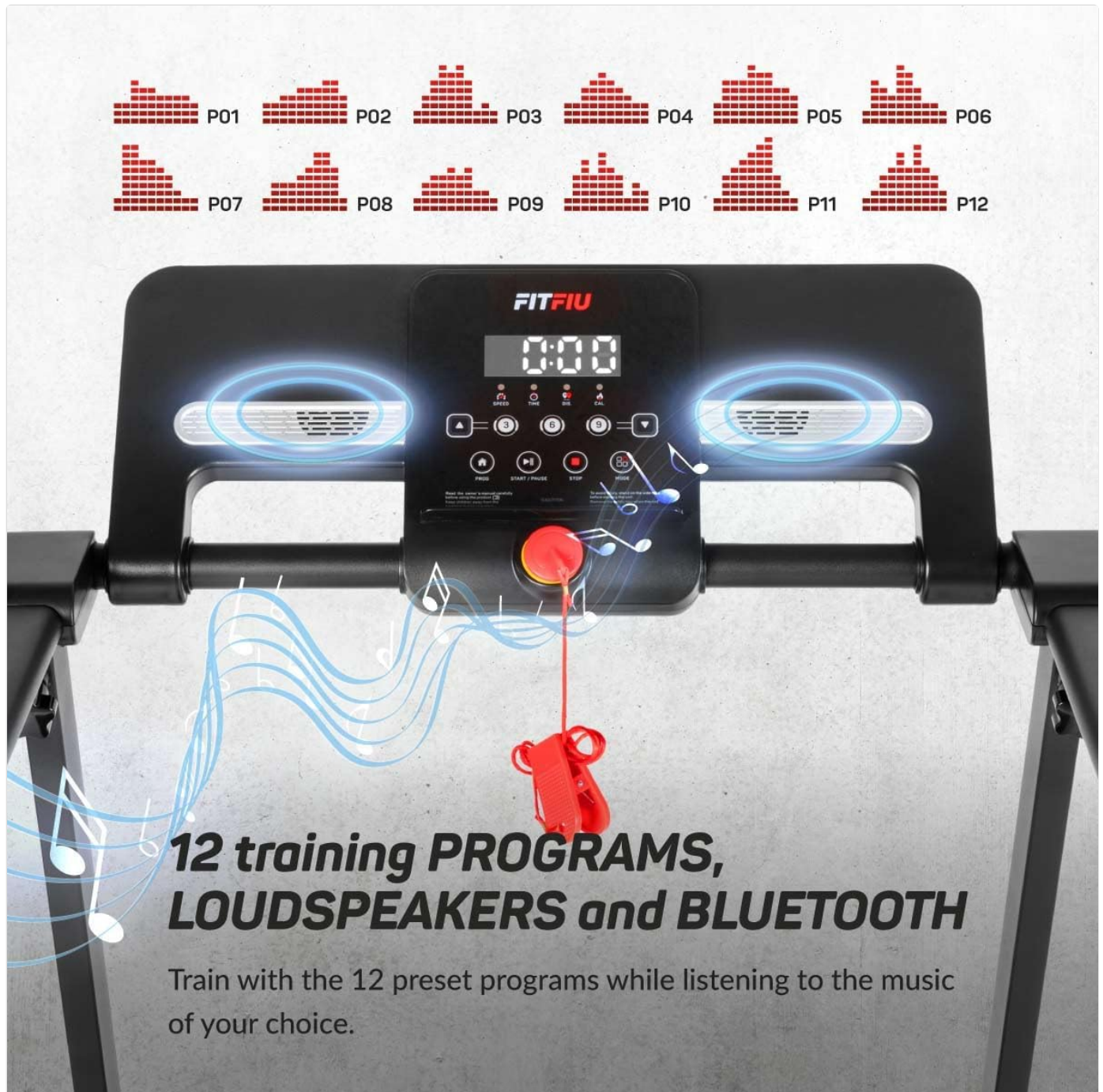
Figure 5.1: Treadmill console with display, control buttons, and safety key slot.

The MC-100 features an interactive display and intuitive controls for a seamless workout experience.