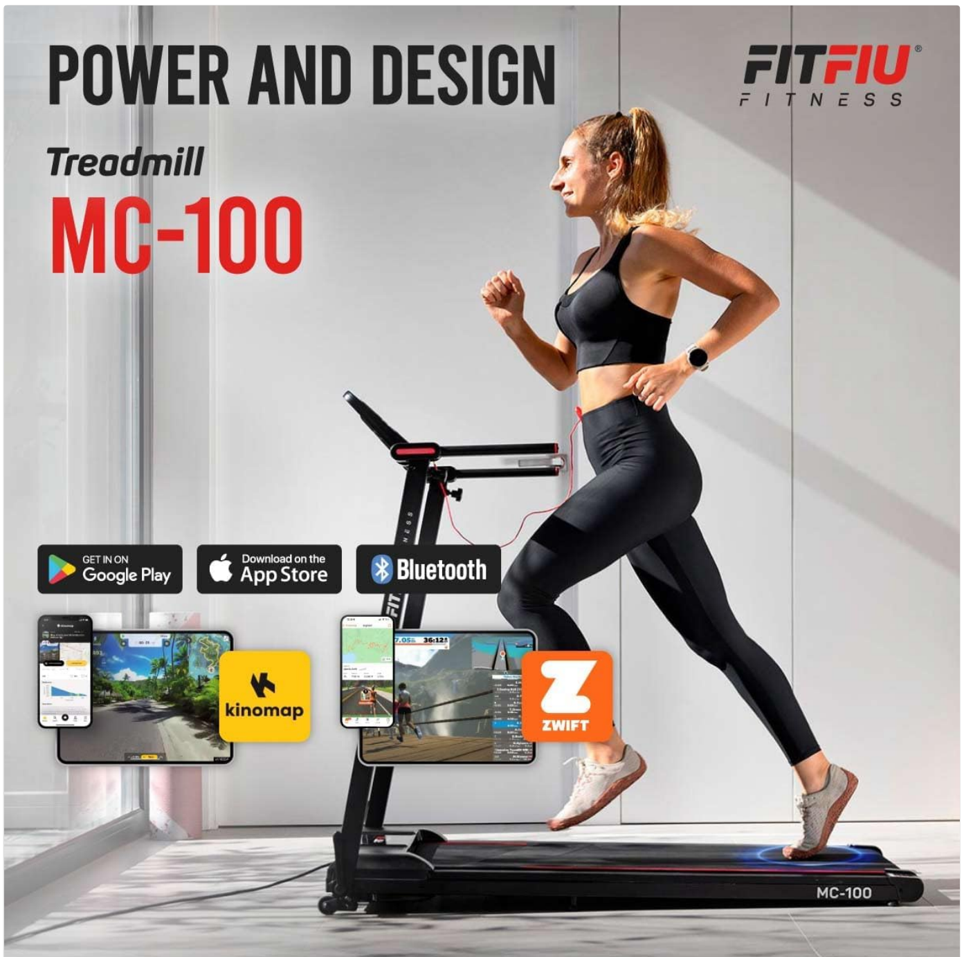
Figure 5.4: Treadmill console with tablet displaying KINOMAP and Zwift apps, highlighting Bluetooth connectivity.

Your browser does not support the video tag.