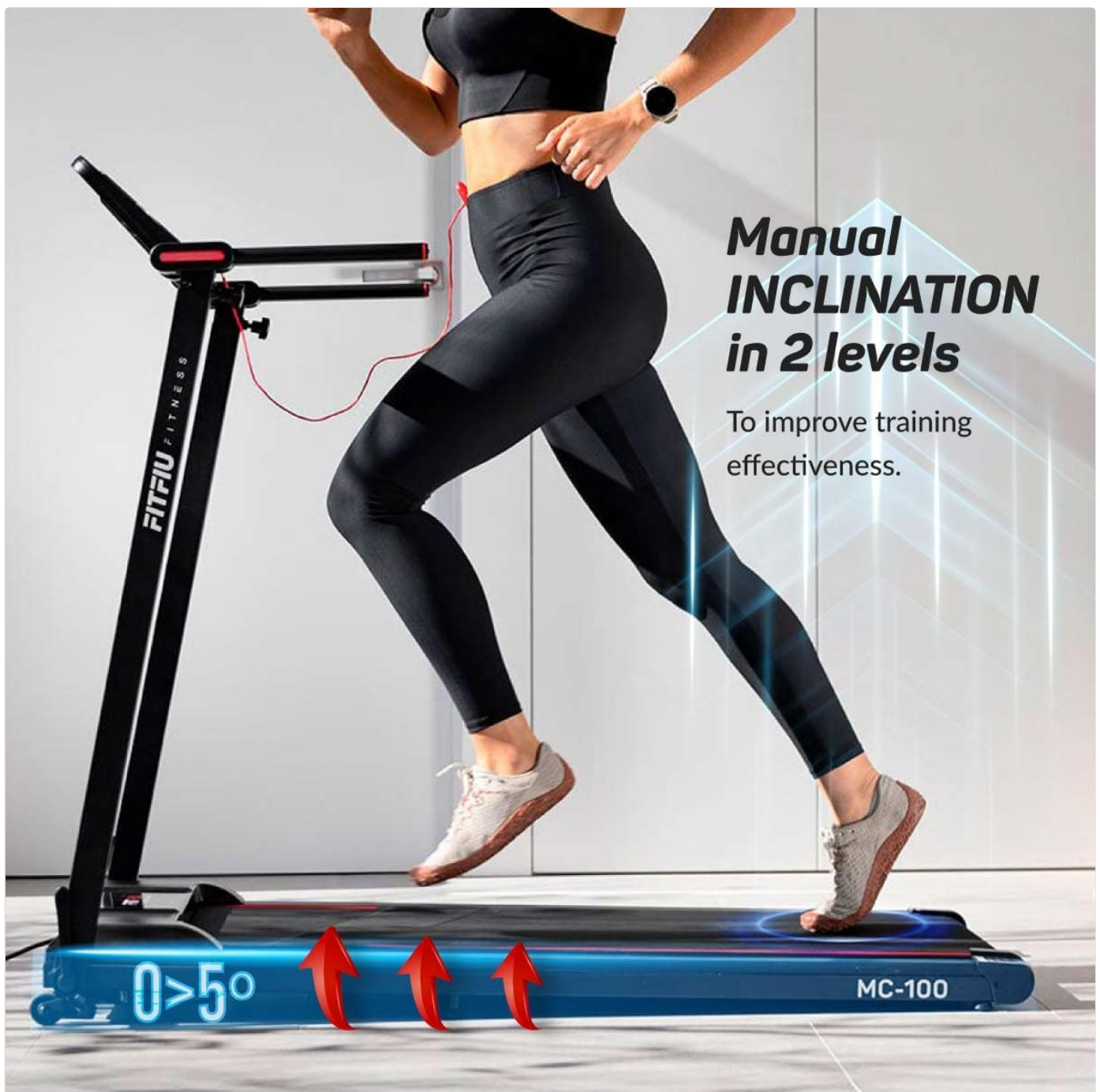
Figure 5.3: Manual incline adjustment points on the treadmill.