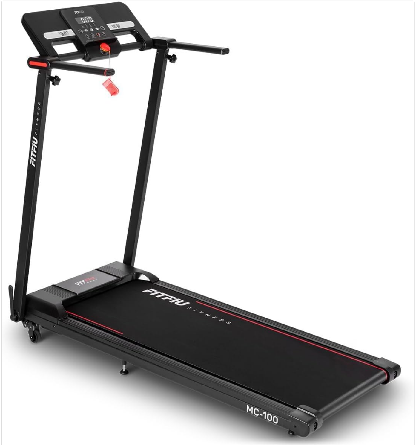
Figure 4.1: Fully assembled FITIU Fitness MC-100 Treadmill.