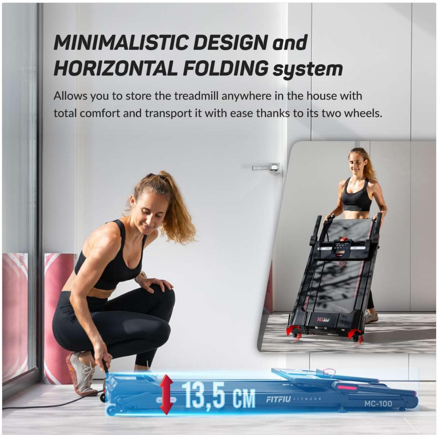
Figure 6.1: The treadmill features a horizontal folding system for easy storage.