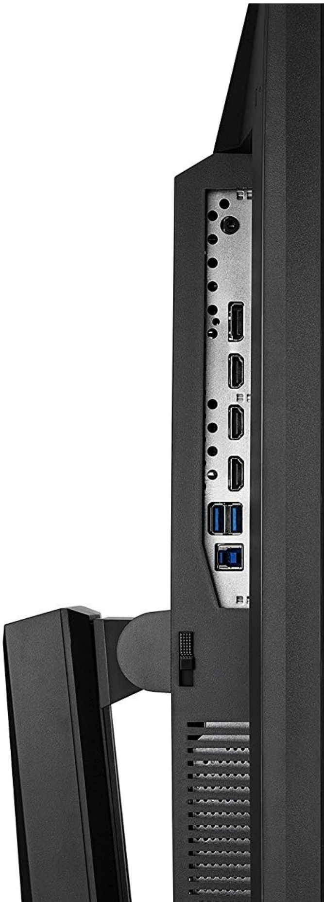
Image: Rear view of the ASUS MG28UQ monitor, highlighting the DisplayPort, HDMI, and USB 3.0 input ports.