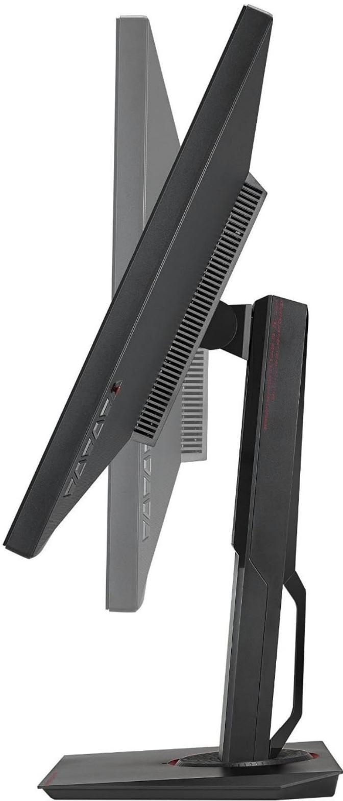
Image: Side view of the ASUS MG28UQ monitor, illustrating the location of the OSD control buttons.