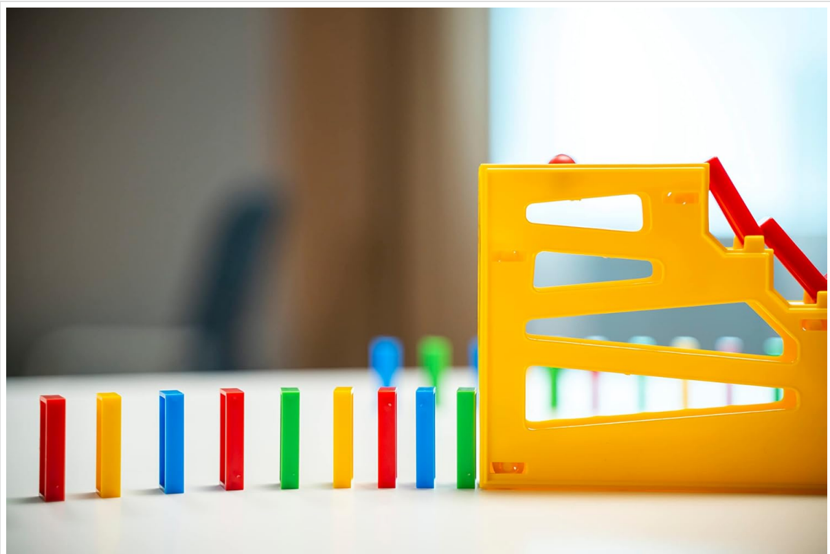
Image 4.2: A close-up view of dominoes perfectly aligned, ready to fall, with the yellow labyrinth ramp in the background.