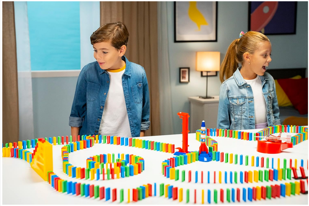
Image 4.1: Children observing a complex domino setup, demonstrating the creative possibilities of the game.