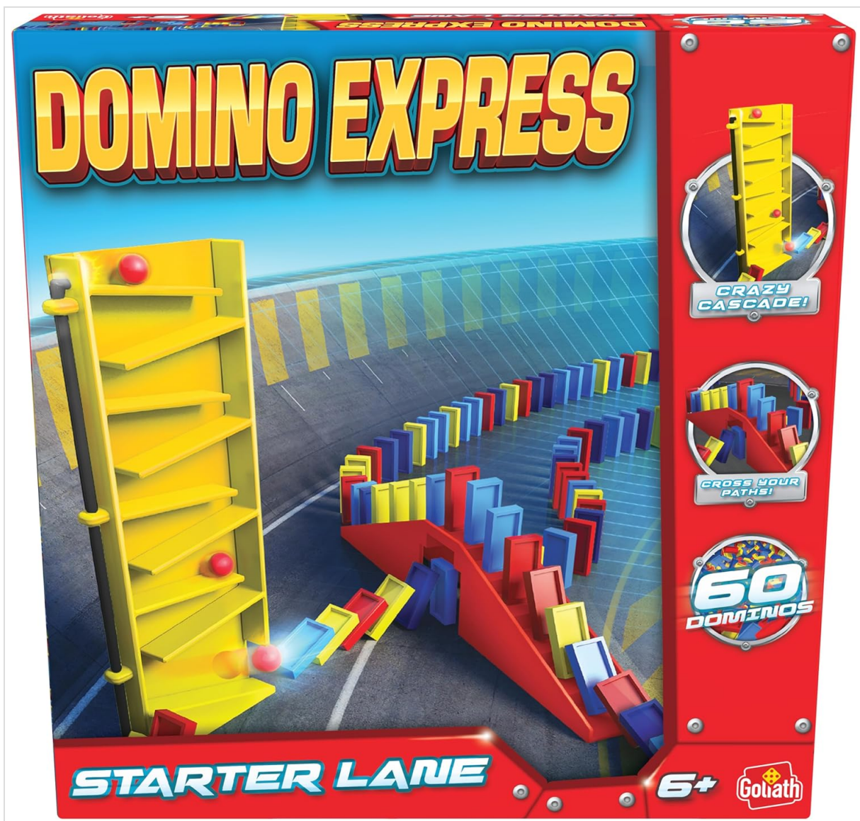
Image 1.1: The Domino Express Starter Lane product box, highlighting the main components and the "60 Dominos" feature.

The complete starter set includes dominoes, ramps, supports, and other essential accessories for constructing basic cascades. Players can design their own cascades, fostering imaginative play.