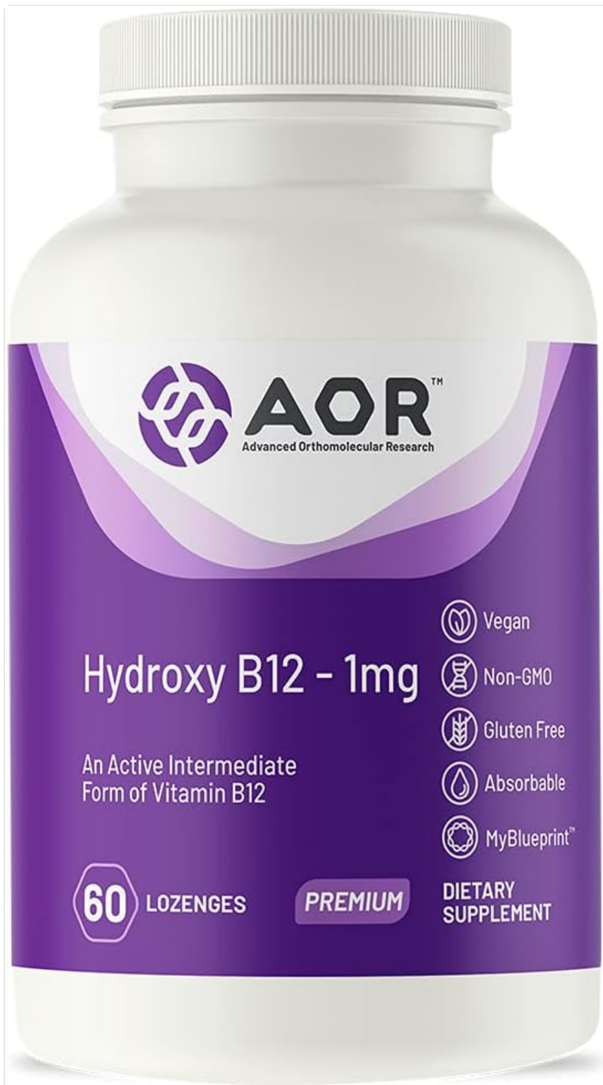
Image: Front view of the AOR Hydroxy B12 1mg Lozenges bottle, highlighting its vegan, non-GMO, gluten-free, and absorbable qualities.