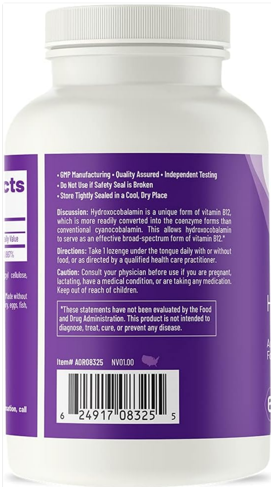
Image: Side view of the AOR Hydroxy B12 1mg Lozenges bottle, displaying a discussion about hydroxocobalamin and directions for use.