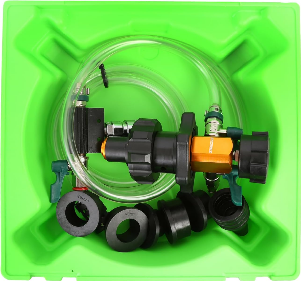
Figure 2: The kit components neatly organized within the sturdy green carrying case for convenient storage and transport.