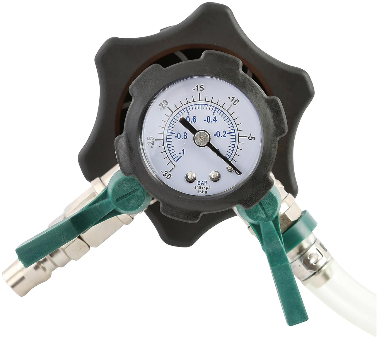
Figure 7: Proper attachment of the refiller kit to the vehicle's cooling system reservoir.