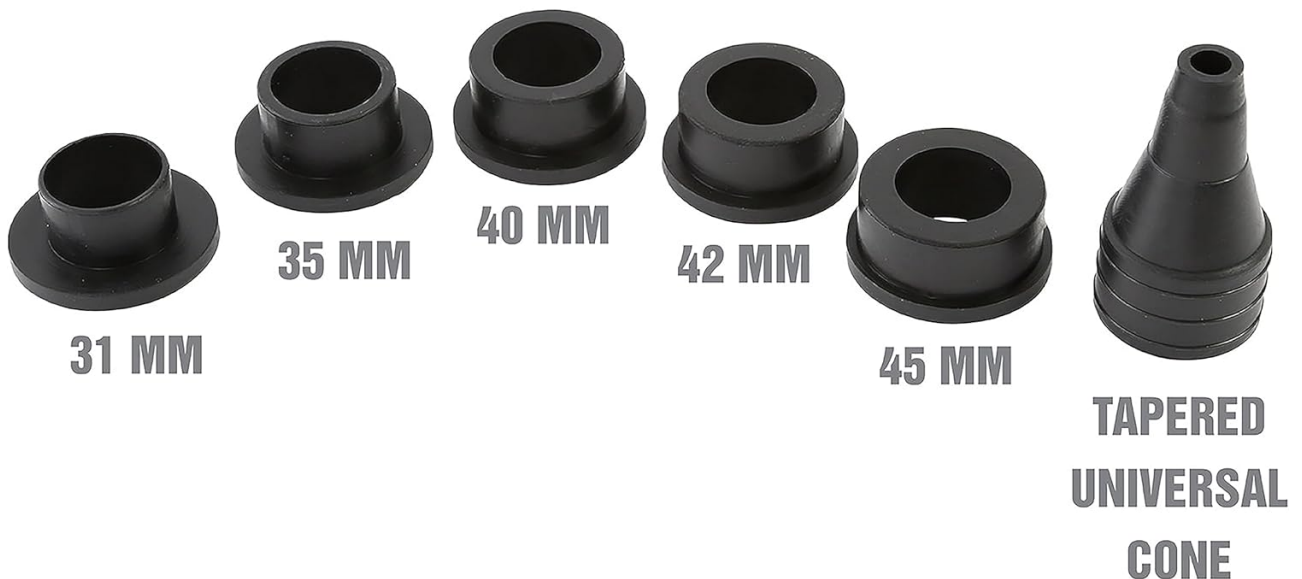
Figure 5: Selection of radiator/coolant tank adapters, including various sized bushings and a universal tapered cone.