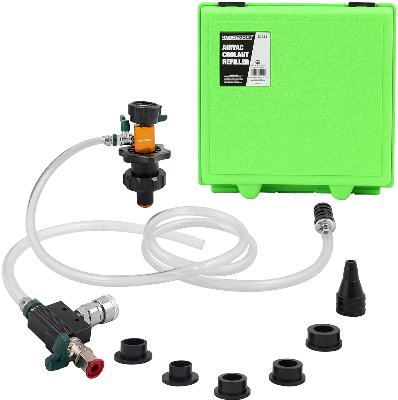
Figure 1: Complete OEMTOOLS 24444 AirVac Cooling System Refiller Kit, showing the main assembly, various adapters, hoses, and the storage case.