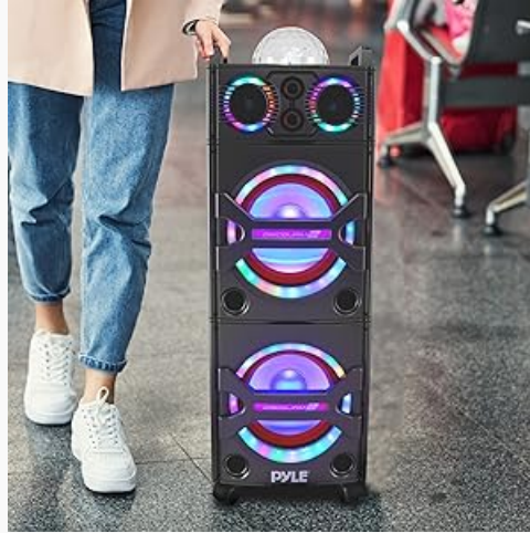
Figure 5: Speaker with retractable handle and wheels

Attach the detachable rolling wheels to the bottom of the speaker for enhanced portability. Ensure they are securely fastened.