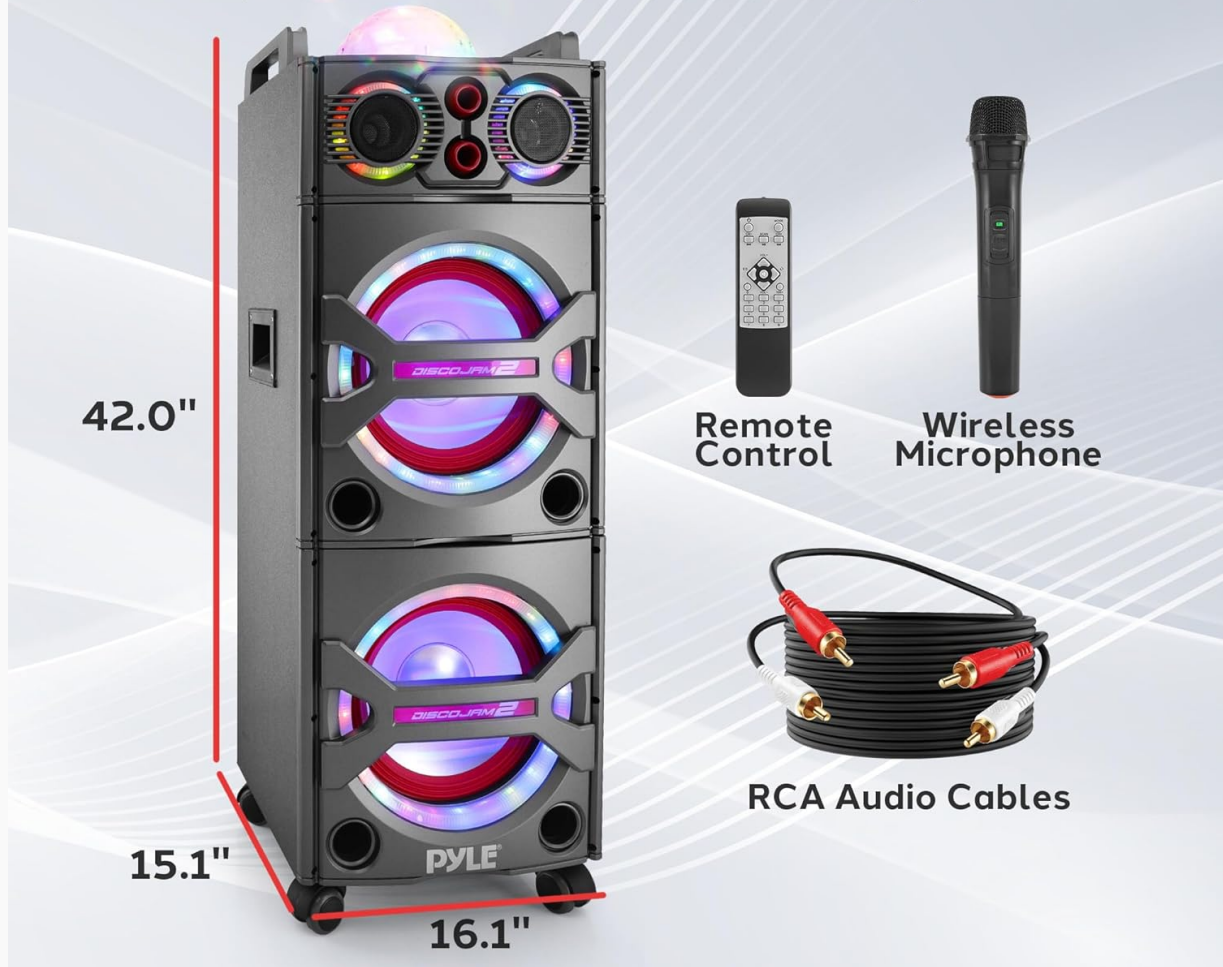
Figure 2: Included accessories and main unit