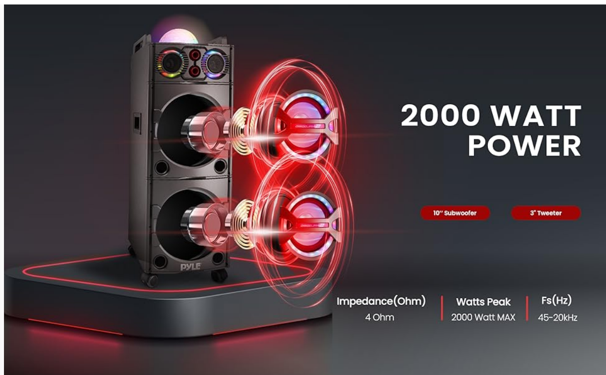
Figure 3: Power output details