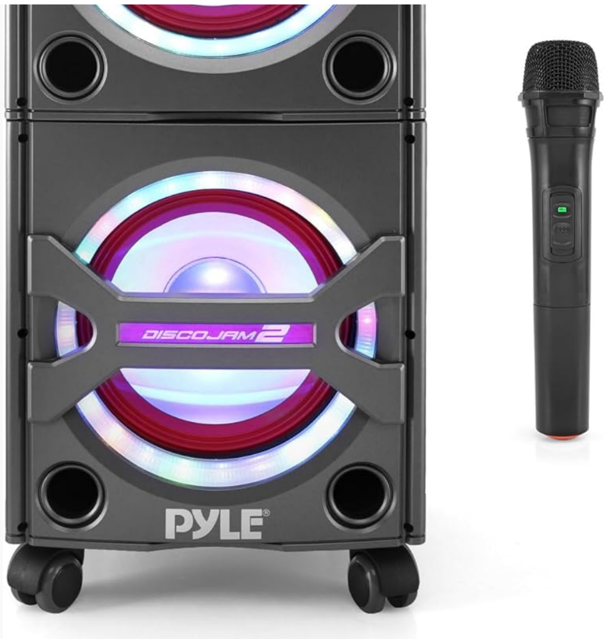
Figure 1: Pyle Portable Bluetooth PA Speaker System PSUFM1043BT