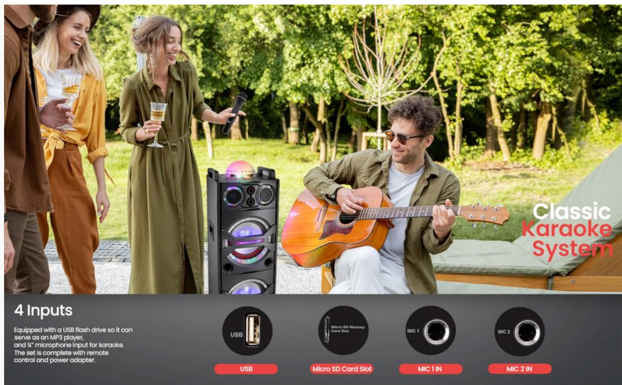
Figure 9: Various input options