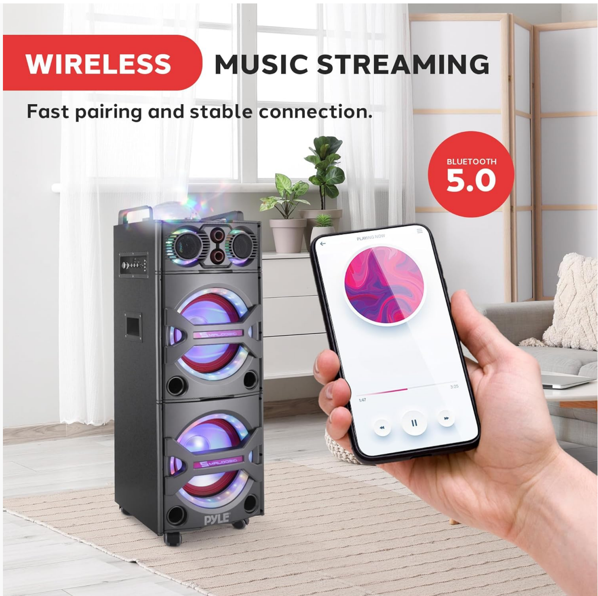
Figure 8: Bluetooth music streaming