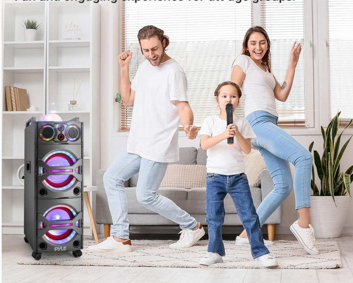
Figure 10: Karaoke setup

Fun and engaging experience for all age groups.