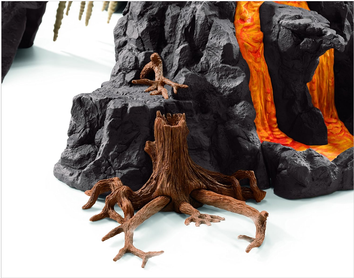
The complete Schleich Giant Volcano with T-Rex Playset, showcasing its various features.