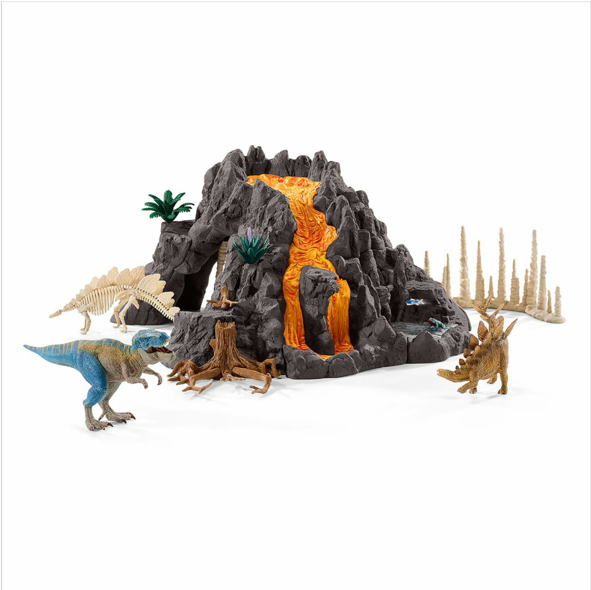
Detail of the playset showing the intricate root structure and cave entrance, highlighting interactive elements.