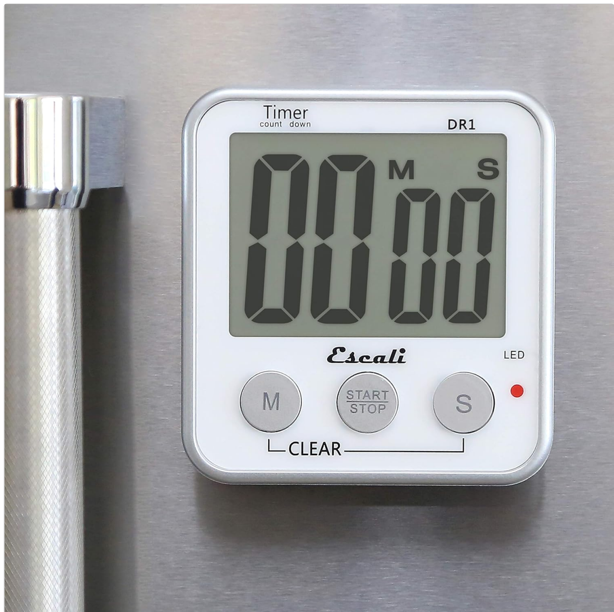
Figure 4: The Escali DR1 Digital Kitchen Timer shown magnetically attached to a refrigerator door.