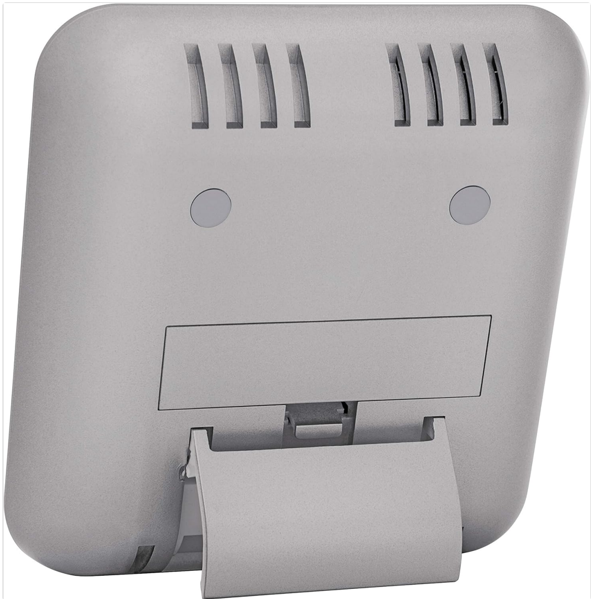
Figure 3: Rear view of the Escali DR1 Digital Kitchen Timer, illustrating the battery compartment and the integrated kickstand.