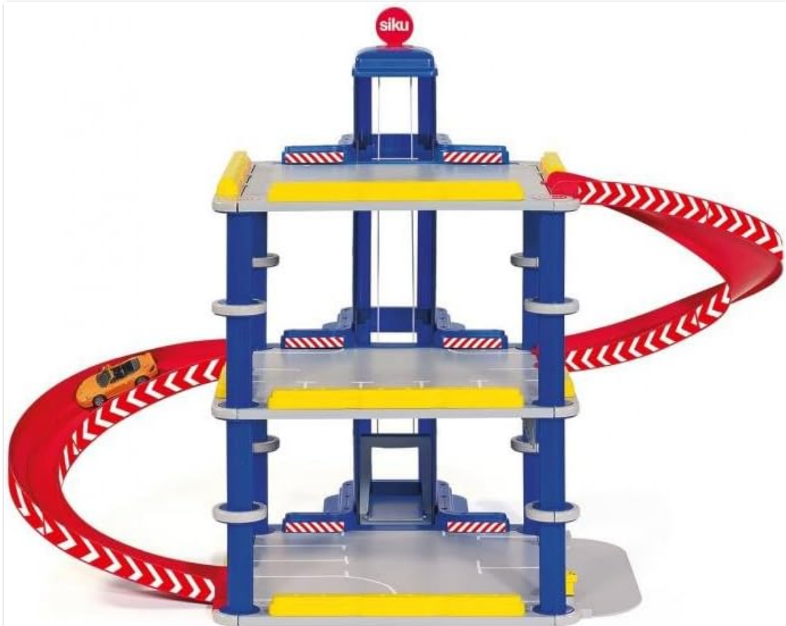
Figure 1: Fully assembled Siku Car Park Multi-Storey Playset, ready for use.