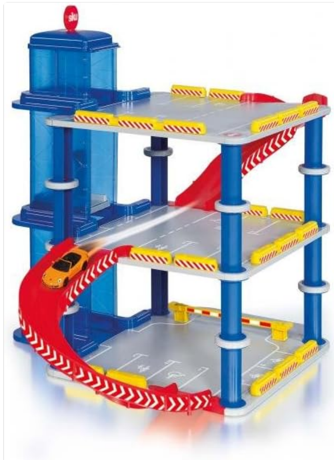
Figure 3: Overview of the car park in operation, highlighting the ramp and lift tower.