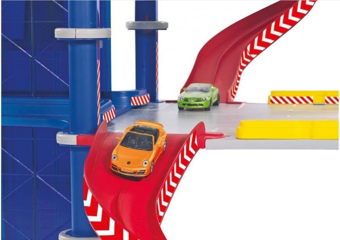
Figure 2: A toy car navigating the red descent ramp.