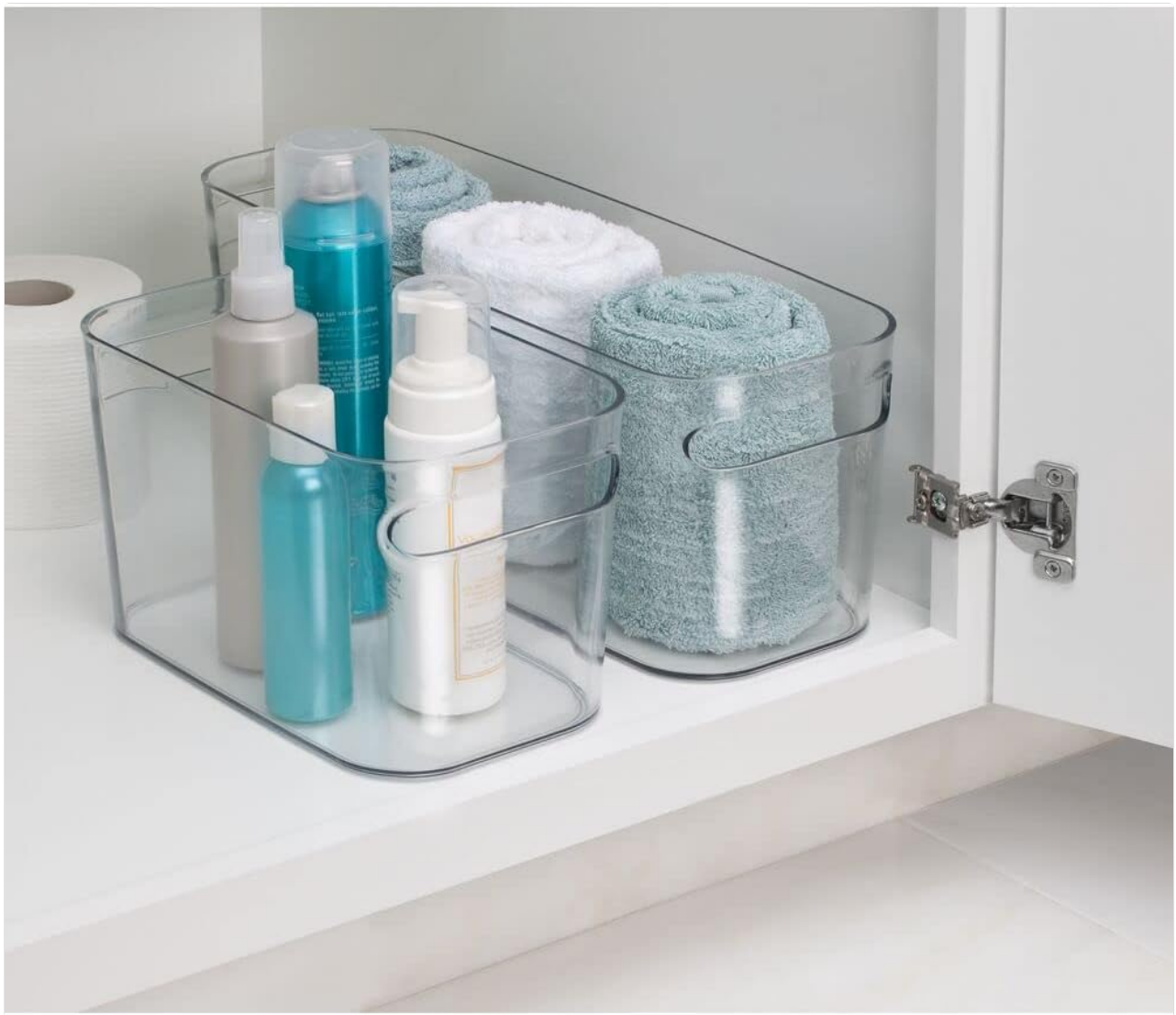
Image: Two mDesign storage bins neatly placed inside a white bathroom cabinet, demonstrating their fit and capacity for organizing towels and various bottles.