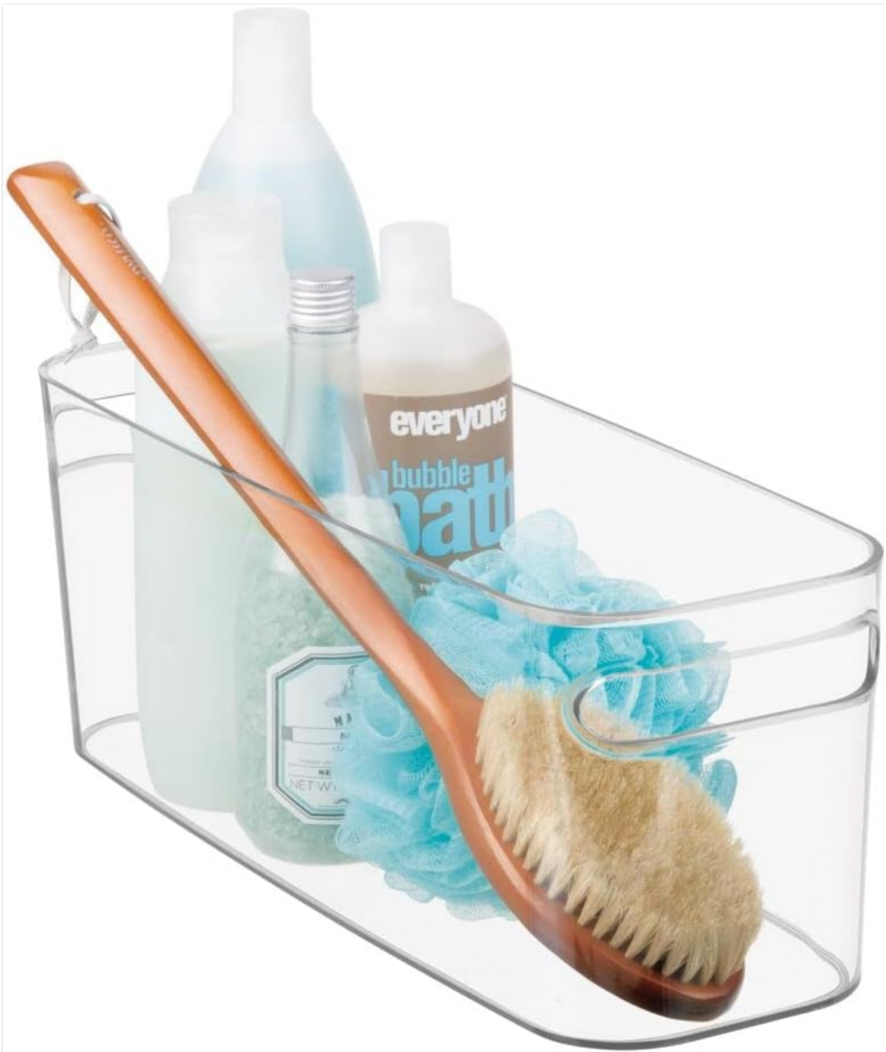
Image: The mDesign Large Plastic Storage Bin, shown here filled with various bath products and a body brush, demonstrating its capacity and clear design.