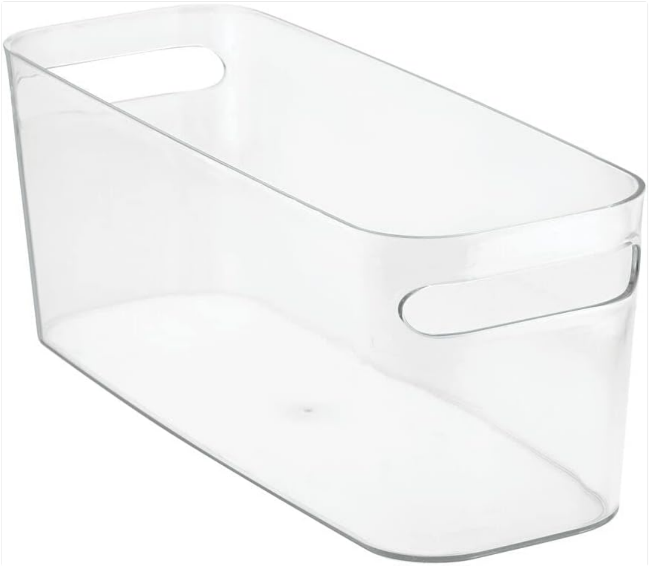
Image: An empty mDesign Large Plastic Storage Bin, highlighting its clear construction and integrated handles, ready for use.