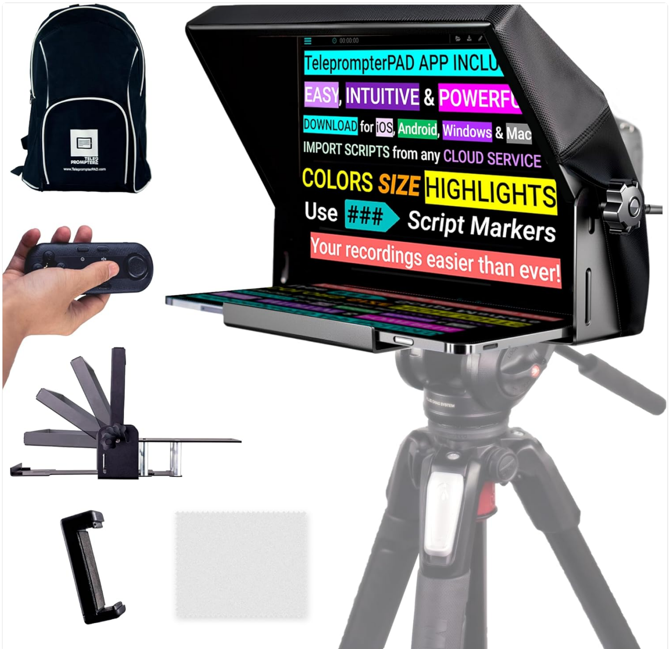
Image: All components included with the iLight PRO 12" Teleprompter.