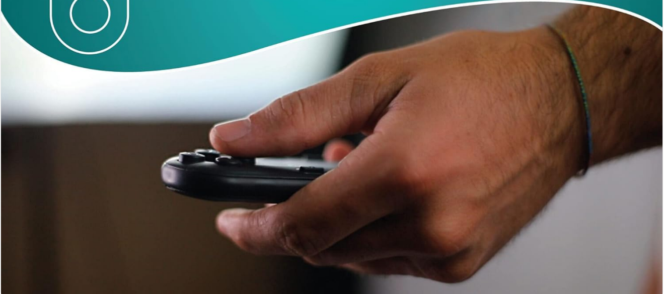
Image: Remote control button functions.

Your browser does not support the video tag.