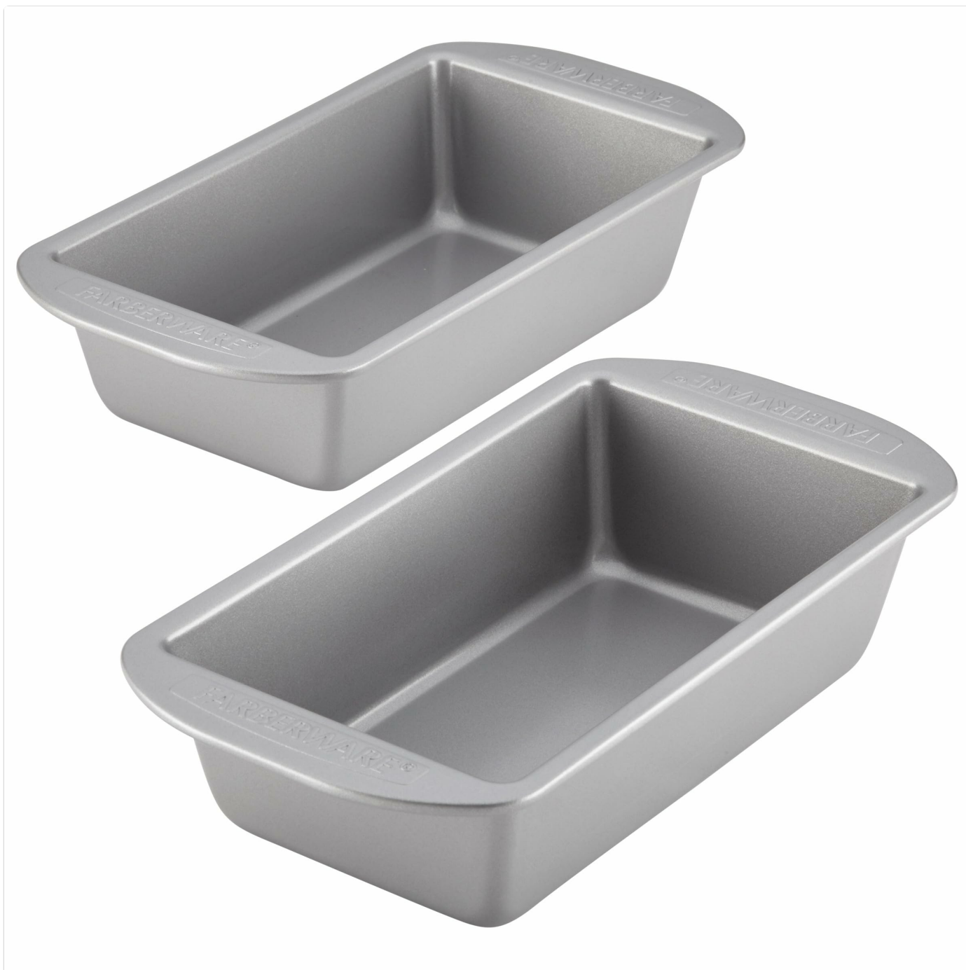
Image: Clean Farberware Nonstick Loaf Pan.

Before first use, wash the loaf pans thoroughly with warm, soapy water. Rinse and dry completely. It is recommended to lightly grease or flour the interior of the pan before adding ingredients, even with the nonstick coating, to ensure optimal food release and extend the life of the nonstick surface.