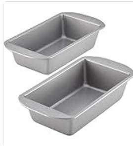
Image: Farberware 9x5 Inch Nonstick Loaf Pans.

The Farberware Bakeware 9x5 Inch Nonstick Loaf Pan Set is designed for baking a variety of items, including breads, cakes, and meatloaf. This set includes two rectangular loaf pans, each measuring 9 inches by 5 inches. Constructed from heavy-duty steel, these pans feature a nonstick coating for easy food release and cleanup.