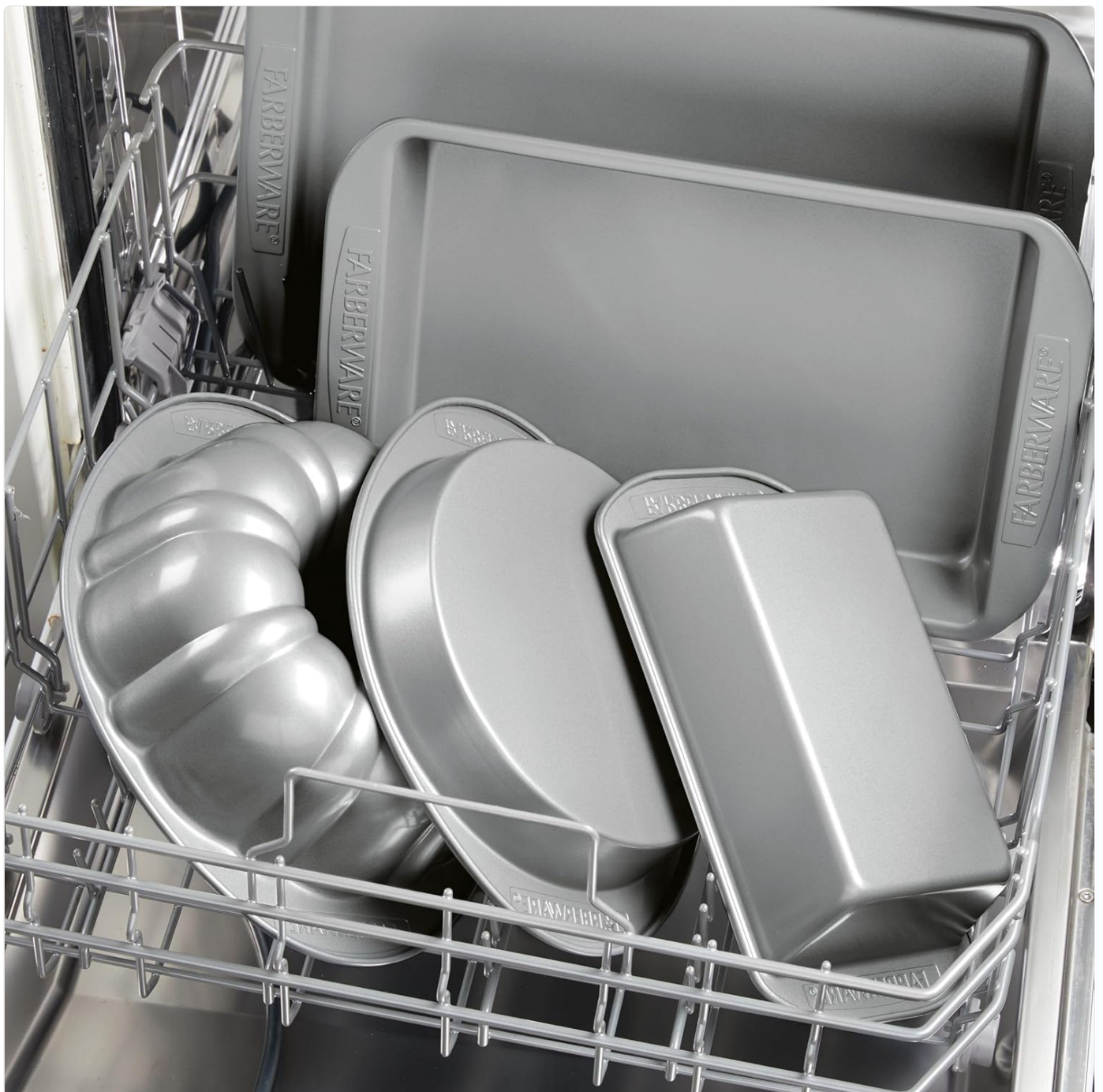
Image: Farberware Bakeware in a dishwasher. Hand washing is recommended for optimal care.