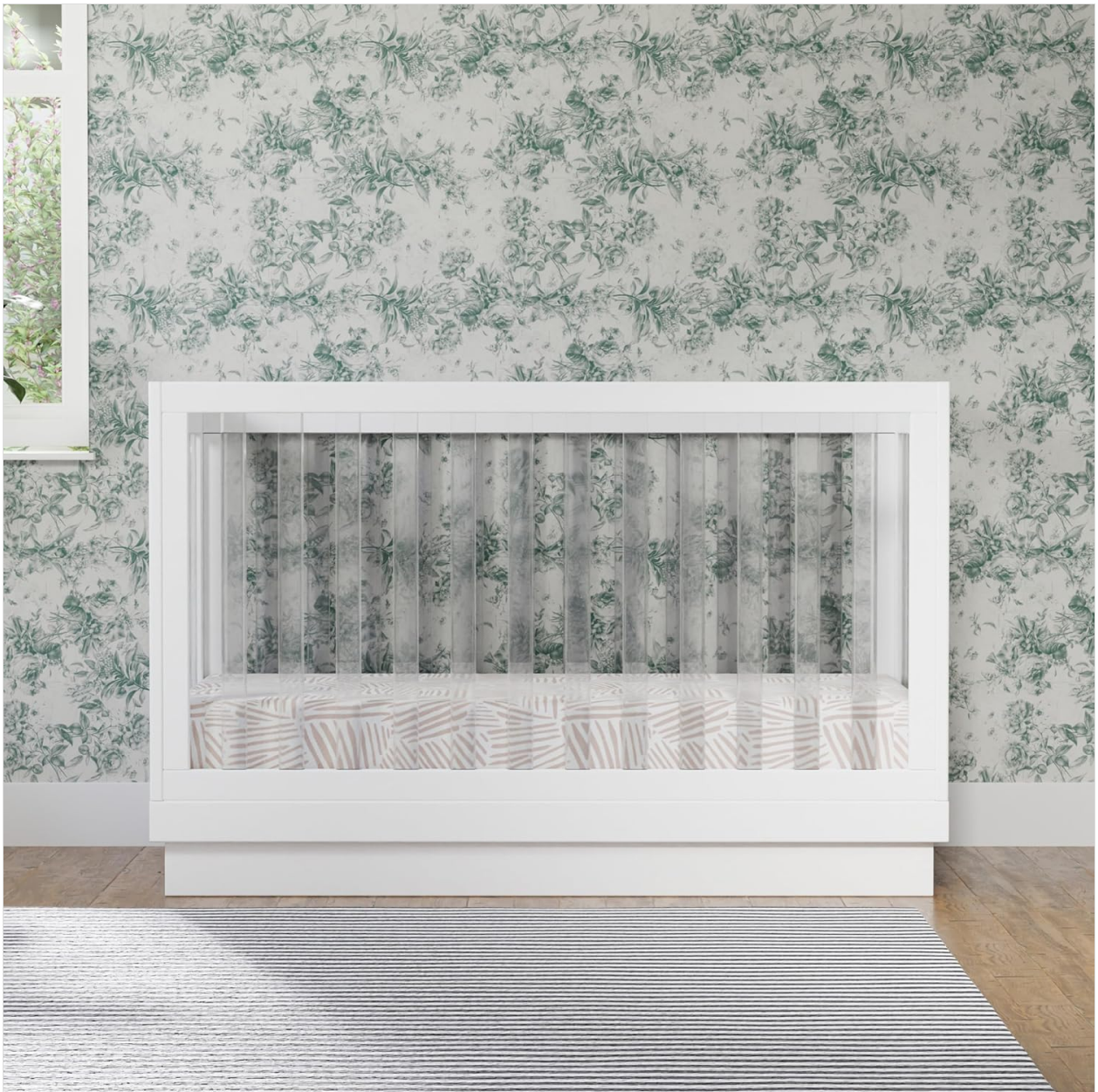
Image: Front view of the assembled Babyletto Harlow Crib, showcasing the clear acrylic slats and white frame.