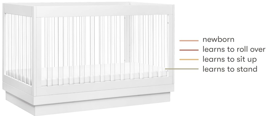
Image: Illustration of the four adjustable mattress height settings, indicating suitable stages for newborn, rolling over, sitting up, and standing.