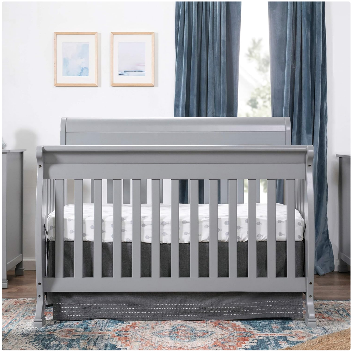
Image: Front view of the assembled DaVinci Kalani Crib, showcasing its design.