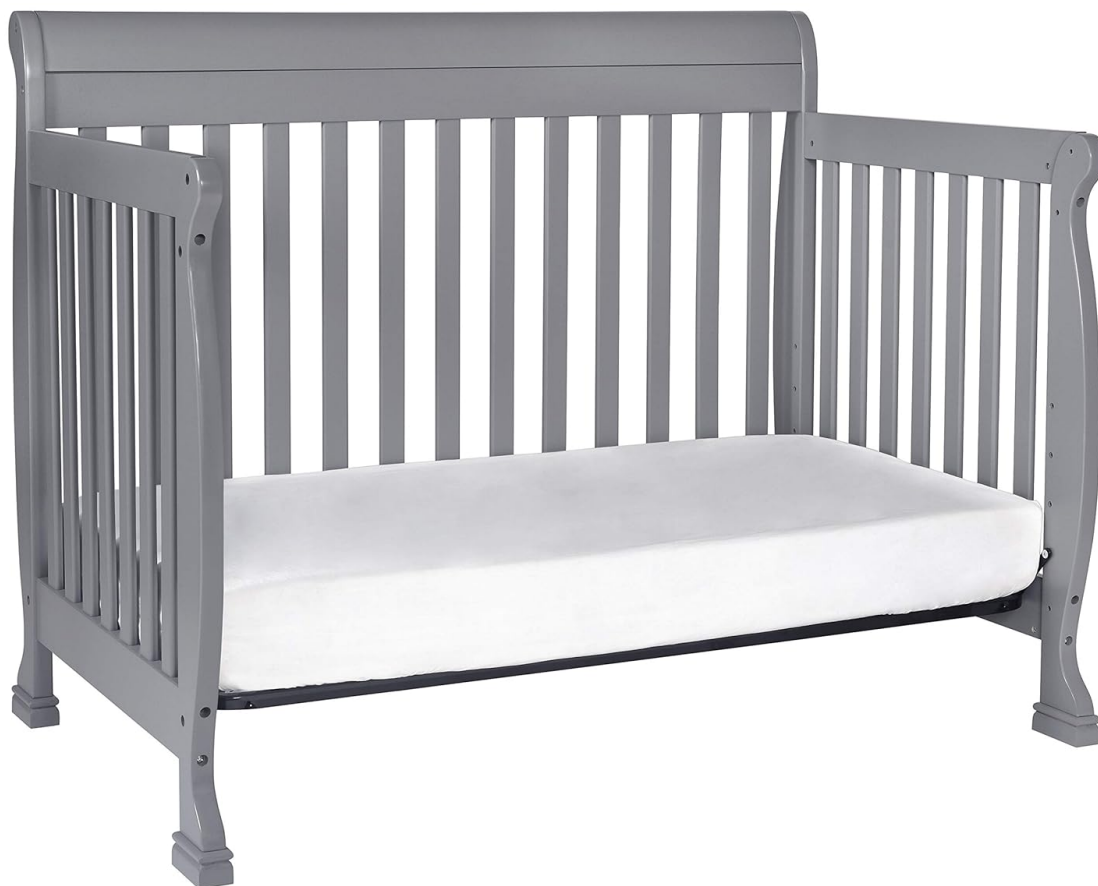
Image: The DaVinci Kalani Crib configured as a toddler bed, featuring a low safety rail.