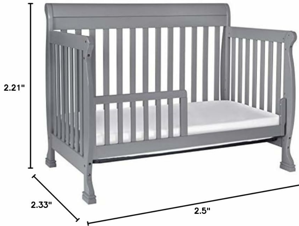
Image: A diagram illustrating the key dimensions of the DaVinci Kalani Crib.