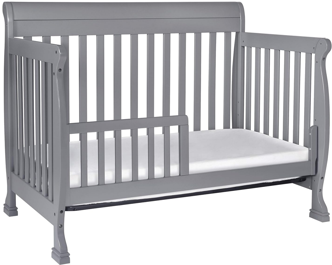
Image: Visual representation of the crib's four conversion stages: full-size crib, toddler bed, daybed, and full-size bed.