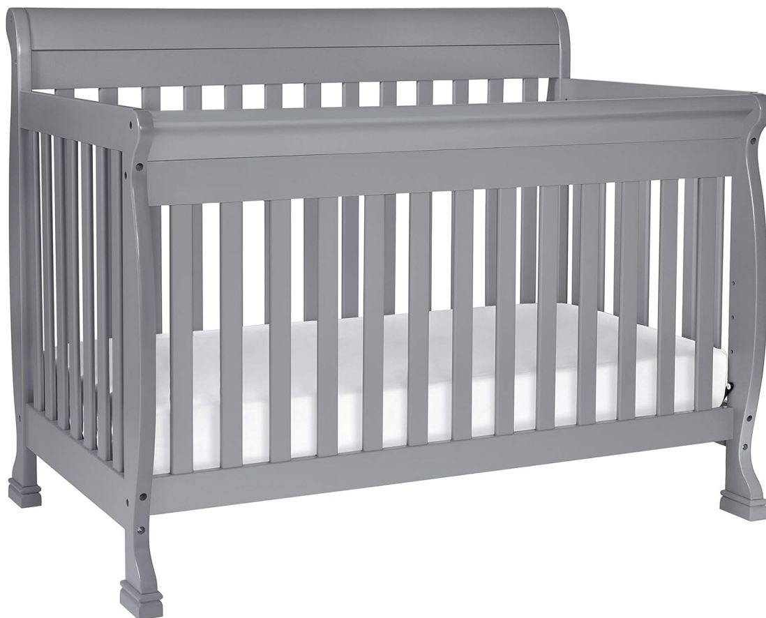
Image: The DaVinci Kalani 4-in-1 Convertible Crib in Grey, shown in its crib configuration.