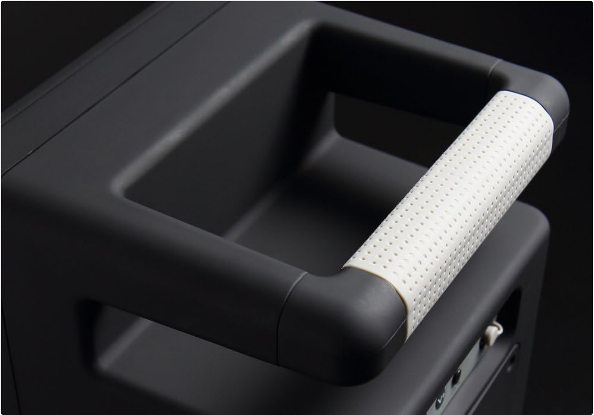
Figure 3.3: The water-resistant surface of the speaker, showing its ability to repel water.