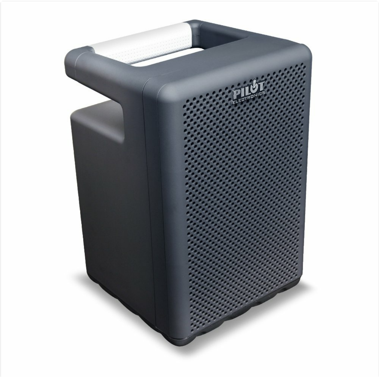
Figure 3.1: Front view of the Pilot Automotive CA-5330EL Rugged 30W Bluetooth Speaker, showcasing its robust design and integrated handle.