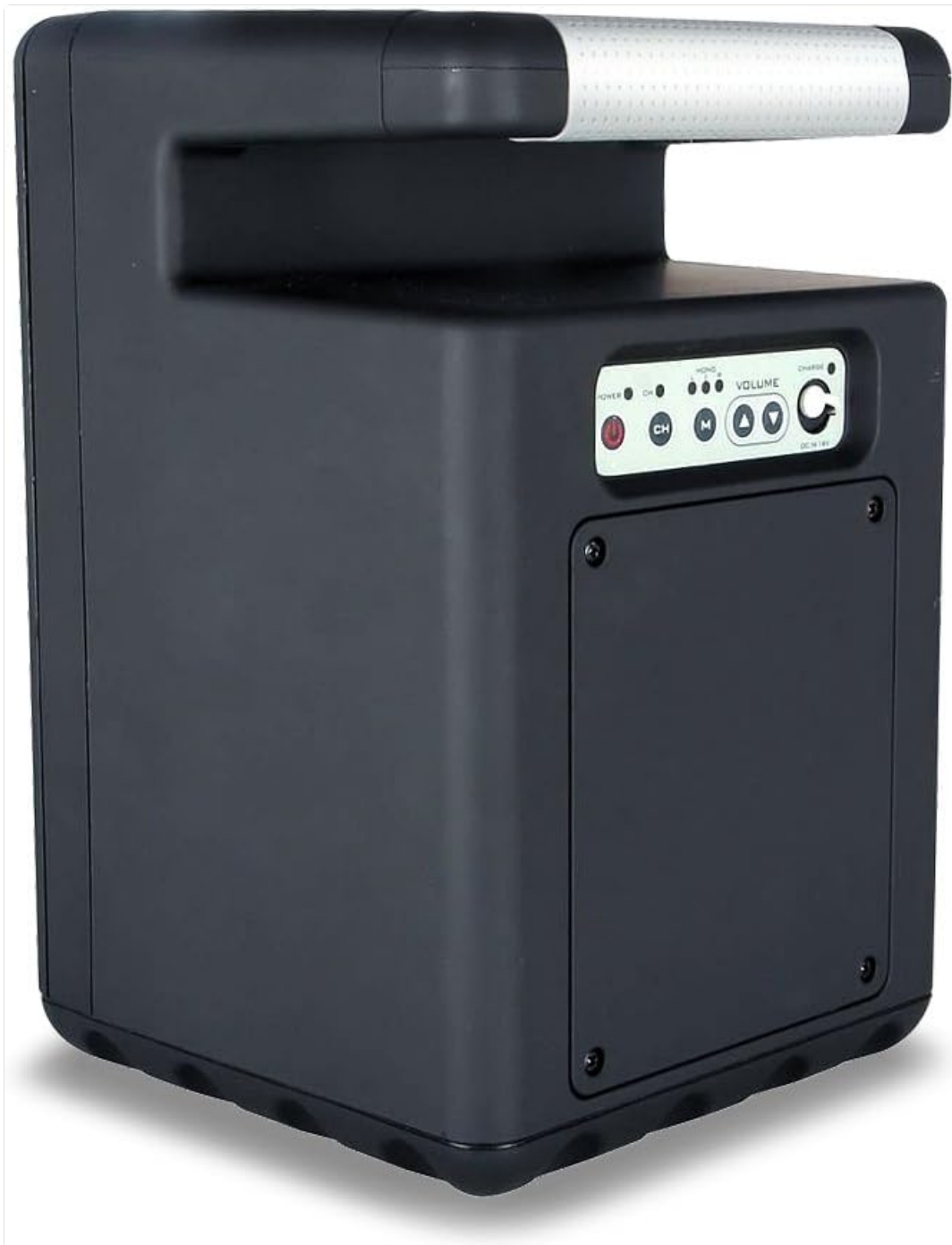
Figure 3.2: Close-up of the speaker's control panel, showing power, volume, Bluetooth, and charging indicators, along with input ports.