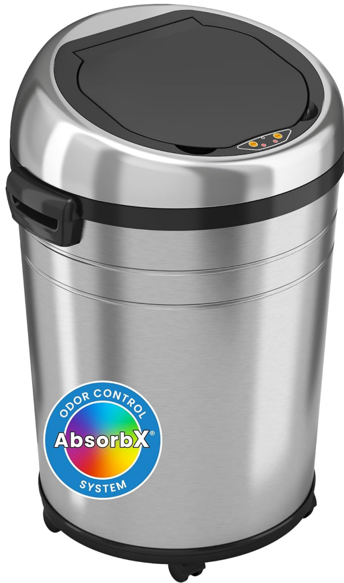
Figure 1: iTouchless 18 Gallon Touchless Sensor Trash Can (Model IT18RC-1)