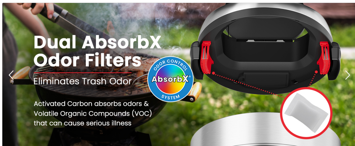
Figure 4: AbsorbX odor filter installation.