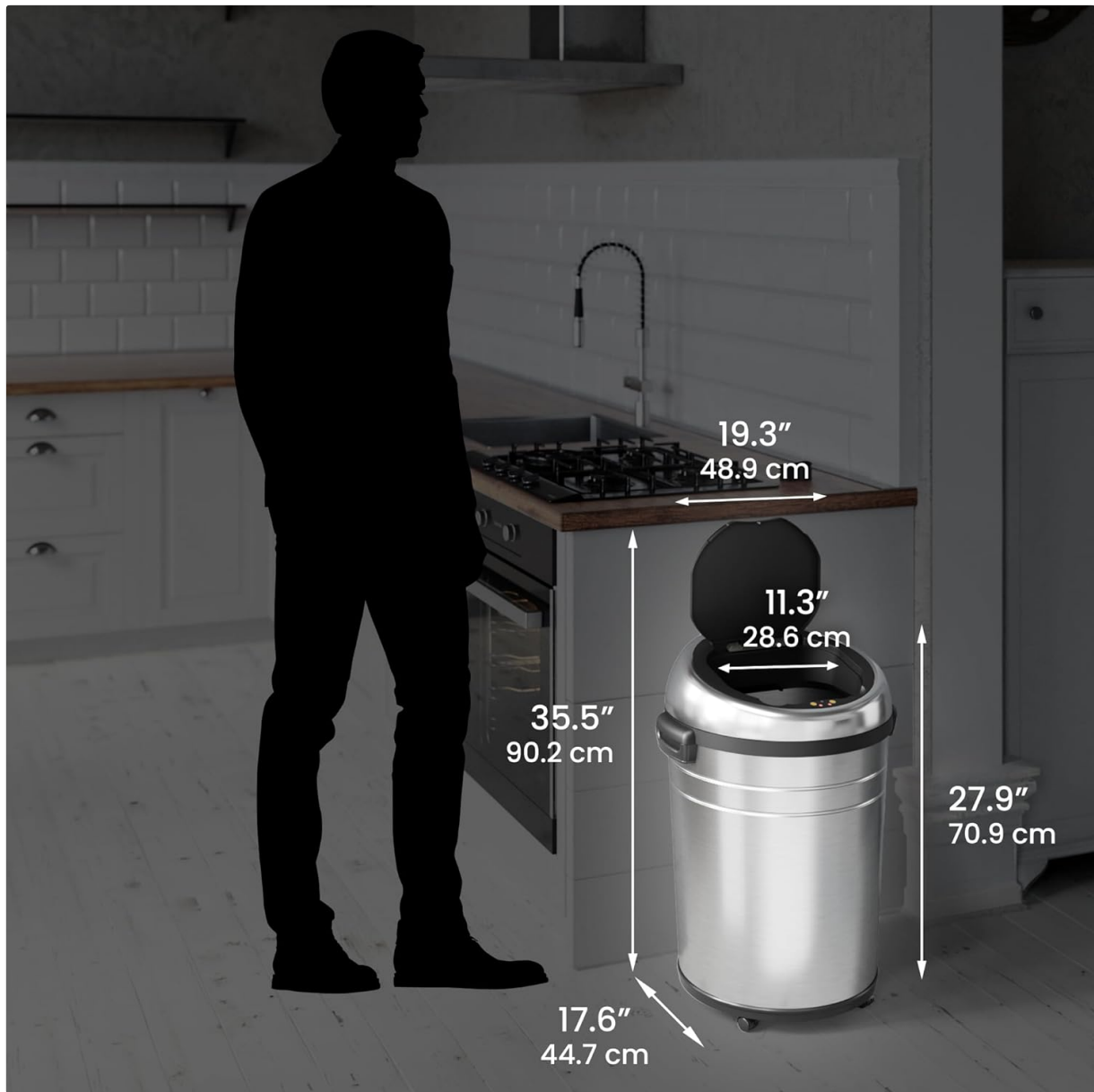
Figure 6: Product dimensions.