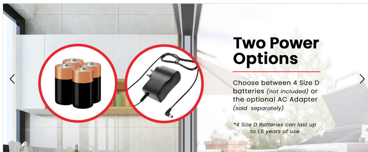
Figure 3: Power options: 4 D-size batteries or optional AC adapter.