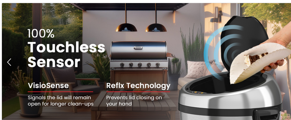
Figure 5: Automatic sensor operation.