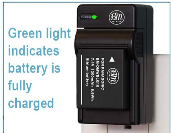
Image: A visual guide demonstrating the charger's LED indicator lights: red for charging and green for a fully charged battery.