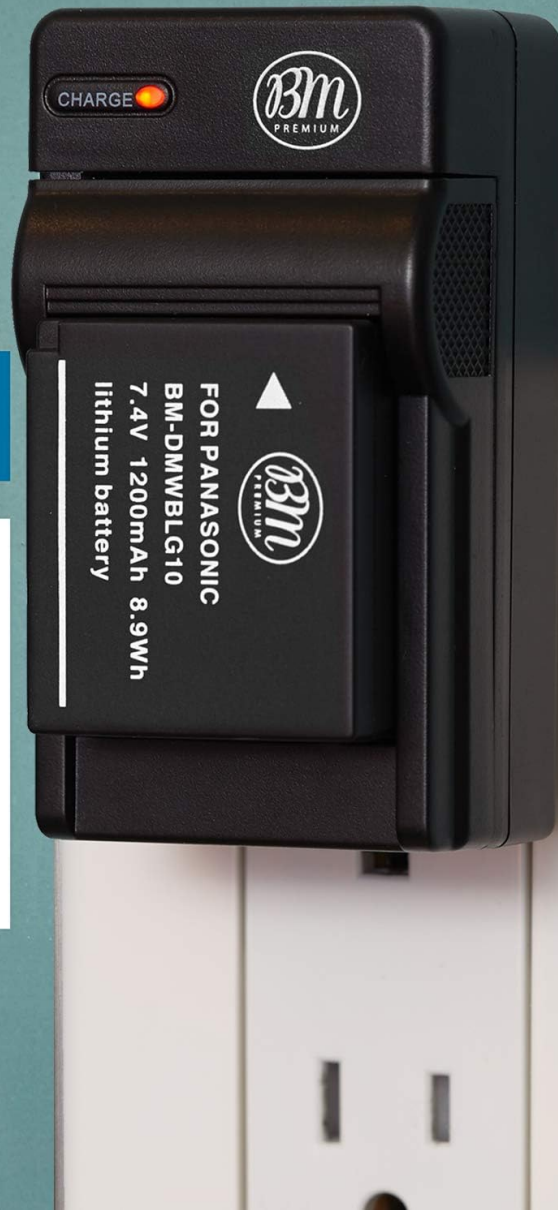
Image: The BM Premium battery charger with a battery inserted, plugged into a standard wall outlet, ready for charging.

Make sure you never miss another once-in-a-lifetime moment by always having a battery ready with BM Premium's Wall Charger