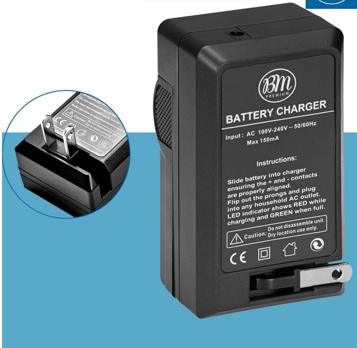
Image: A detailed view of the BM Premium battery charger, showing the input specifications and instructions for use, including how to insert the battery and plug into an AC outlet.