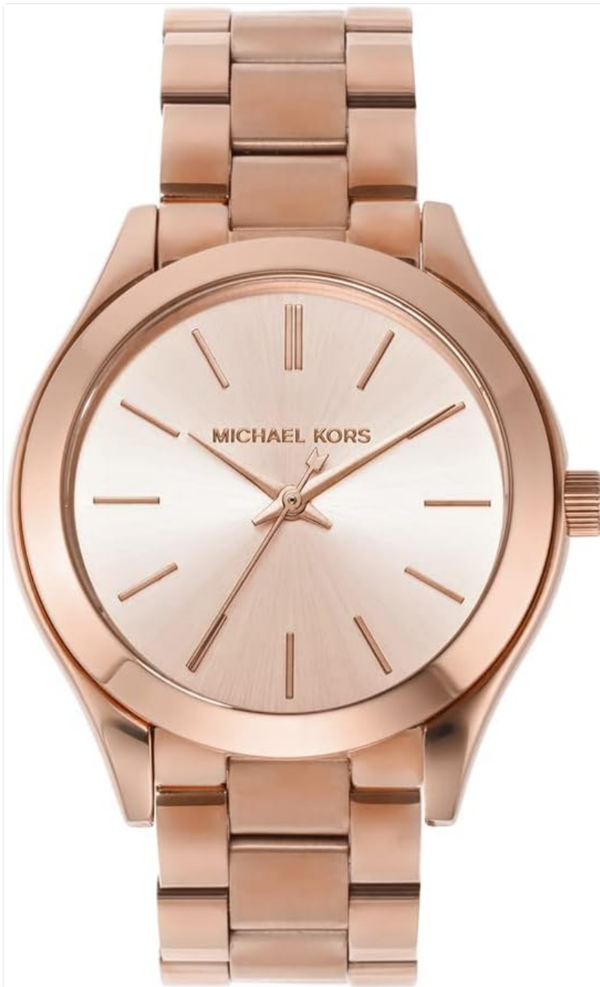
Image: Clear front view of the watch face, showing the hour, minute, and second hands.