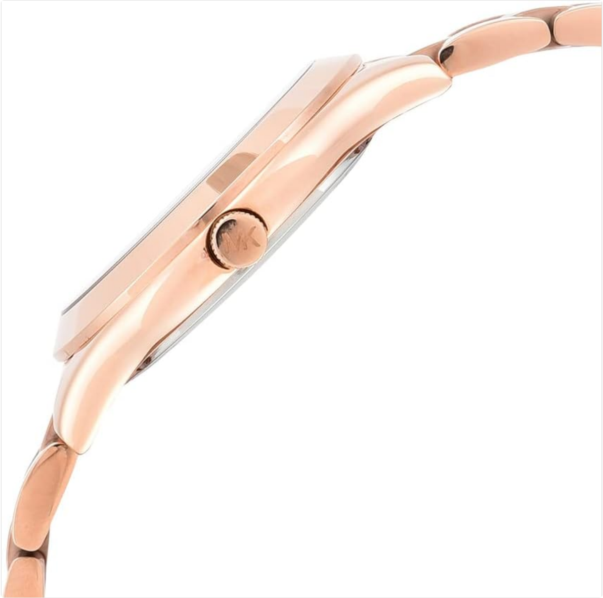
Image: Side view of the watch, highlighting the crown used for time adjustment.