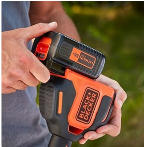
Image 4.1: Demonstrating the insertion of the 36V battery into a compatible BLACK+DECKER tool.