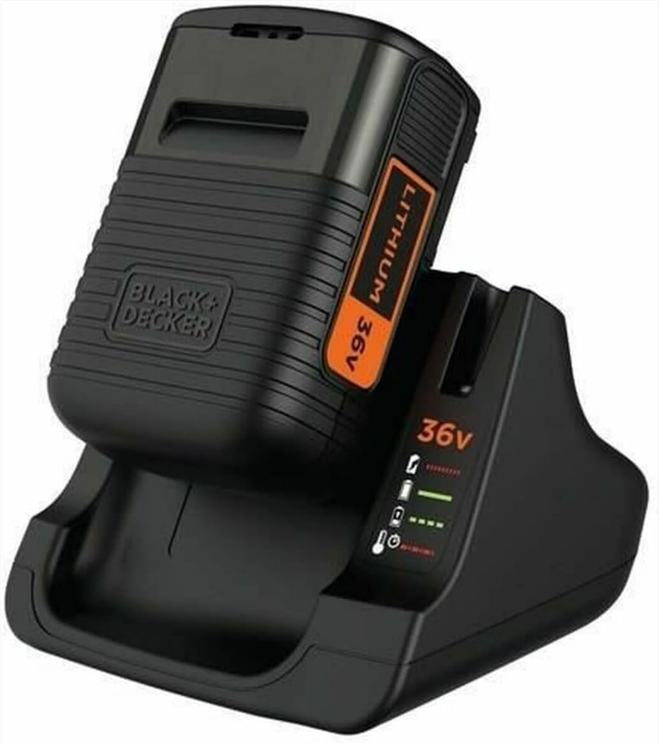
Image 2.1: The BLACK+DECKER 36V 2Ah Lithium Battery and Charger Kit.