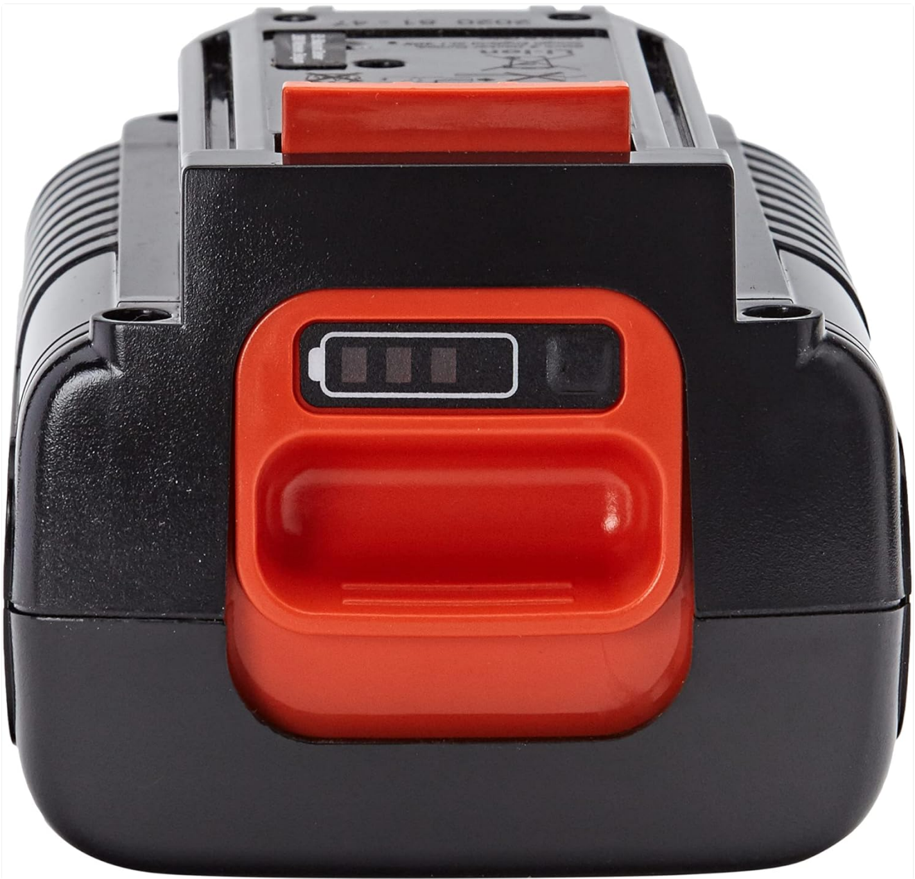
Image 3.2: Top view of the battery showing the charge indicator and release button.