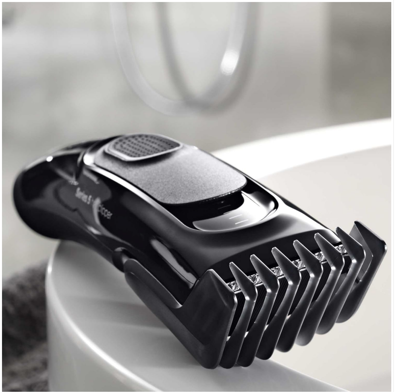
Image: The Braun HC5090 Hair Clipper with a comb attachment securely fitted, ready for use.