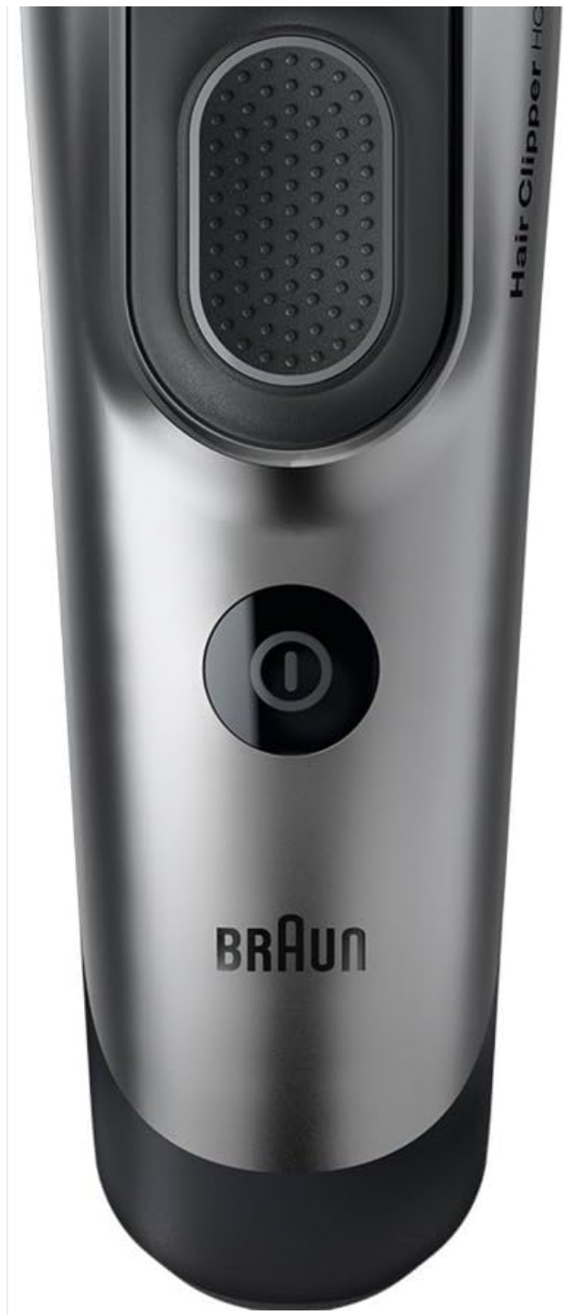
Image: The Braun HC5090 Hair Clipper, a cordless and rechargeable electric cutting machine.