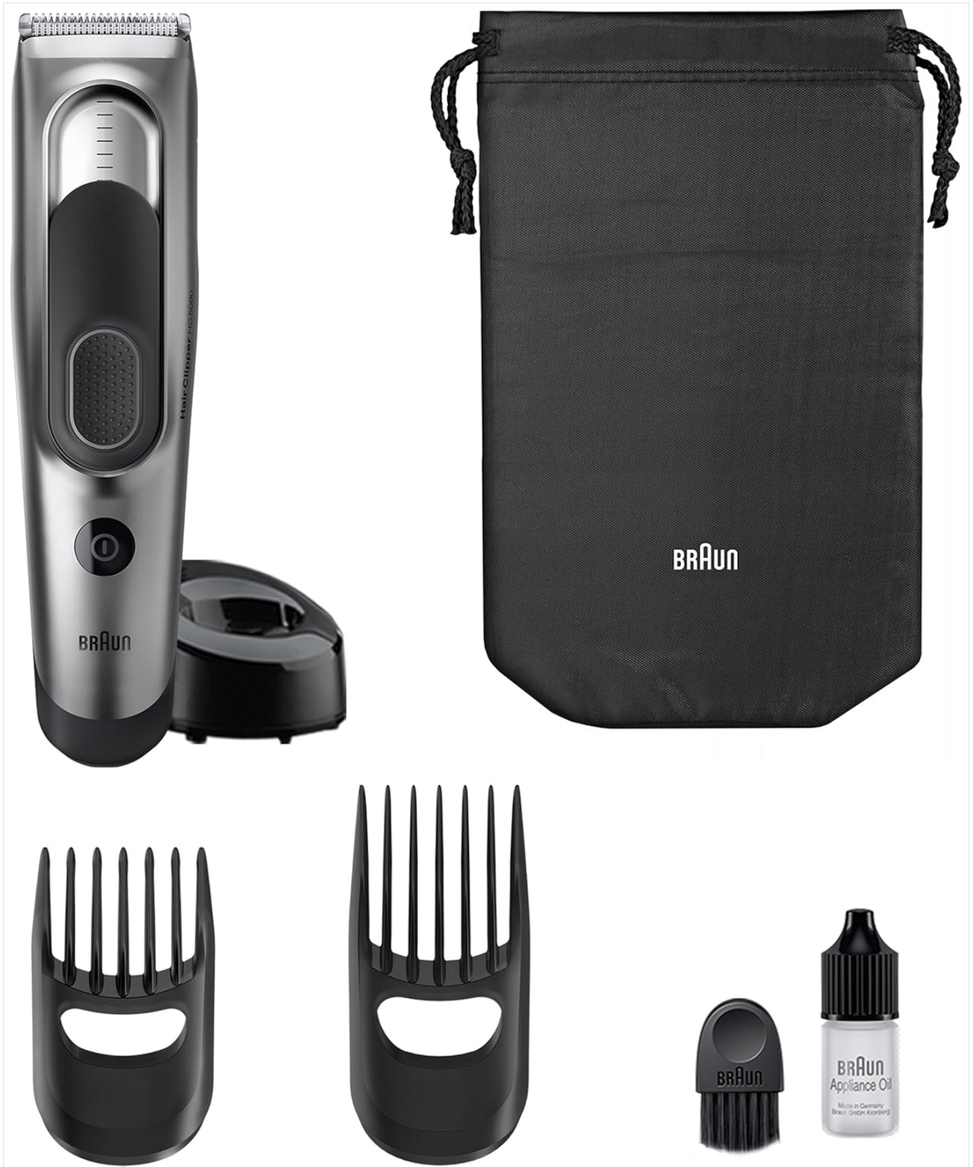
Image: The Braun HC5090 Hair Clipper shown with its charging stand, two comb attachments, cleaning brush, oil bottle, and storage bag.

The Braun HC5090 Hair Clipper comes with several components designed for versatile hair trimming.