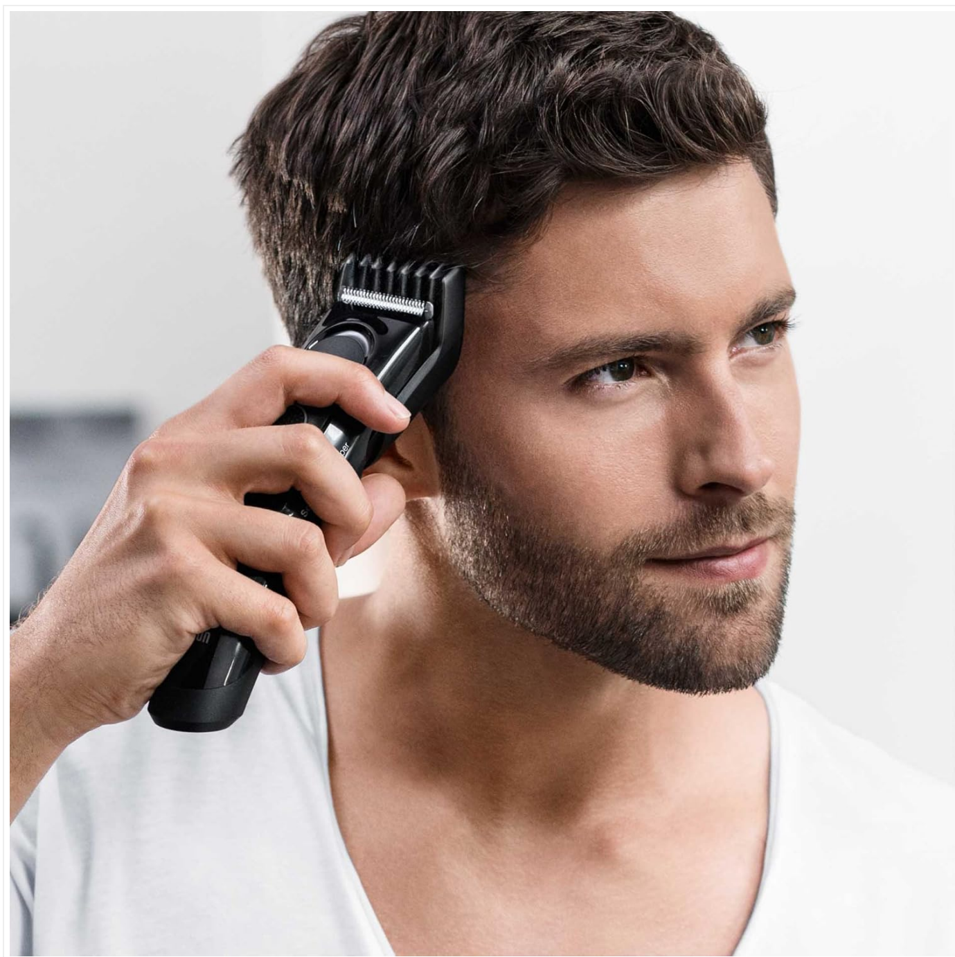
Image: A man using the Braun HC5090 Hair Clipper to trim his hair, demonstrating typical usage.