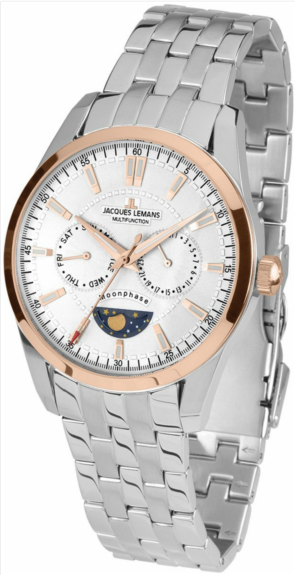
Image 1.1: Front view of the Jacques Lemans Liverpool Moonphase 1-1901 watch, showcasing its white dial, rose gold-coloured indexes, and stainless steel bracelet.