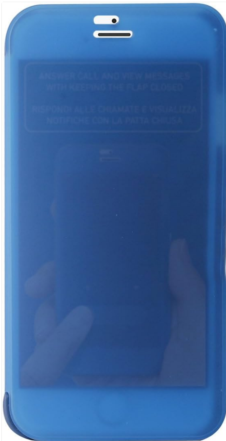
Image: A close-up view of the transparent front flap of the Puro Sense Cover, with text visible through it stating "ANSWER CALL AND VIEW MESSAGES WITH KEEPING THE FLAP CLOSED".