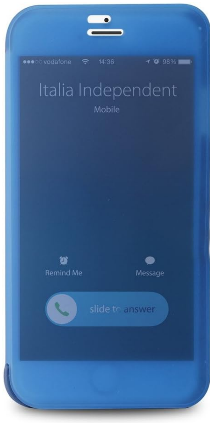
Image: An iPhone 6/6S encased in the Puro Sense Cover, displaying an incoming call screen through the transparent blue front flap. The "slide to answer" prompt is visible.