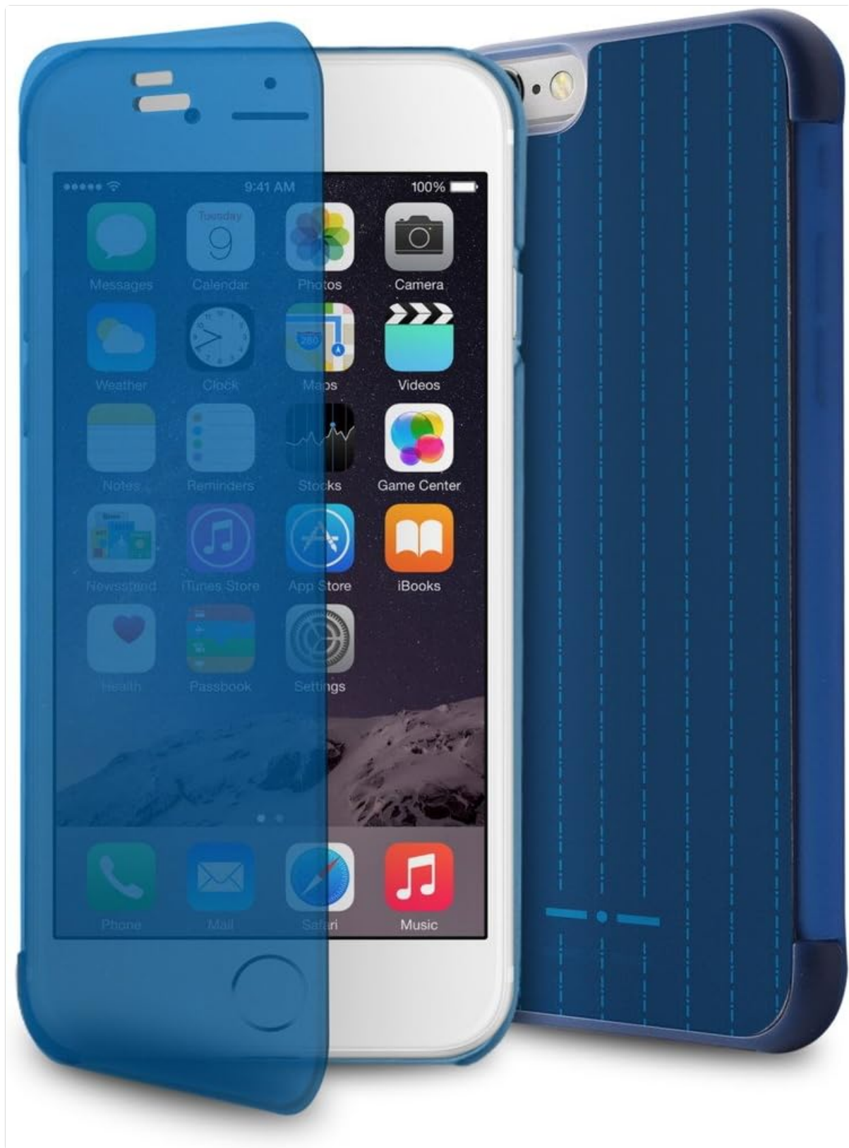
Image: The iPhone 6/6S being placed into the Puro Sense Cover. The phone's screen is visible, and the case's back features a subtle striped pattern.