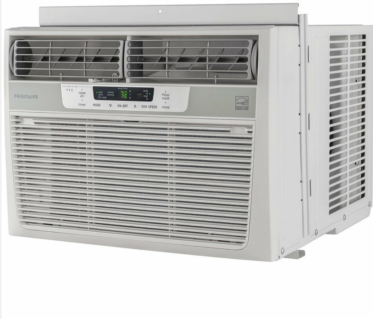
Image: Front view of the Frigidaire 10,000 BTU Window-Mounted Compact Air Conditioner.