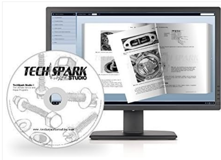
Image 2.2.1: The TechSpark Studio CD-ROM alongside a monitor displaying the software's digital manual interface. This illustrates the product's physical media and its digital output.