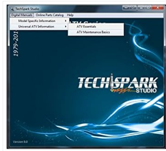
Image 3.3.1: A screenshot of the TechSpark Studio software's main menu, highlighting options such as 'Digital Manuals', 'Online Parts Catalog', and 'Help'. This illustrates the software's navigational structure.