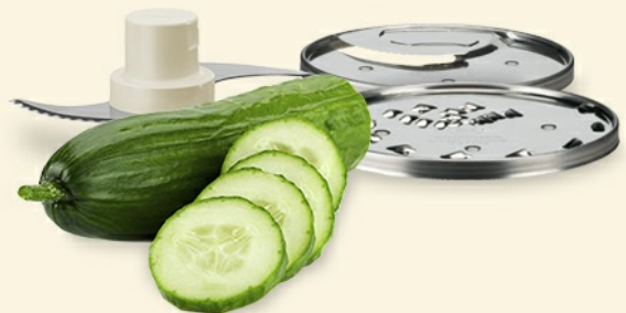
Figure 3: Various blades and discs for different food preparation tasks.

Switch seamlessly from slicing to shredding to chopping.