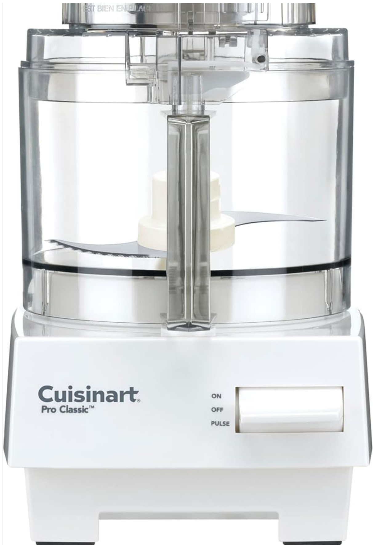
Figure 1: Cuisinart 7-Cup Pro Classic Food Processor.