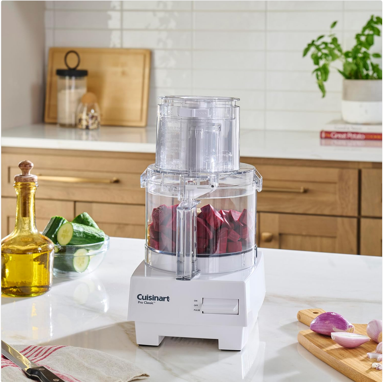
Figure 2: Food processor placed on a kitchen countertop.