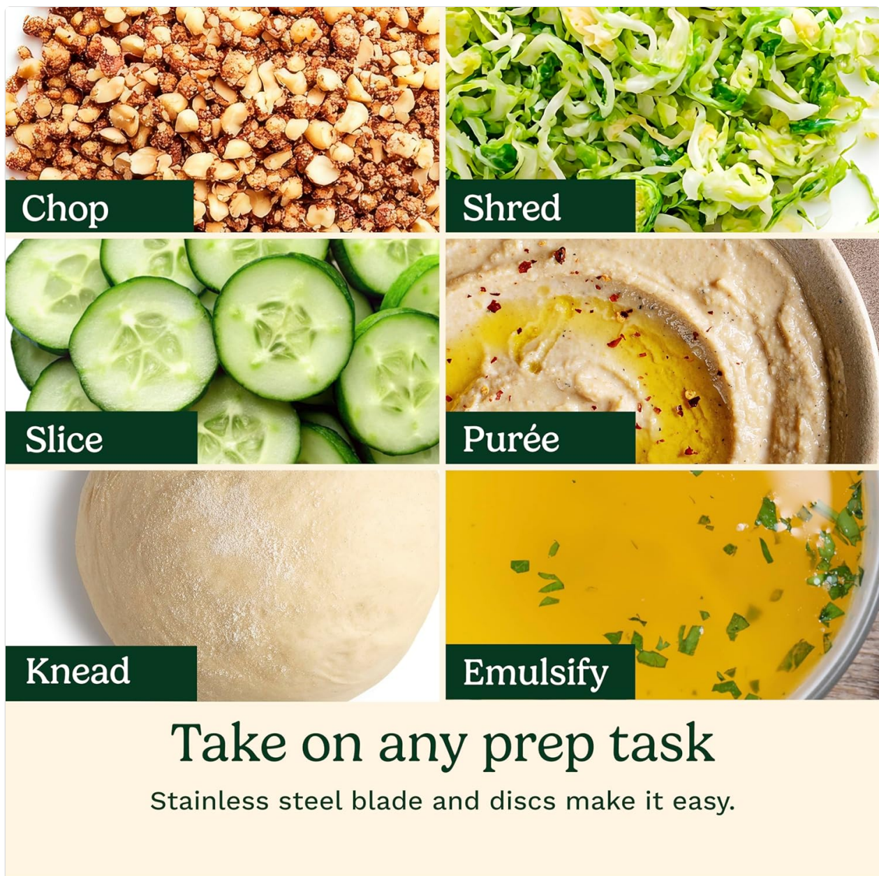
Figure 6: Examples of various food preparation tasks achievable with the food processor.