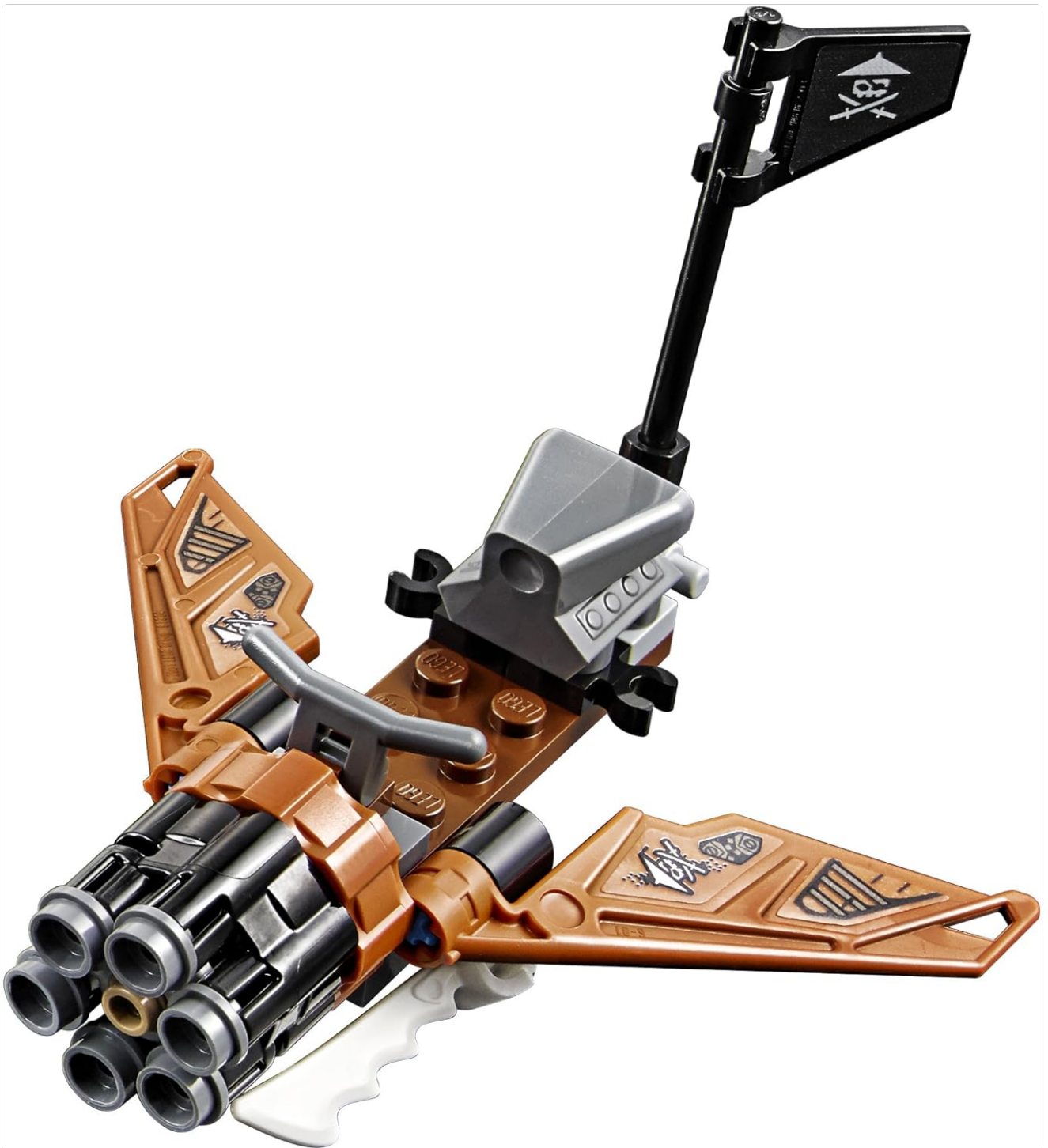
Image 3.2: A close-up view of the assembled pirate flyer with its rapid shooter.