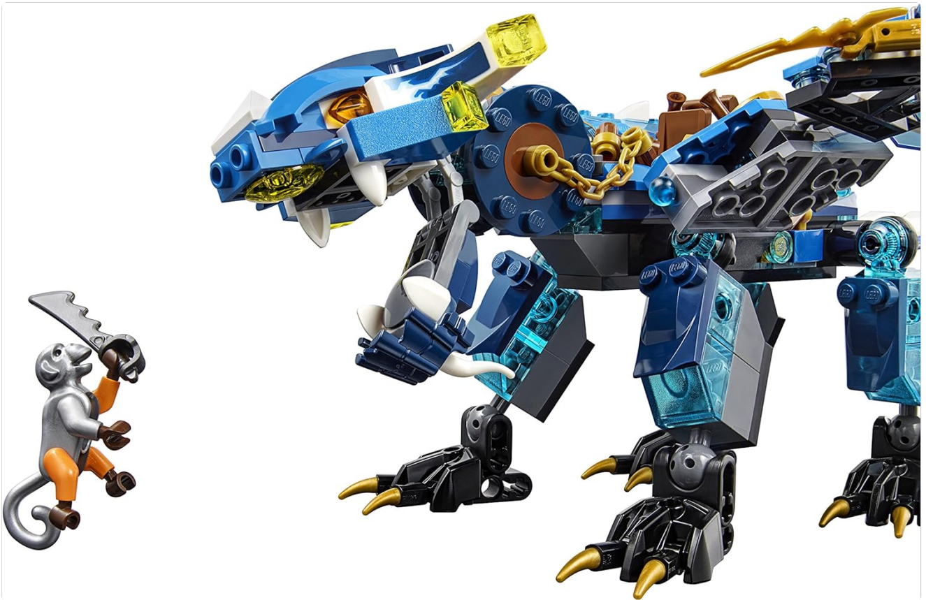
Image 4.1: The Elemental Dragon in a dynamic pose, ready for interaction with minifigures like Monkey Wretch.