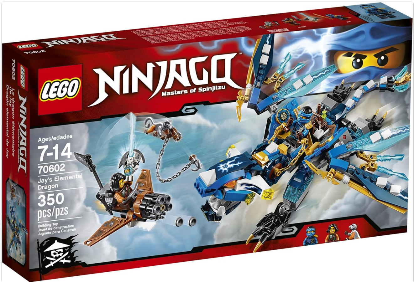
Image 1.1: Front view of the LEGO Ninjago Jay's Elemental Dragon 70602 packaging, showing the assembled dragon, pirate flyer, and minifigures.