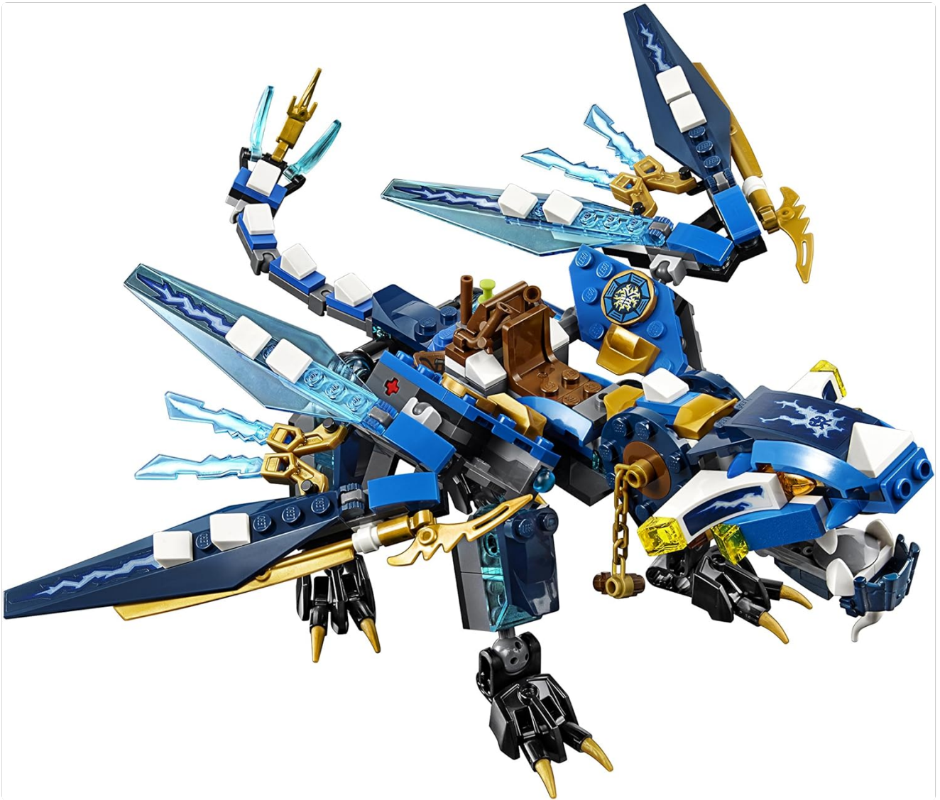
Image 3.1: The fully assembled Jay's Elemental Dragon, showcasing its posable features.