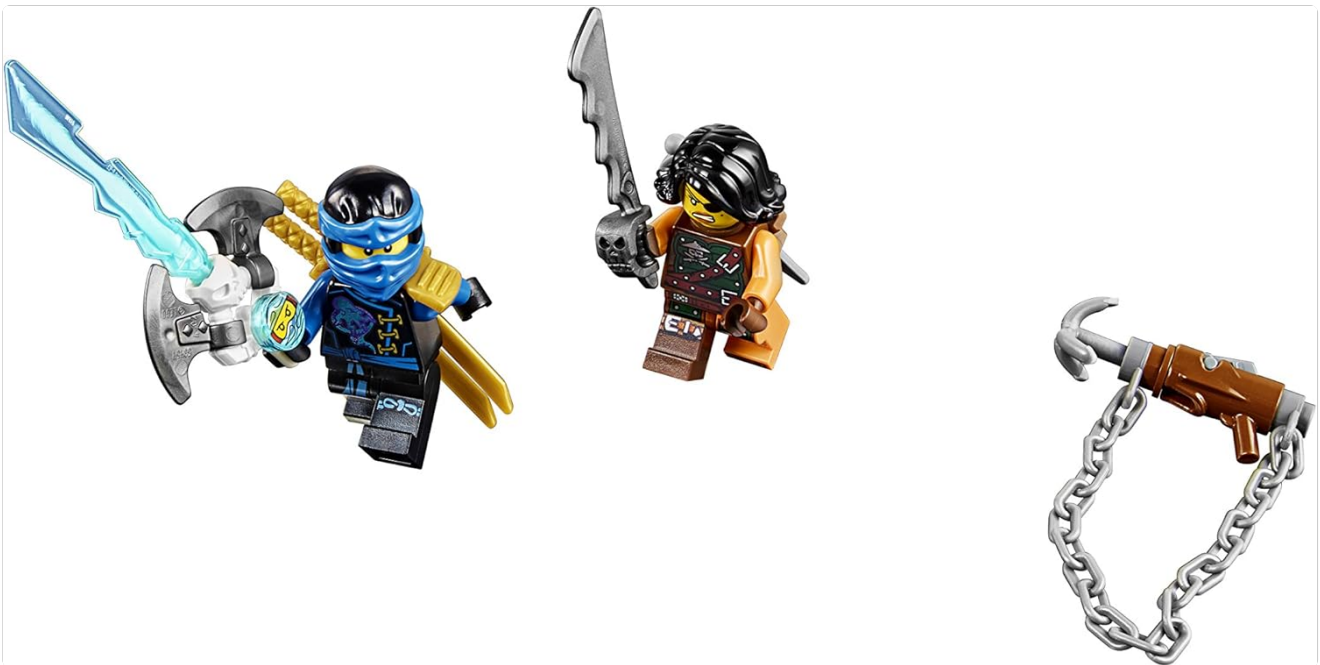
Image 3.3: Jay and Cyren minifigures with their weapons, including the Djinn Blade and harpoon hook.