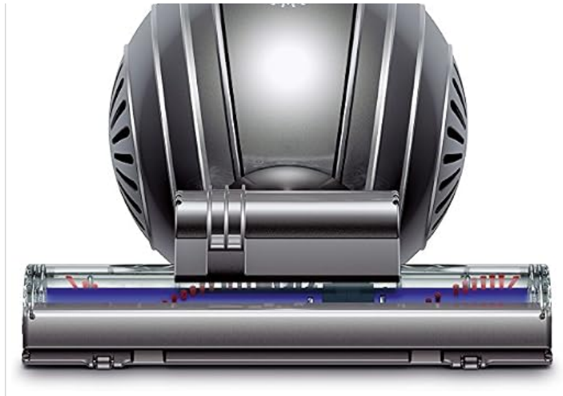
Figure 3.1: The fully assembled Dyson Cinetic Big Ball Animal Plus Allergy Vacuum, ready for use.