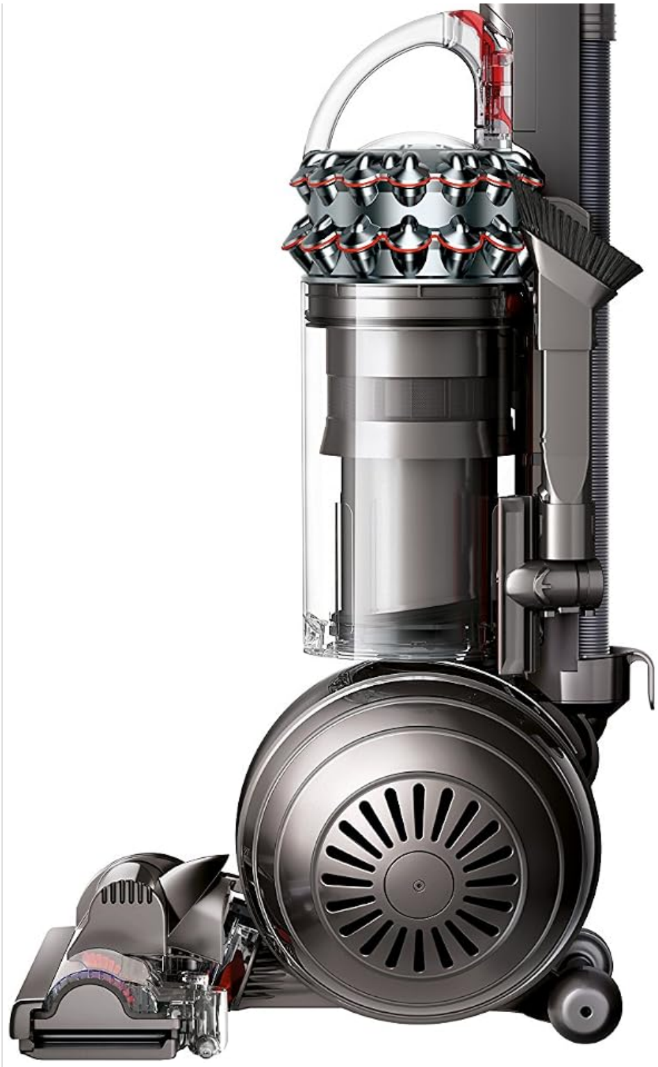
Figure 2.2: Side view of the vacuum, highlighting the Dyson Ball technology and hose attachment point.