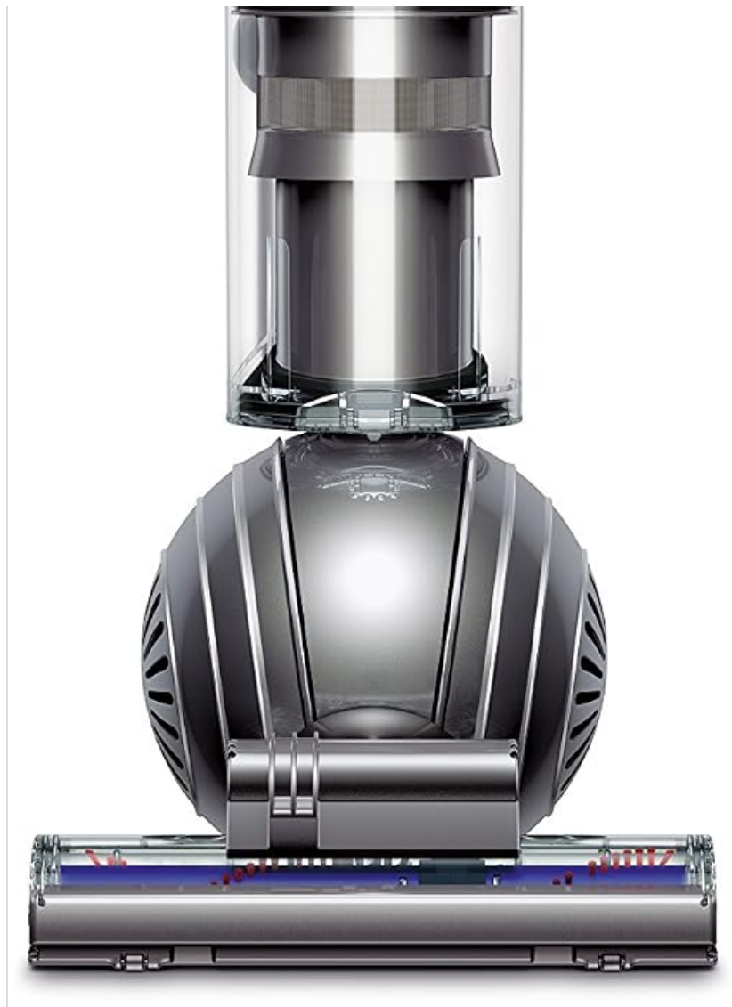
Figure 2.1: Front view of the Dyson Cinetic Big Ball Animal Plus Allergy Vacuum, showcasing its upright design and clear dust bin.