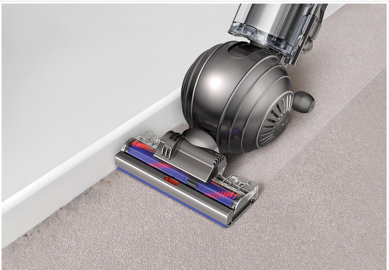
Figure 4.2: The vacuum head positioned to clean close to a wall or baseboard.