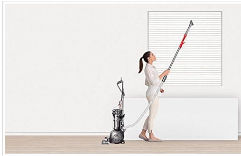
Figure 4.4: A user extending the vacuum wand with an attachment to clean high surfaces, demonstrating the reach of the tools.