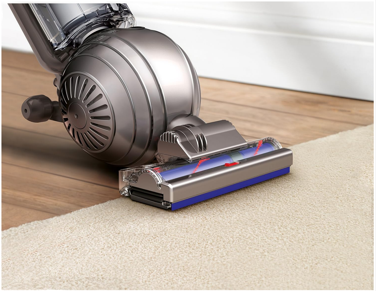
Figure 4.1: The vacuum head effectively cleaning a carpeted surface.