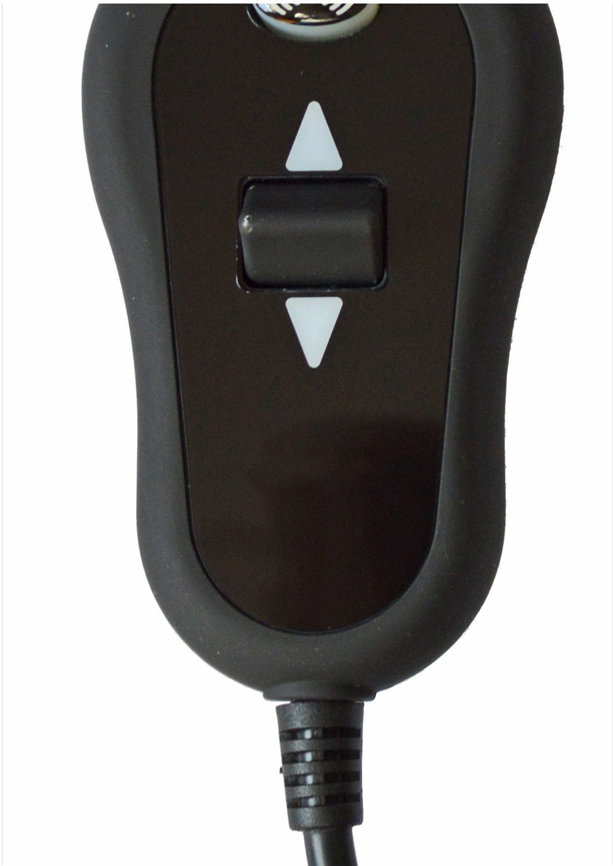
Figure 1: Front view of the Raffel Systems HC-6601-FR4 Hand Control, showing the recline toggle switch and massage button.

The control typically connects via a 5-pin DIN connector, providing a secure and reliable connection to your furniture's motor system.