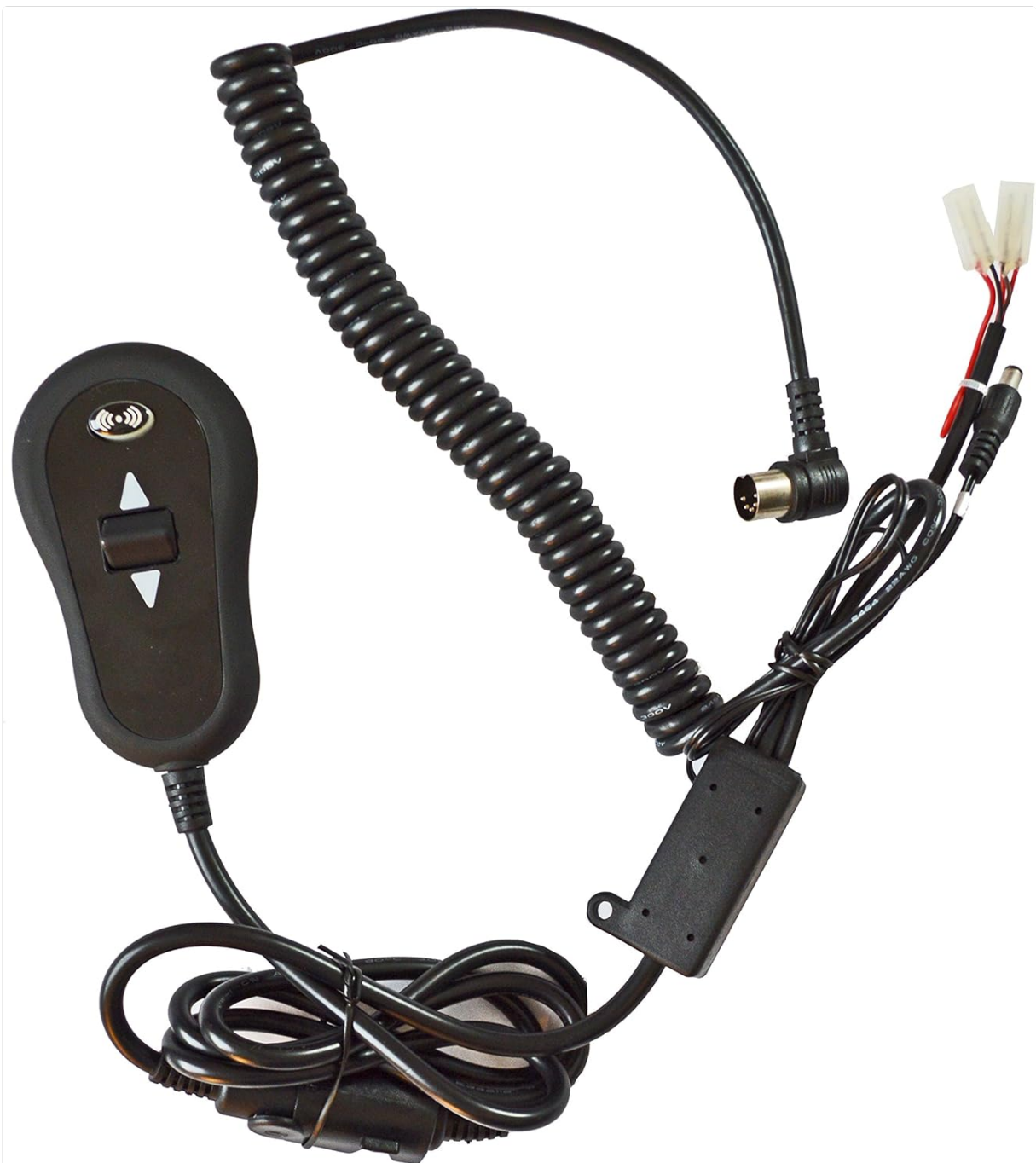
Figure 3: Raffel Systems HC-6601-FR4 Hand Control showing the full wiring harness, including the 5-pin connector and additional wires for power and massage functions.

For a visual guide on connecting a similar lift chair remote control, please refer to the video below: