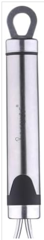
Figure 2: Close-up view of the Bergner MACHATEUR handle. This image focuses on the upper part of the masher, showing the stainless steel handle, the black grip accent, and the integrated hanging loop.