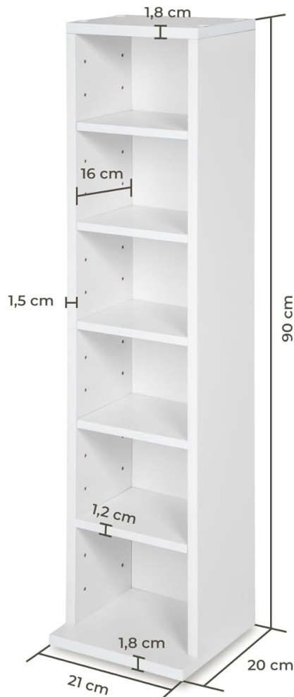
Image 3: Detailed dimensions of the tectake storage unit, including overall height, width, depth, and panel thicknesses.

Étagère Matériel de montage Instructions de montage