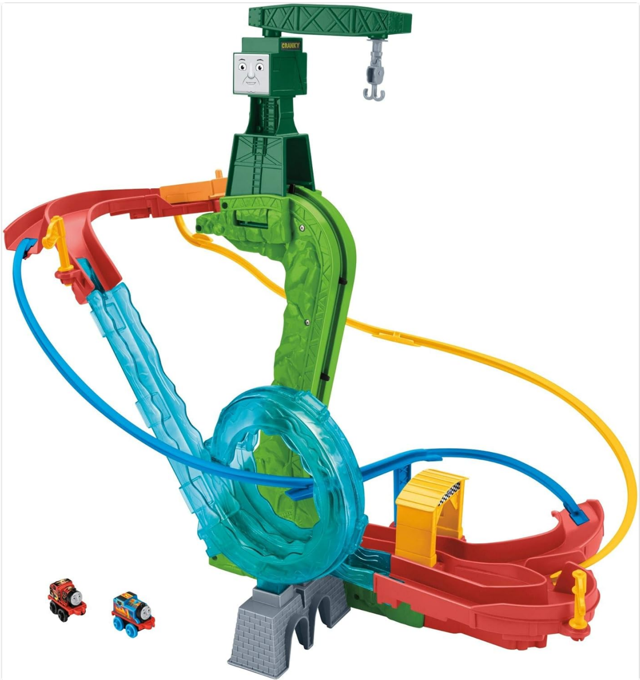
Image 1.1: The complete Thomas & Friends MINIS Motorized Raceway playset, showcasing its various tracks and features.