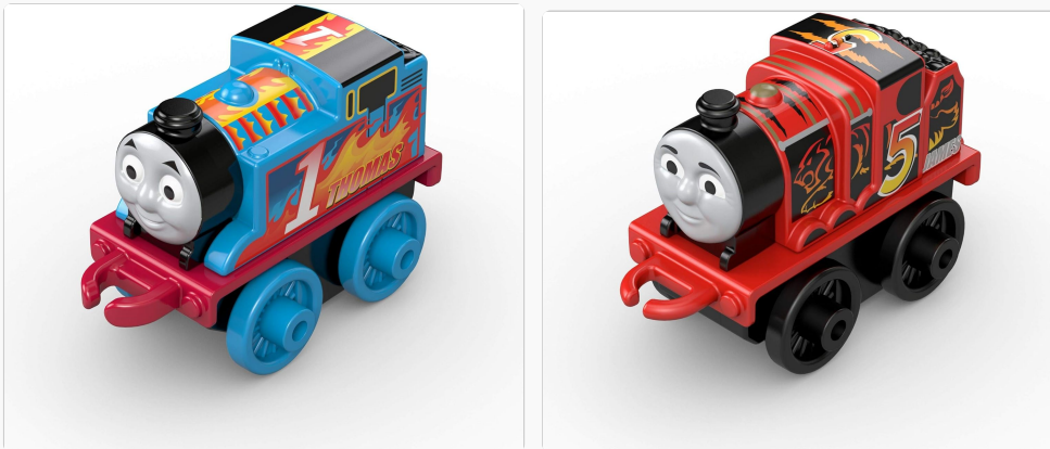
Image 3.1: The included Thomas and James MINIS engines, ready for action on the raceway.