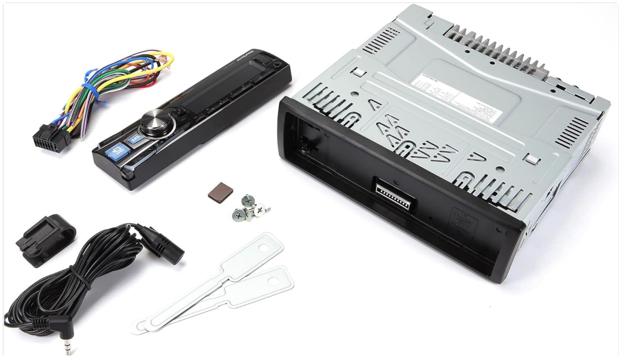
Image: Contents of the Alpine UTE-73BT package, showing the main unit, remote control, wiring harness, microphone, and mounting accessories.