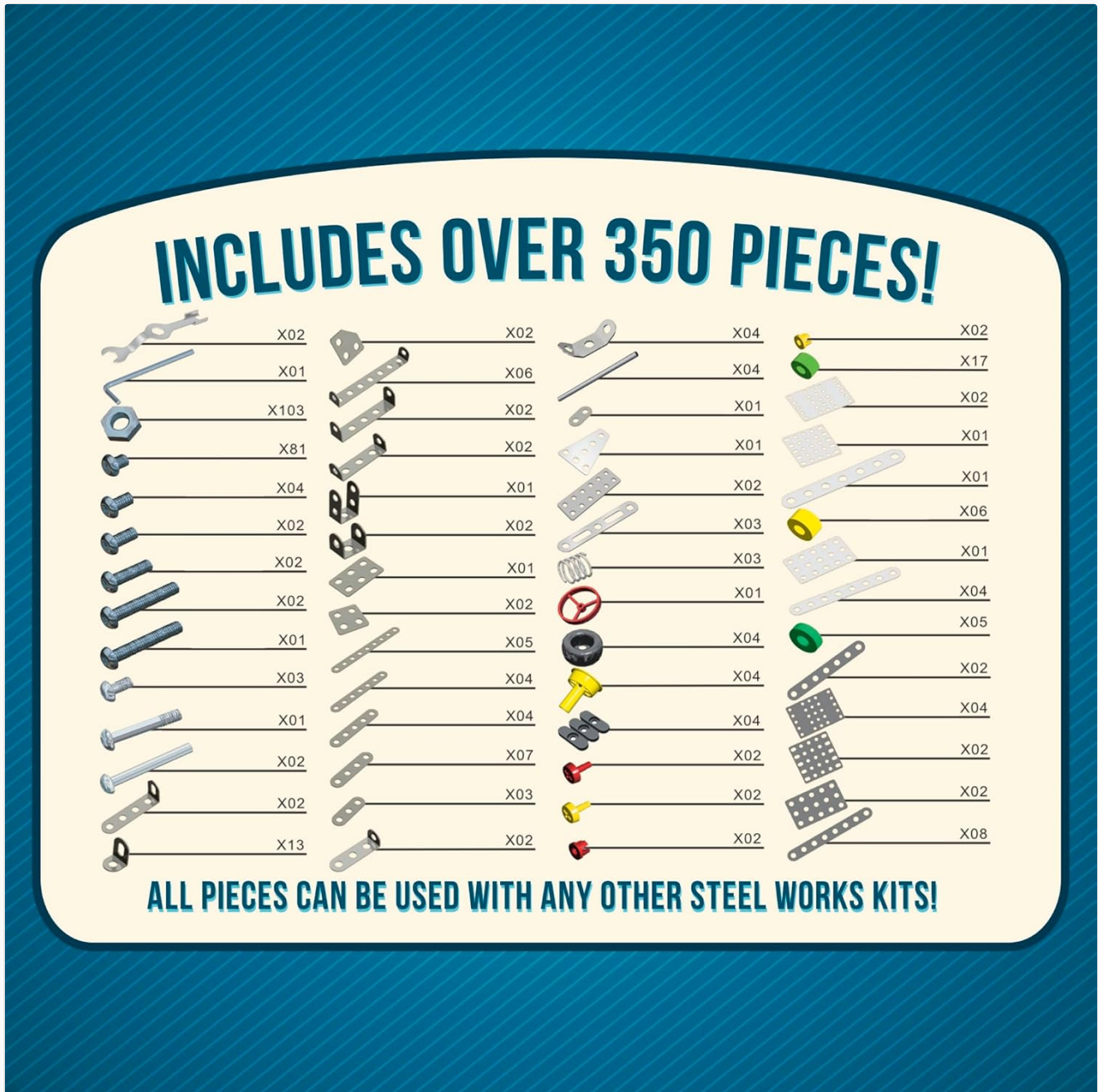
Image 3.1: A comprehensive diagram illustrating the various types and quantities of over 350 pieces included in the Steel Works kit. This includes different sizes of metal plates, beams, screws, nuts, washers, wheels, and assembly tools like wrenches.

Your Schylling Steel Works 4x4 Vehicle set includes over 350 pieces, comprising various steel components, fasteners, and specialized tools necessary for assembly. Please verify that all components listed below are present before beginning assembly.