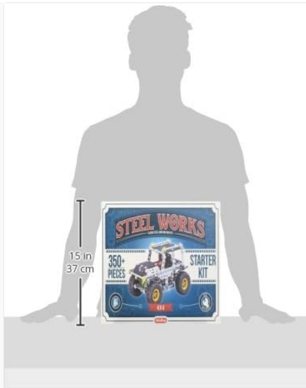
Image 8.2: The product packaging shown next to a human silhouette, providing a visual reference for the box dimensions, which are approximately 15 inches (37 cm) in height.