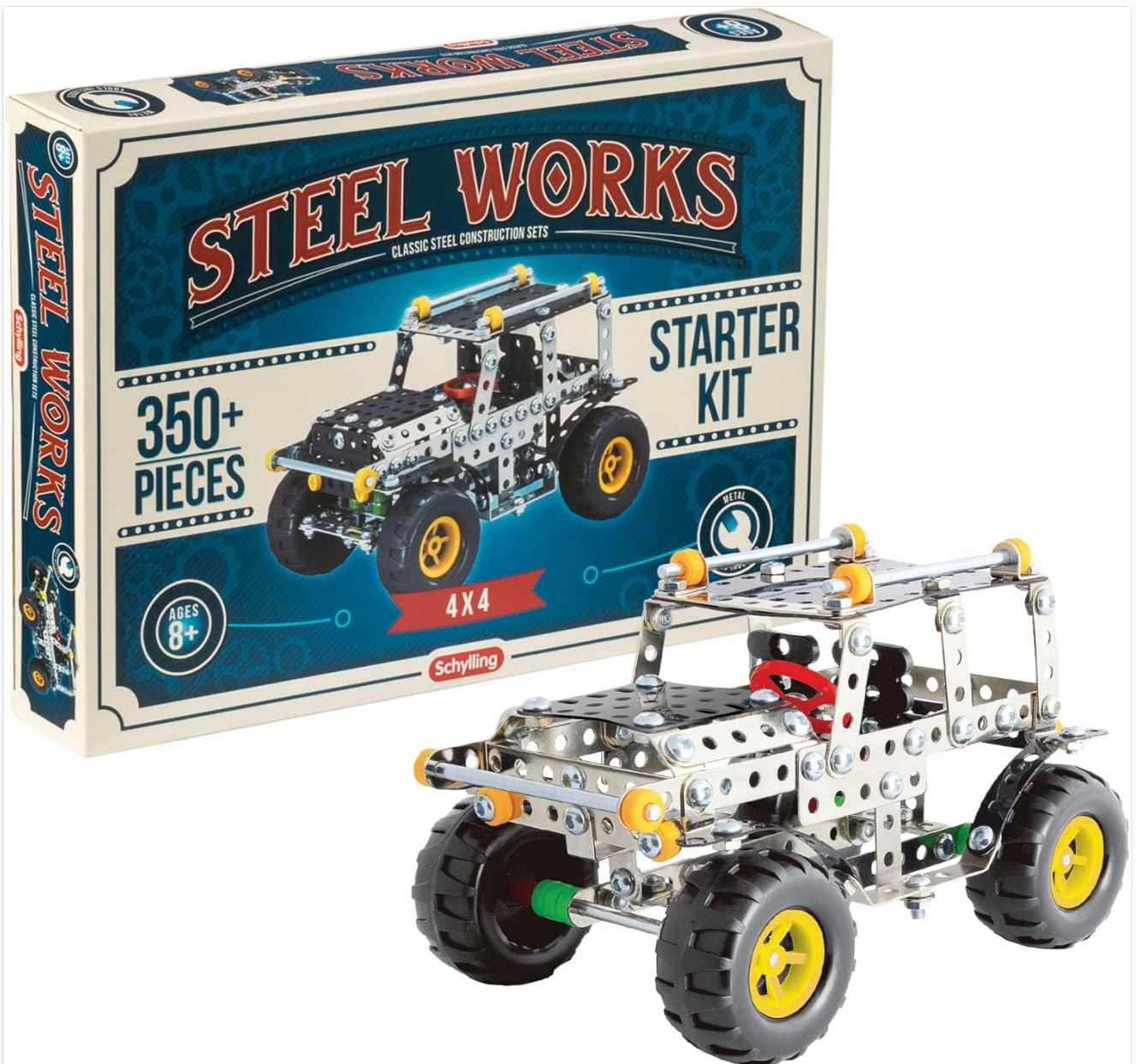
Image 1.1: The Schylling Steel Works 4x4 Vehicle set, showing the product packaging and the fully assembled model. The box indicates '350+ Pieces' and 'Ages 8+'.