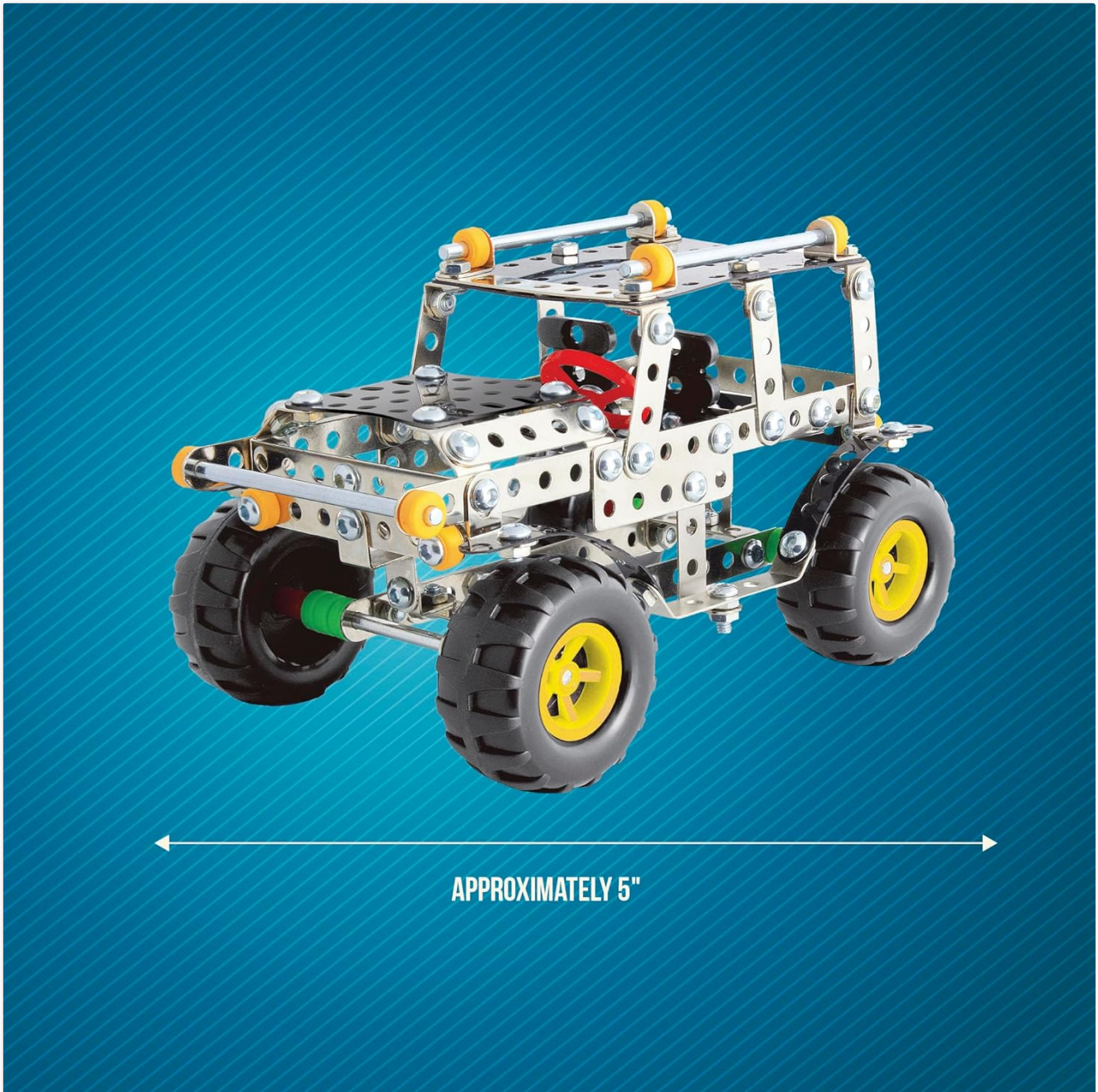
Image 8.1: The assembled Steel Works 4x4 Vehicle, illustrating its approximate length of 5 inches.