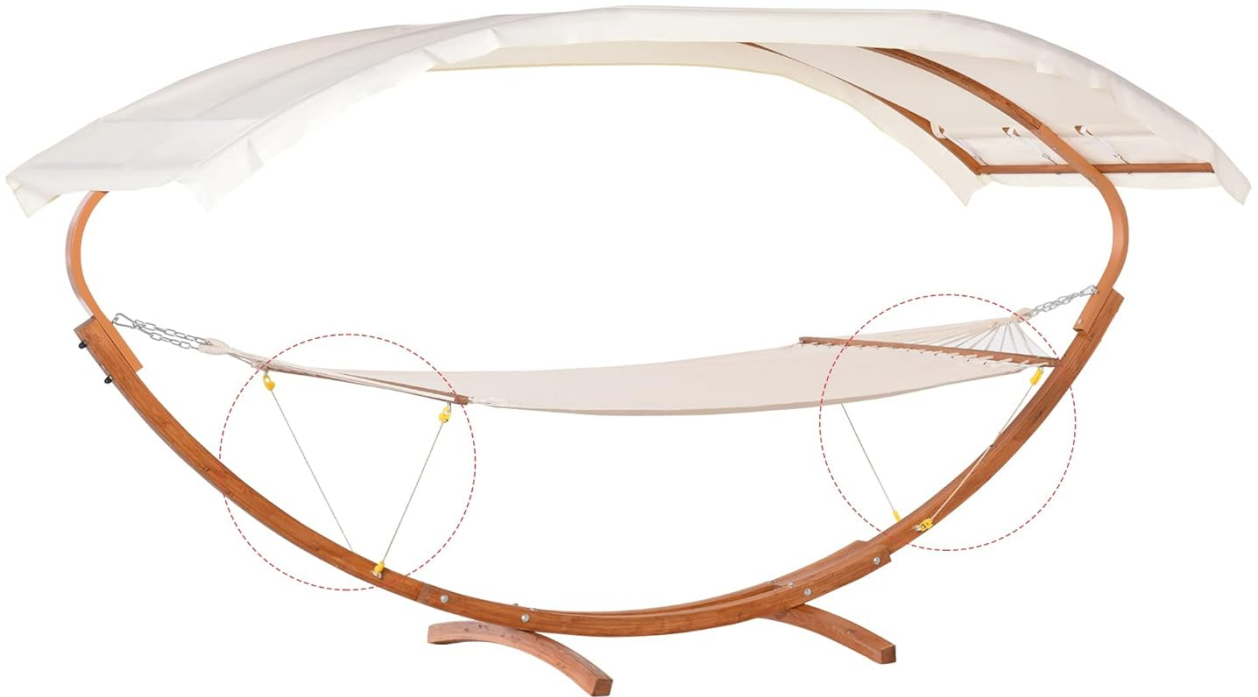
Figure 4.3: Illustration of the four extra safety ropes for enhanced stability.