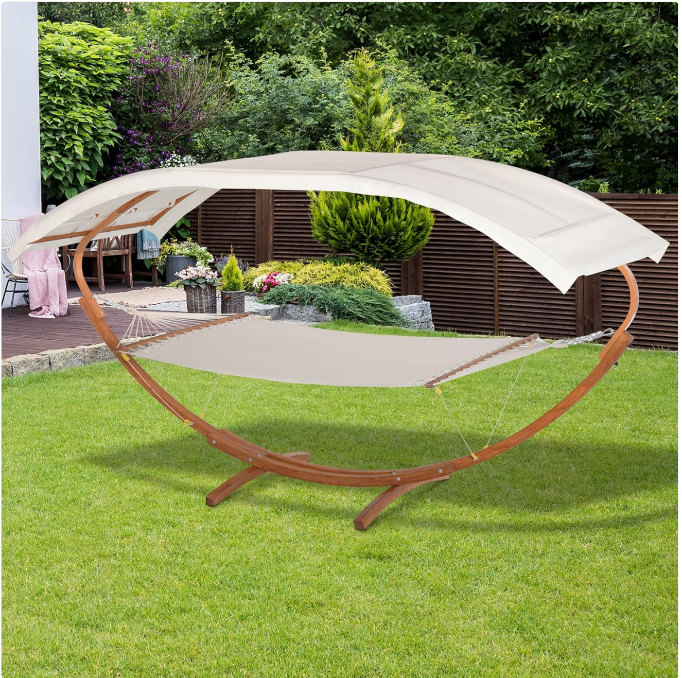
Figure 4.1: Initial assembly of the wooden hammock stand.