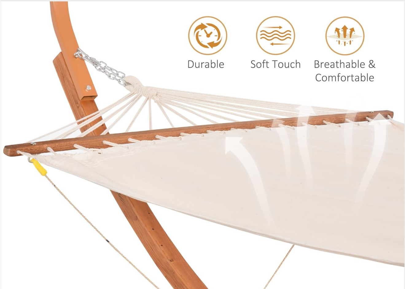
Figure 5.2: The breathable and comfortable hammock bed material.