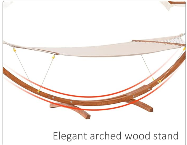
Figure 4.2: Details of the sturdy and stable construction elements.