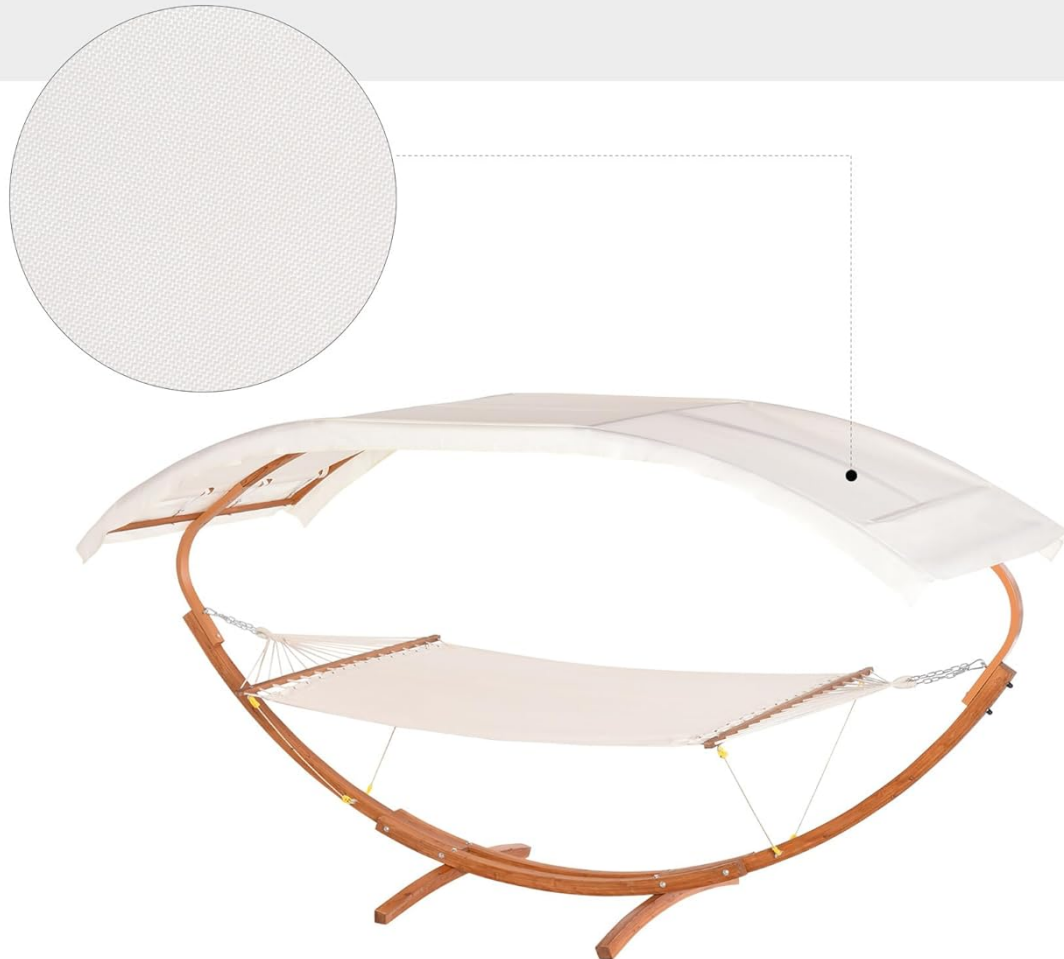
Figure 5.1: The practical sun shade canopy in use.