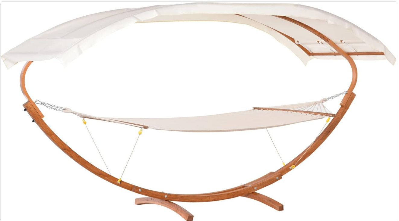
Figure 1.1: The Outsunny Outdoor Hammock with Stand and Sun Shade Canopy.

Thank you for choosing the Outsunny Outdoor Hammock with Stand and Sun Shade Canopy. This manual provides essential information for the safe assembly, operation, and maintenance of your new hammock. Please read all instructions carefully before use and retain this manual for future reference.