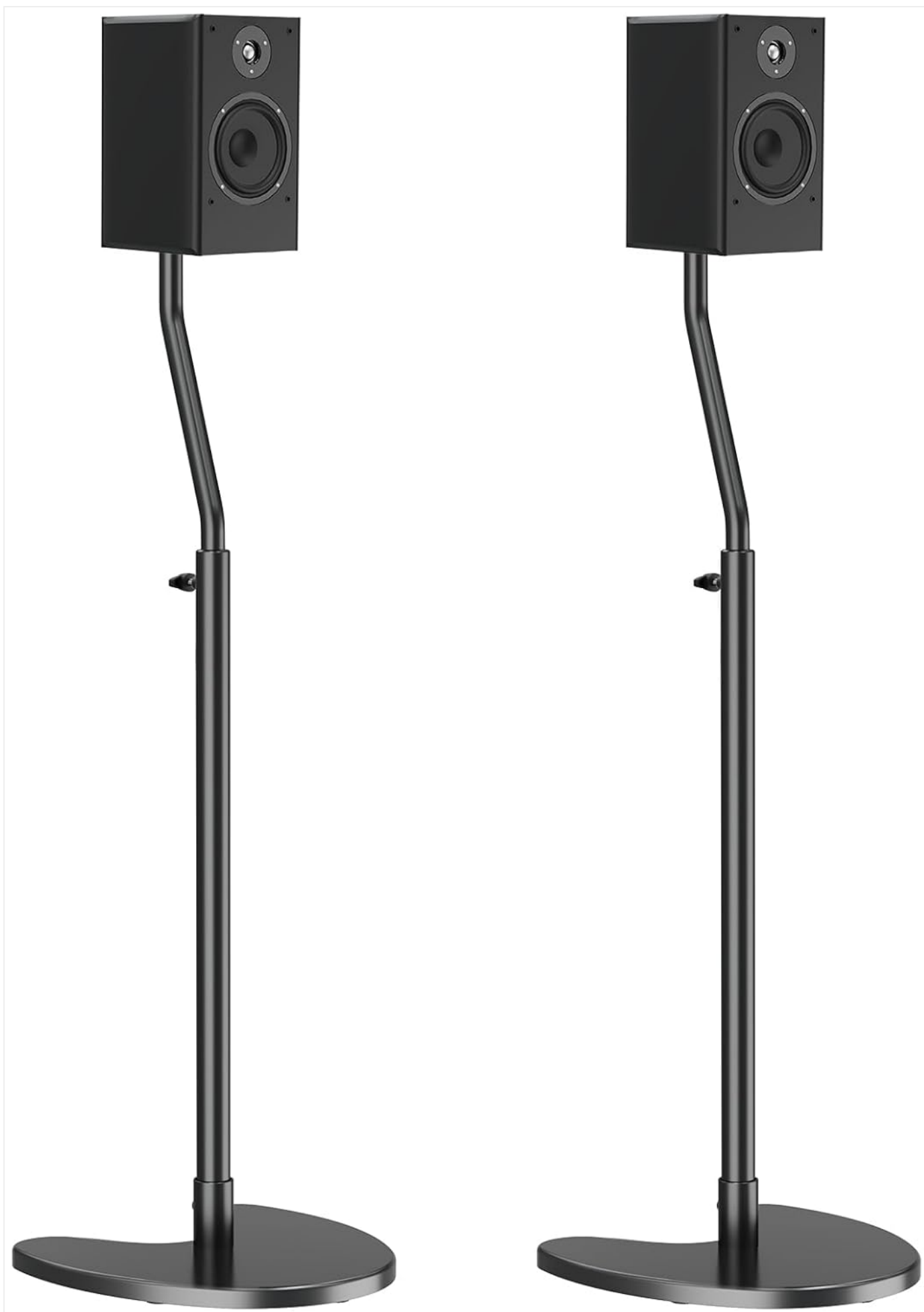
Image: Two Mounting Dream MD5401 speaker stands with speakers, showcasing their design and application.