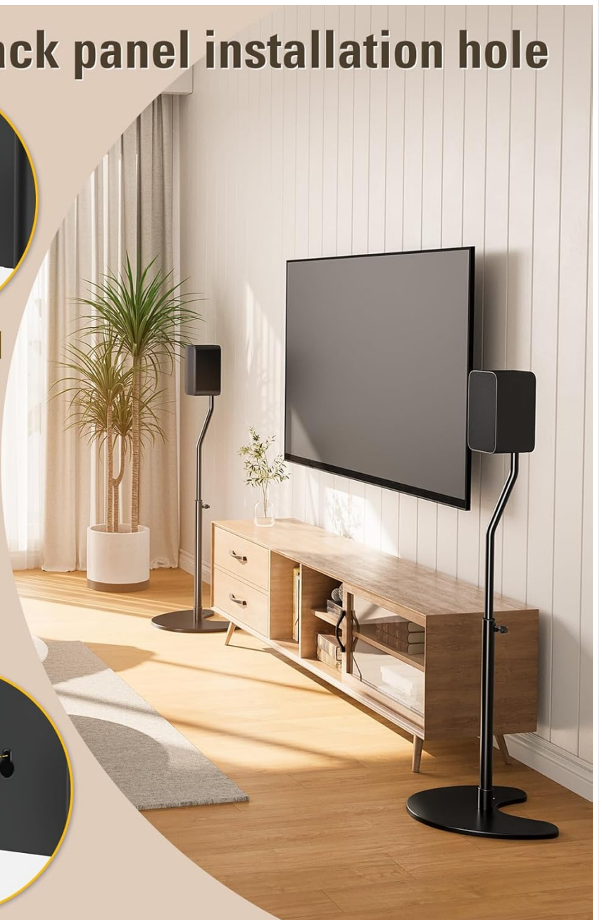
Image: Speaker attachment methods, including flat panel hole, inset hole, and keyhole options.