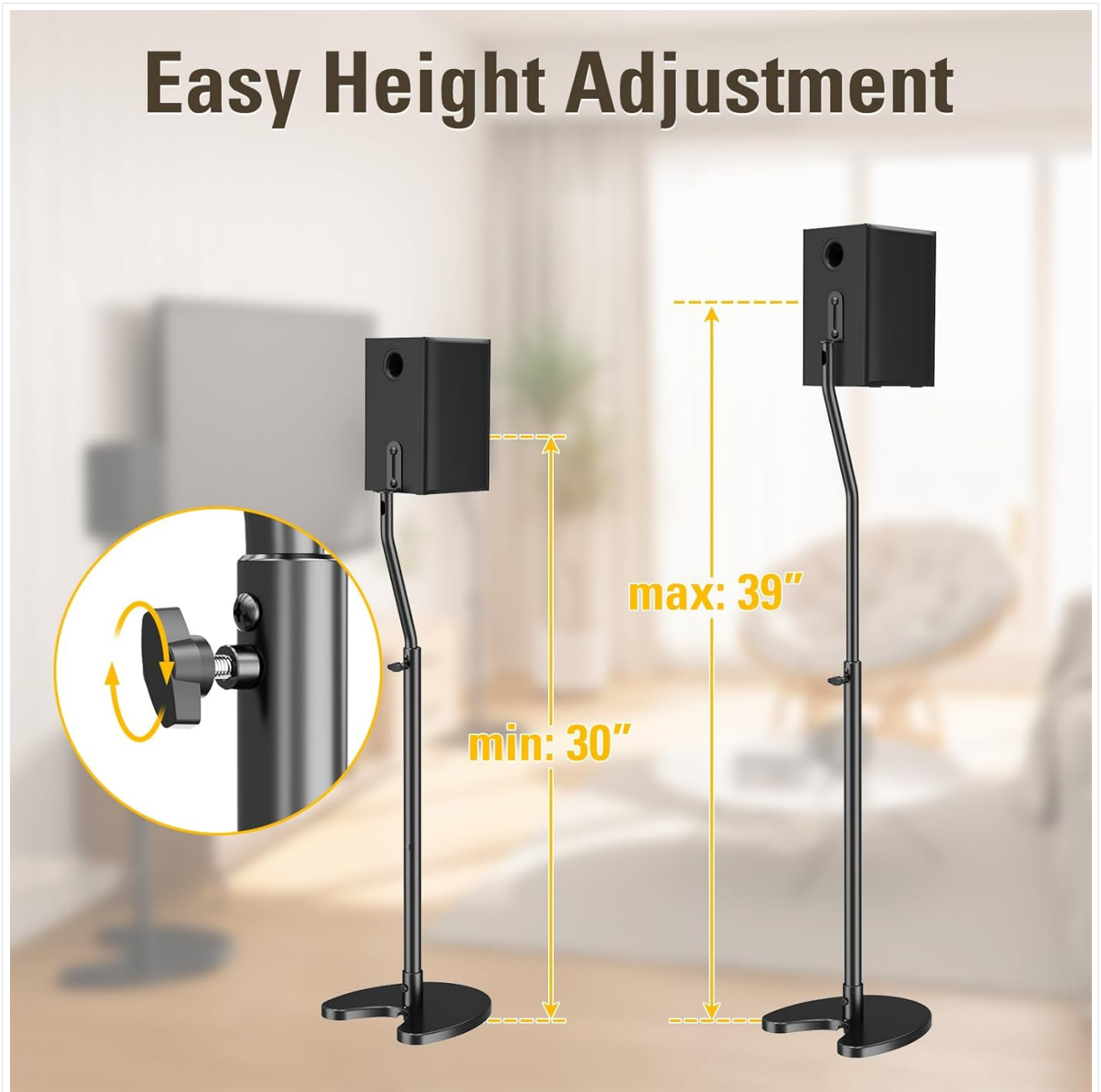
Image: Visual guide for adjusting the speaker stand height.