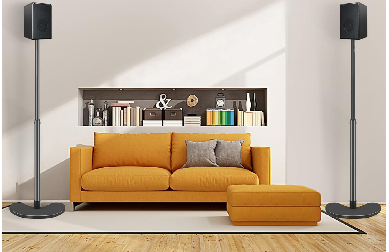
Image: Speakers positioned at optimal listening height for an immersive audio experience.