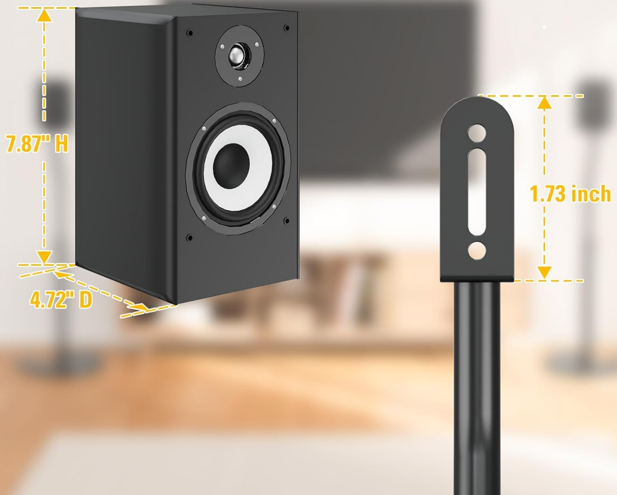
Image: Recommended speaker size and mounting plate dimensions for compatibility.