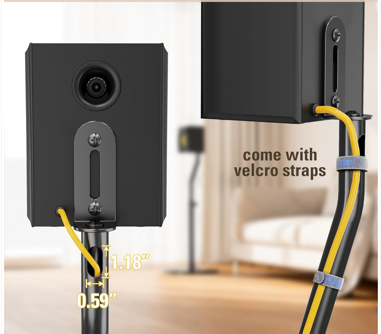
Image: Detail of the cable management system with a cable routed through the stand.