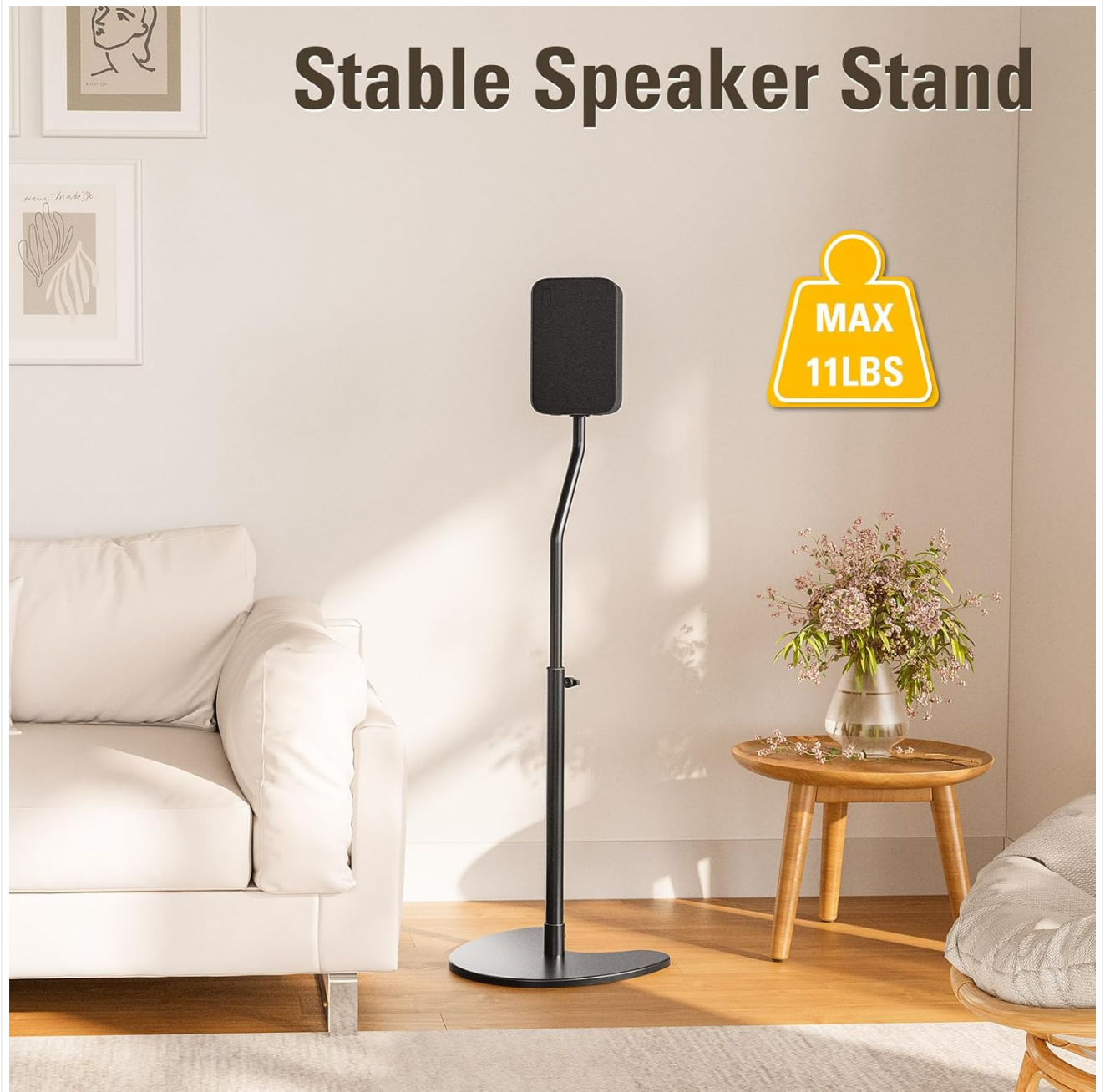
Image: The speaker stand demonstrating its stability and 11 lbs weight capacity.